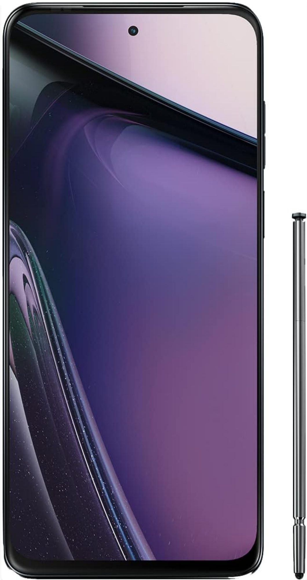
The phone's large and vibrant display, ideal for media consumption and stylus interaction.