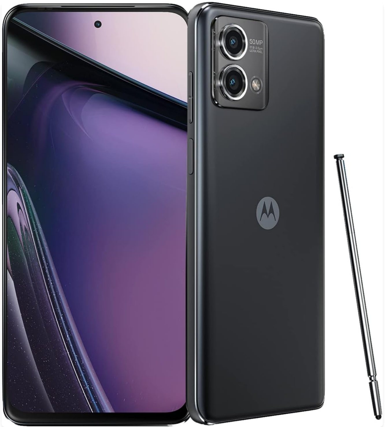
The Motorola Moto G Stylus 5G (2023) in Cosmic Black, showcasing its sleek design and the accompanying stylus.