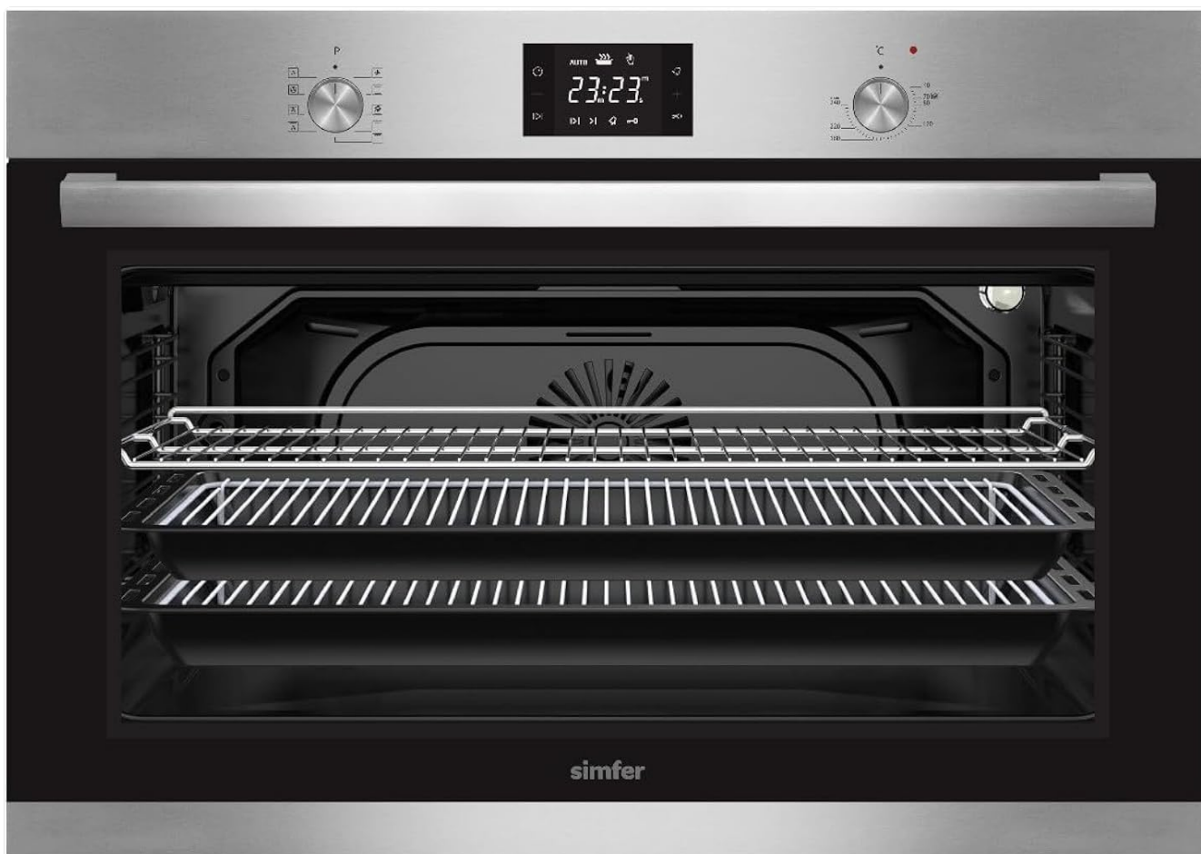
Figure 1.1: Front view of the Simfer Built-In Electric Oven, showcasing the stainless steel finish, control knobs, and digital display.

The Simfer Built-In Electric Oven (Model: B9109DERM) is a 90 cm appliance designed for seamless integration into your kitchen cabinetry. It offers 10 versatile cooking functions, a generous 104-liter capacity, and is equipped with dual turbo fans for efficient heat distribution. Key features include a digital touch timer, a triple-layer glass door for enhanced insulation and safety, and an easy-clean interior.