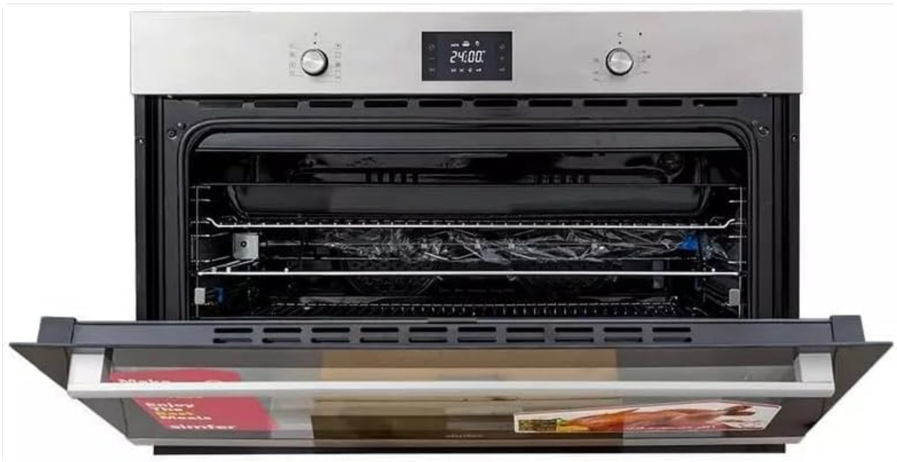
Figure 4.2: The oven interior with the rotisserie accessory, ideal for roasting poultry.