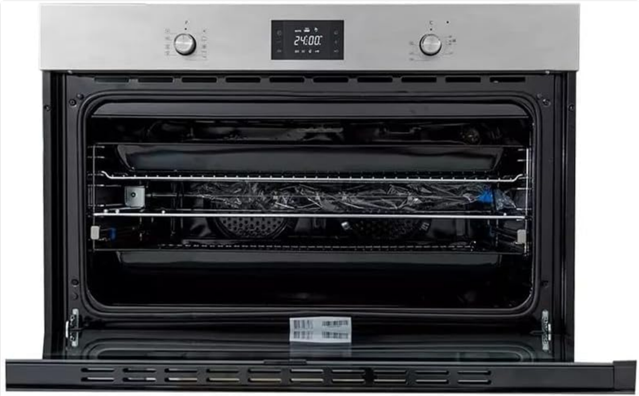
Figure 4.1: Interior view of the oven, highlighting the spacious 104-liter capacity and adjustable chrome racks.

The Simfer oven features a user-friendly control panel with rotary knobs and a digital touch timer.