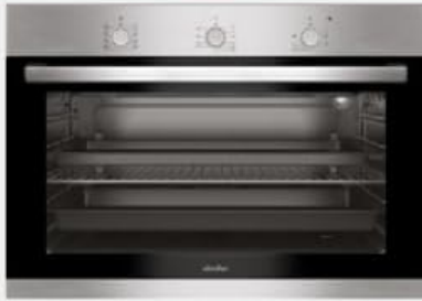
B 9109 MERM