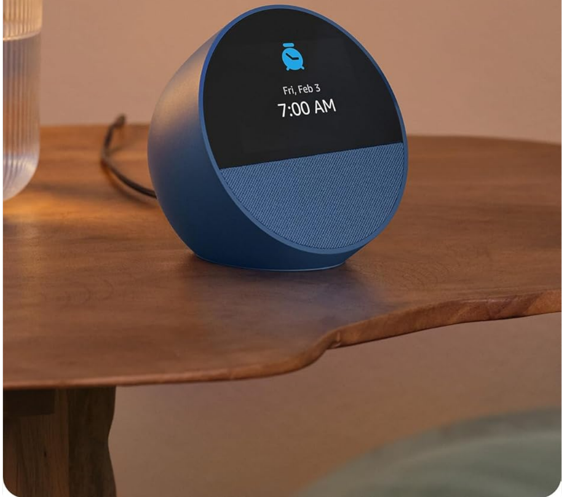
Image: A blue Amazon Echo Spot showing an alarm set for 7:00 AM on its display.

“Alexa, set an alarm for 7 AM tomorrow.”