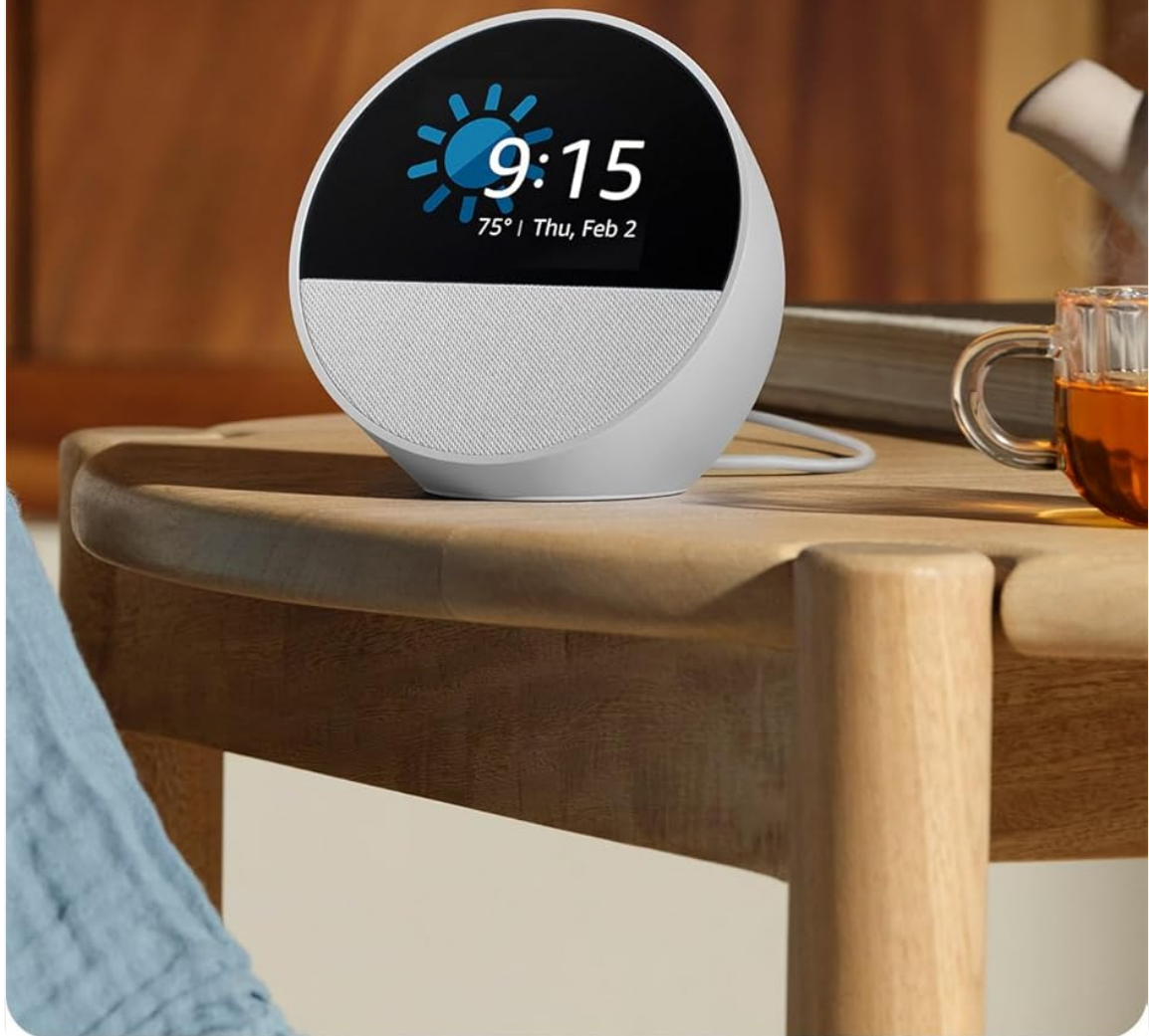
Image: A white Amazon Echo Spot showing the current time and weather forecast on its circular display.