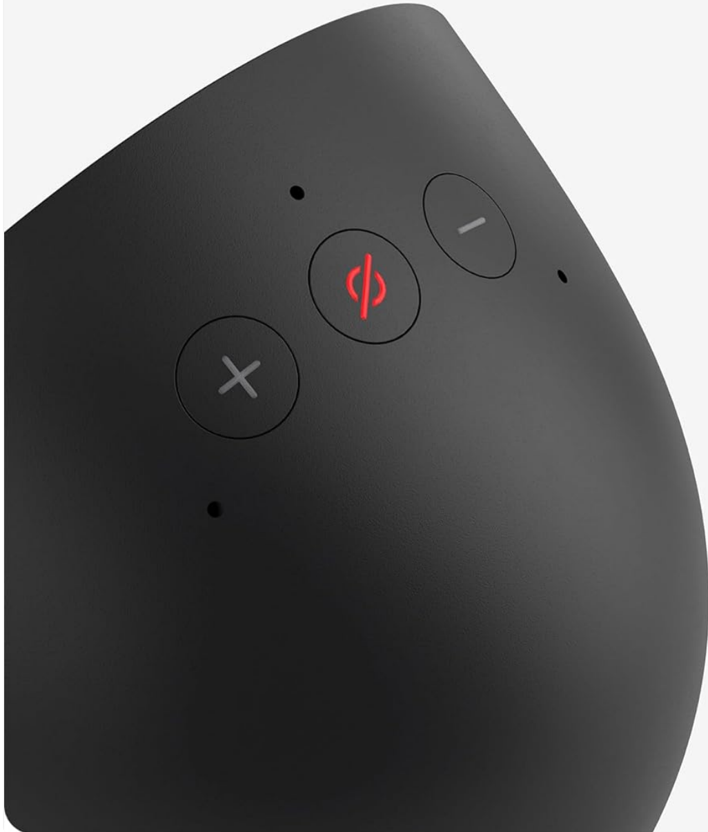
Image: A close-up view of the top of the Echo Spot, highlighting the microphone off button (red circle with a line through it).

Press the mic off button to disconnect the microphone