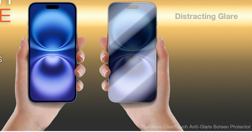
Image: Illustration of the anti-glare effect, showing how the screen protector reduces reflections for better visibility.

The specially designed diffusion surface reduces distracting glare to improve your screen's readability, from bright to low-light conditions