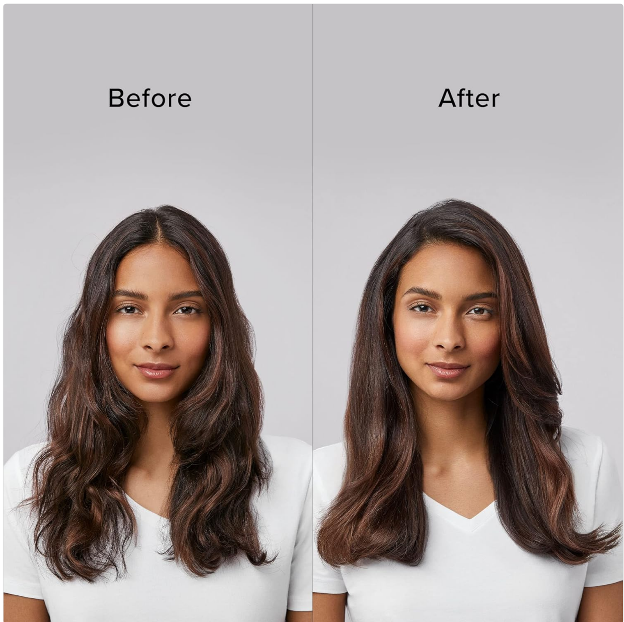
Figure 6: A visual comparison showing hair before and after styling with the Bio Ionic Smart-X Hair Dryer, demonstrating improved smoothness and reduced frizz.