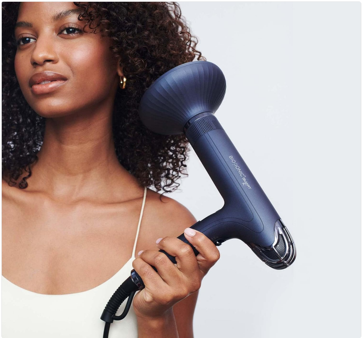
Figure 5: A woman demonstrating the use of the diffuser attachment to enhance natural curls.