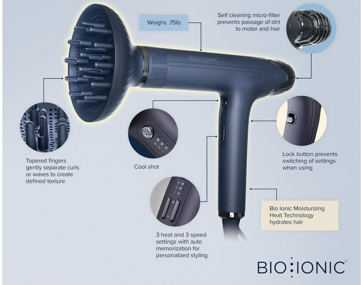
Figure 1: Bio Ionic Smart-X Hair Dryer with key features highlighted. This image shows the dryer unit, the concentrator nozzle attached, and callouts for its lightweight design, self-cleaning micro-filter, lock button, moisturizing heat technology, and 3 heat/3 speed settings.