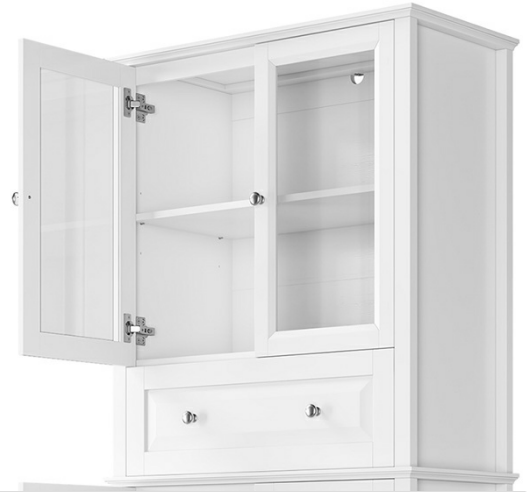
Image 2.1: Illustration of the adjustable shelves, highlighting the four available configuration options for optimized storage.