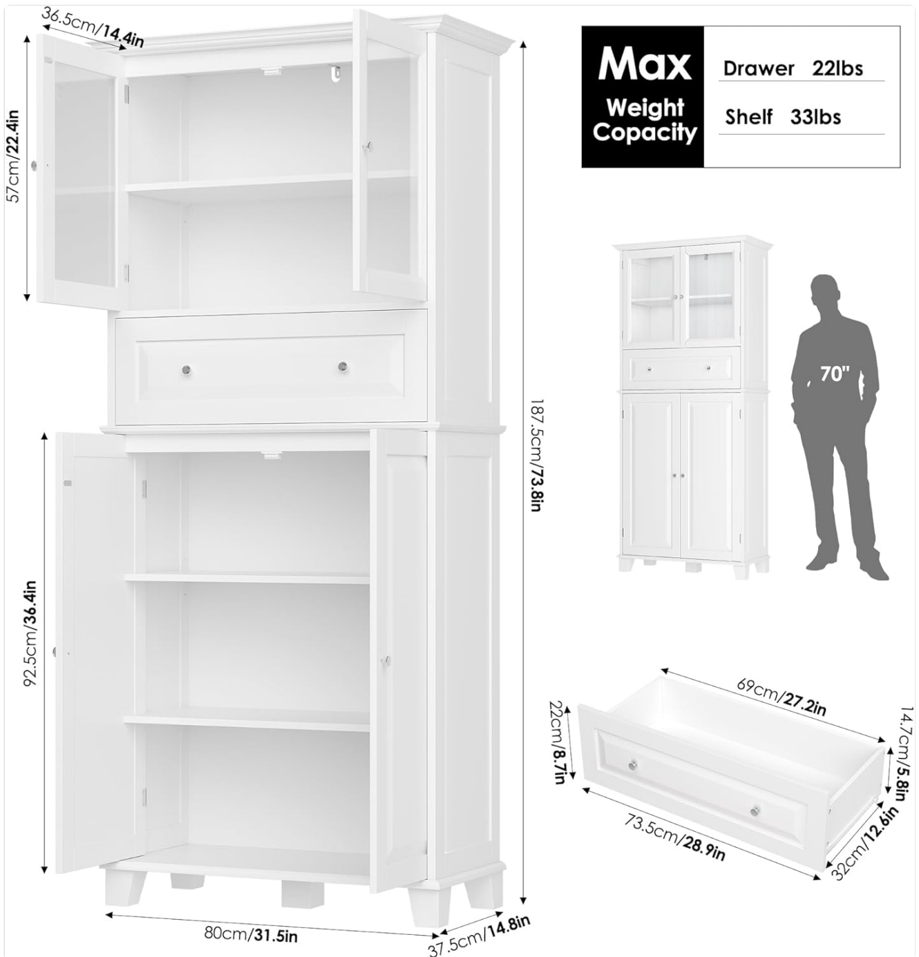
Image 8.1: Detailed diagram illustrating the dimensions and weight capacities for the drawer and shelves.