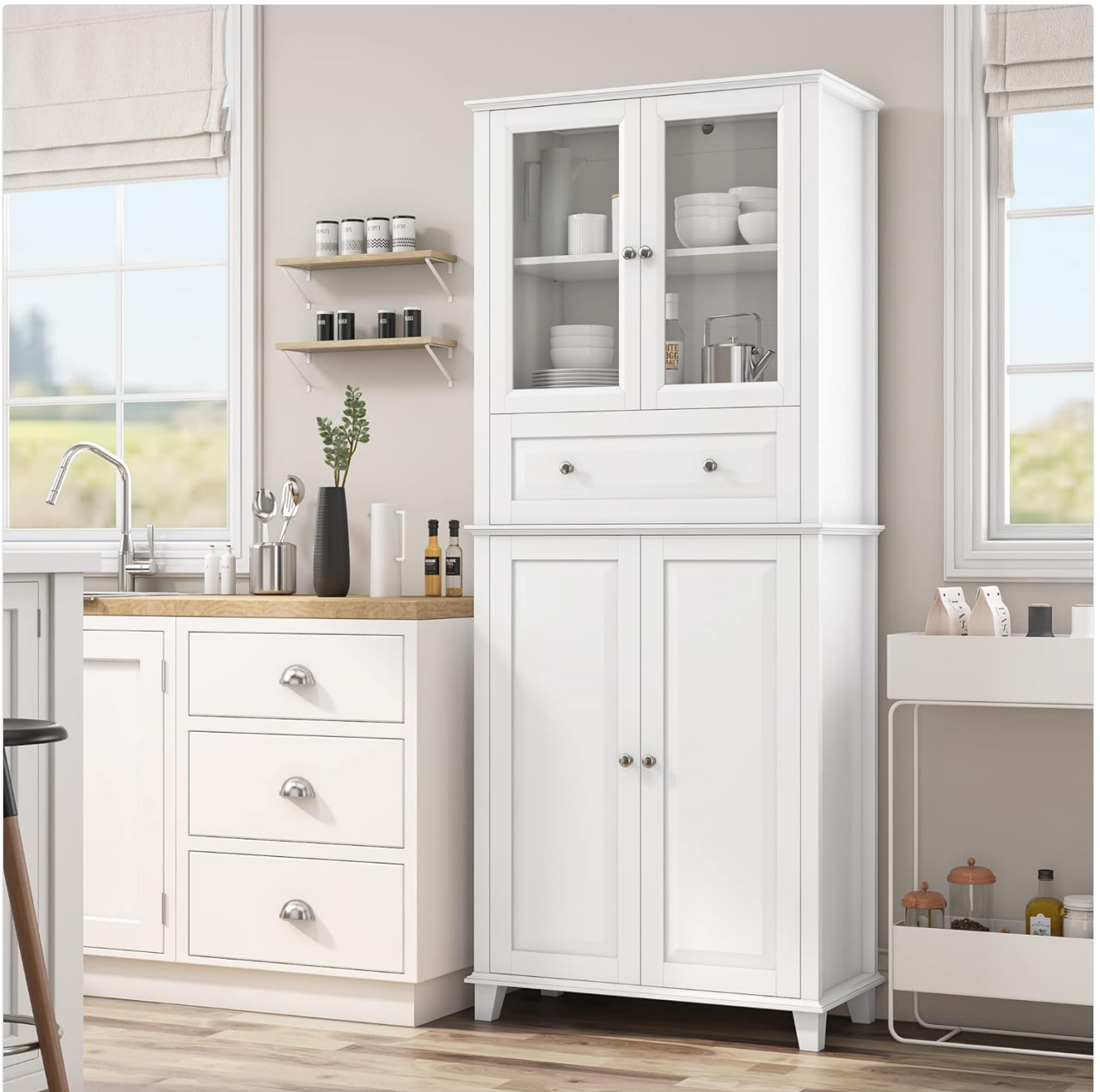
Image 1.1: The 76-inch tall kitchen pantry cabinet, showcasing its design and ample storage capacity in a kitchen environment.