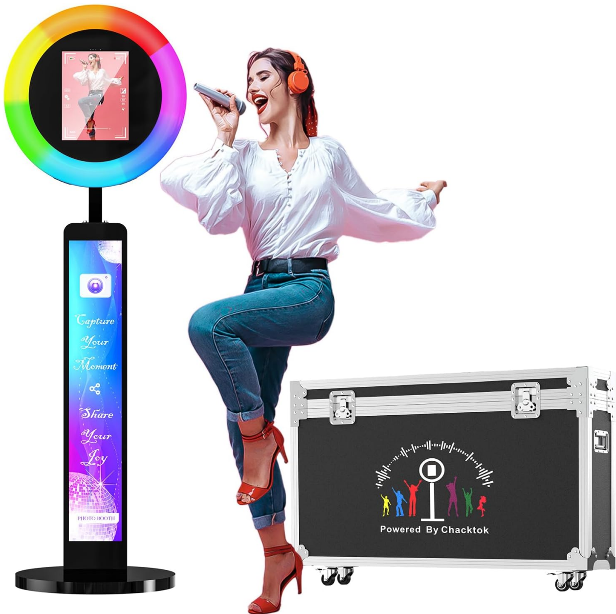
Image 1.1: The OHYEAHSPIN iPad Photo Booth, showcasing its main components including the ring light, iPad stand, and accompanying flight case.