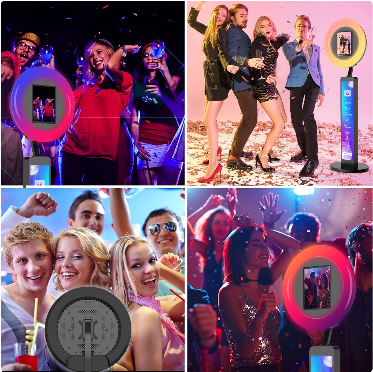
Image 4.1: The photo booth in use at various events, demonstrating its versatility for capturing memorable moments.

Your browser does not support the video tag.