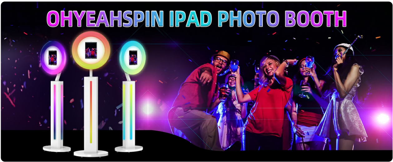
Image 2.2: The RGB ring light offers a spectrum of colors and adjustable brightness, enhancing photo and video quality.