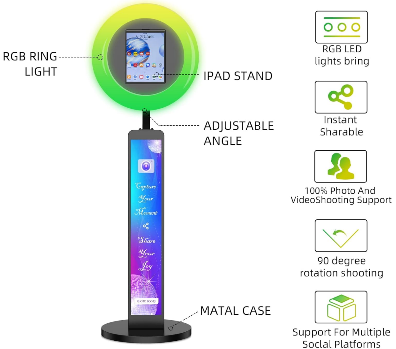
Image 3.1: Overview of the main product components and their functions.