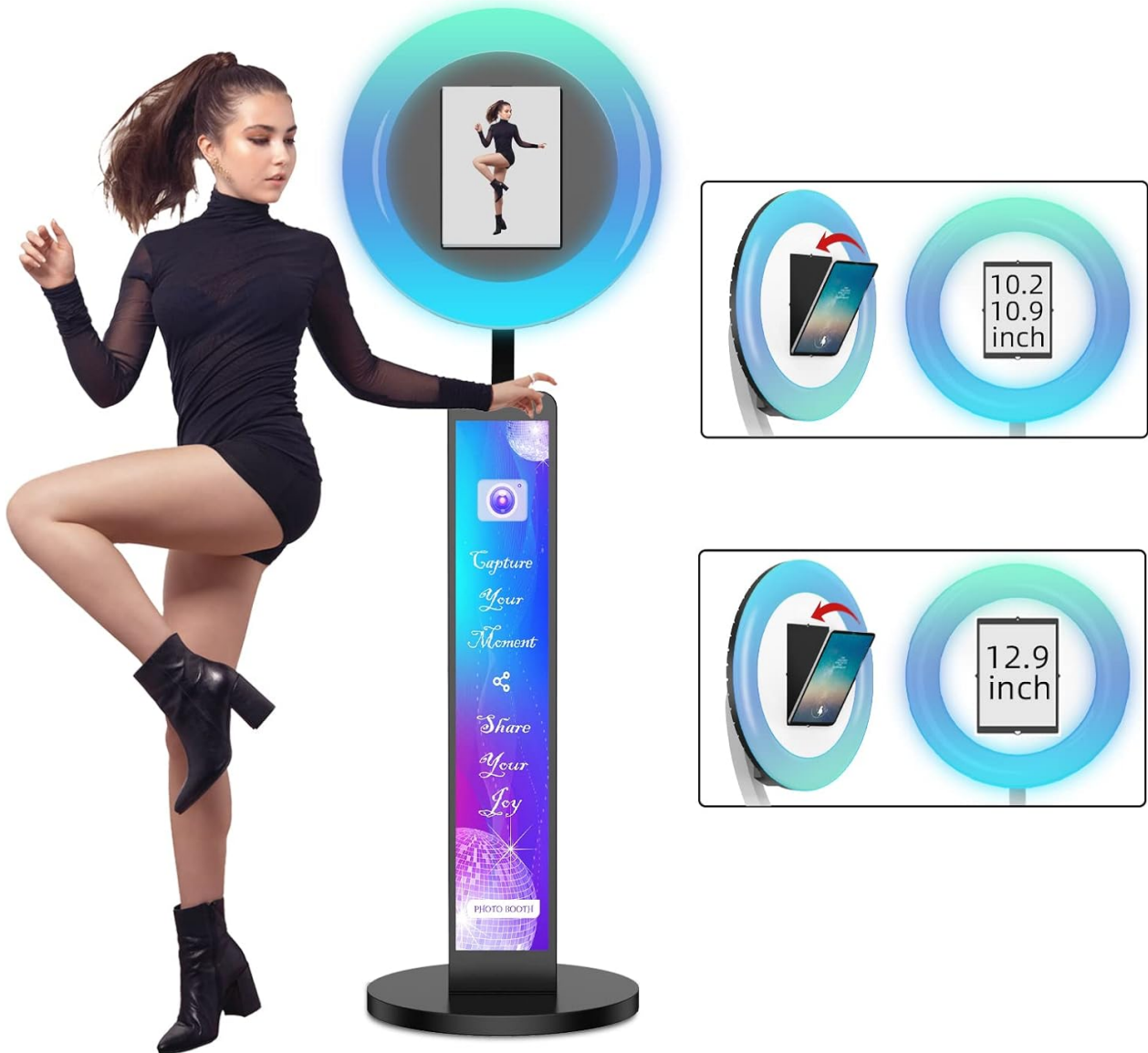
Image 2.1: Illustration of the photo booth's universal compatibility with various iPad sizes, including 10.2, 10.9, 11, and 12.9 inches.