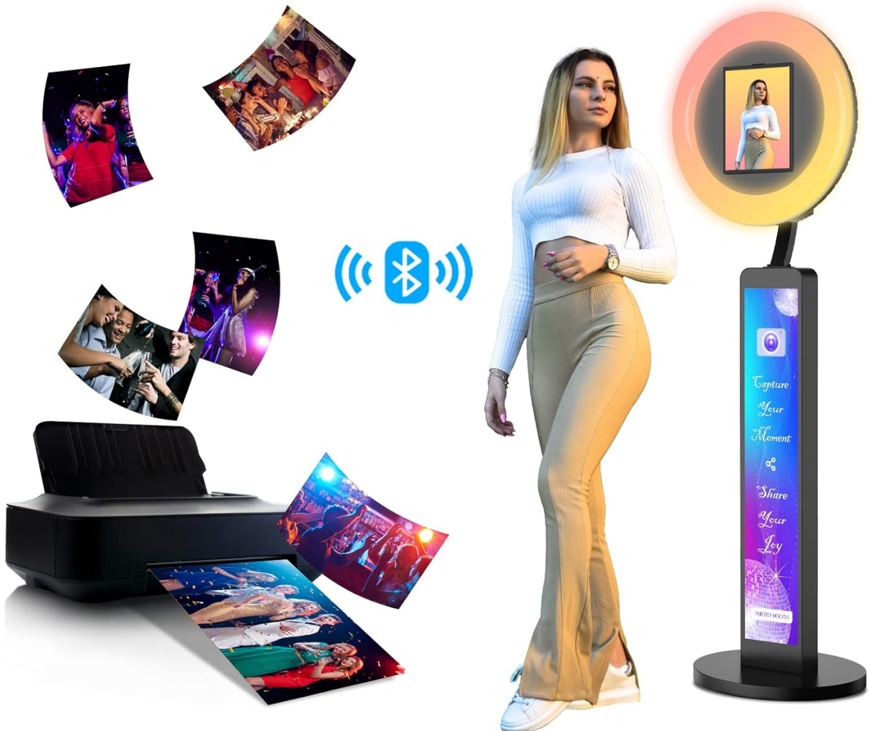
Image 2.6: Connect a compatible printer to instantly print photos captured by the photo booth.

The photos can be printed instantly Freeze the beautiful moments between you and your friends