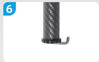
Center Colum with Hook