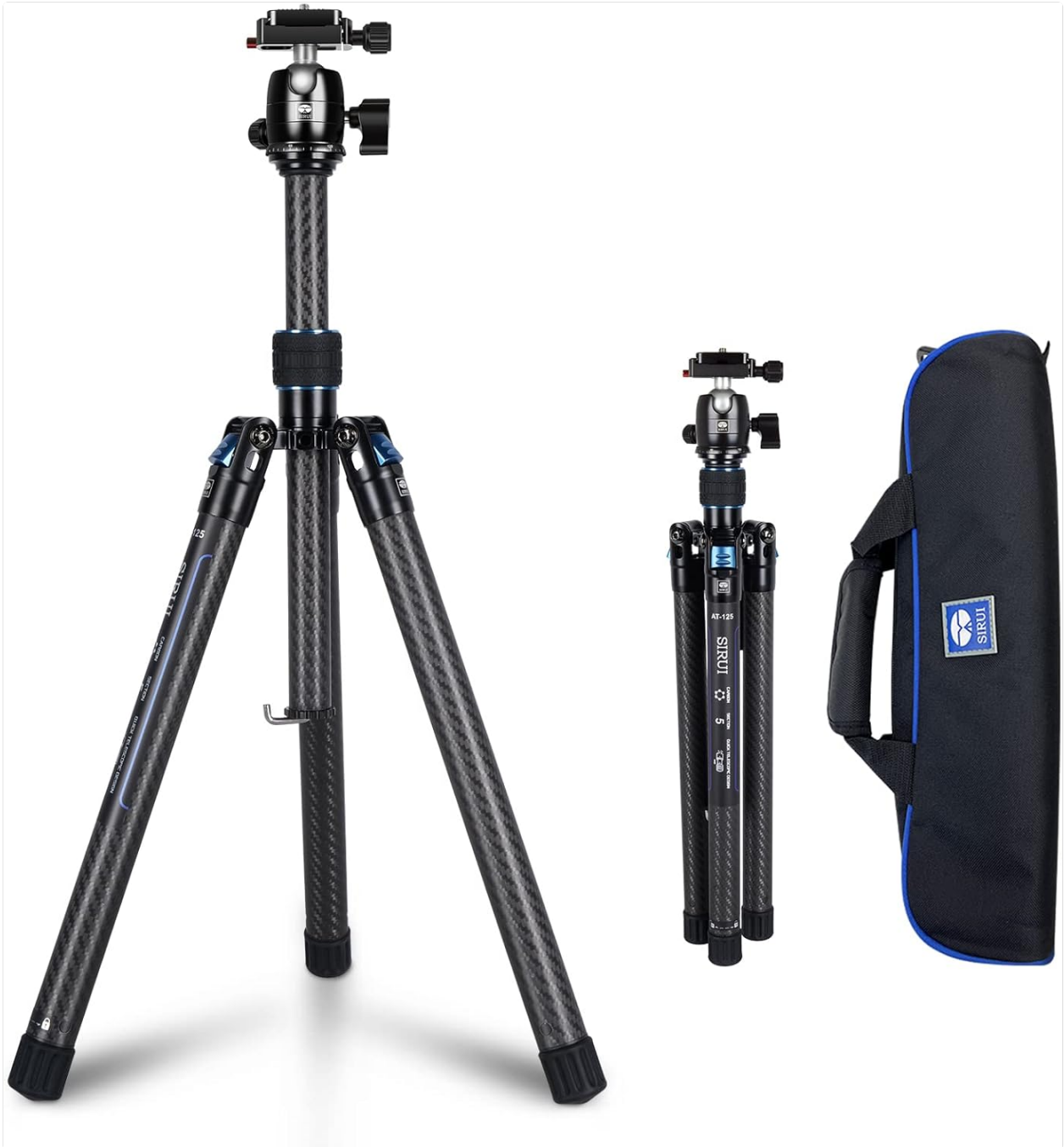
Figure 2.1: The SIRUI Traveler X-I Carbon Fiber Tripod with its included carry bag.