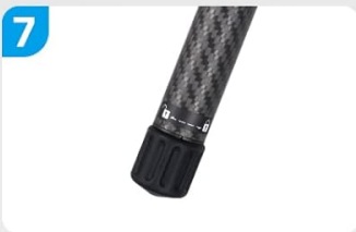
Twist Leg Lock