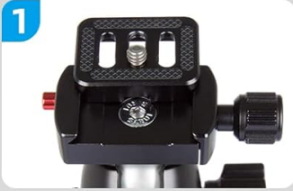
Quick Release Plate Clamp