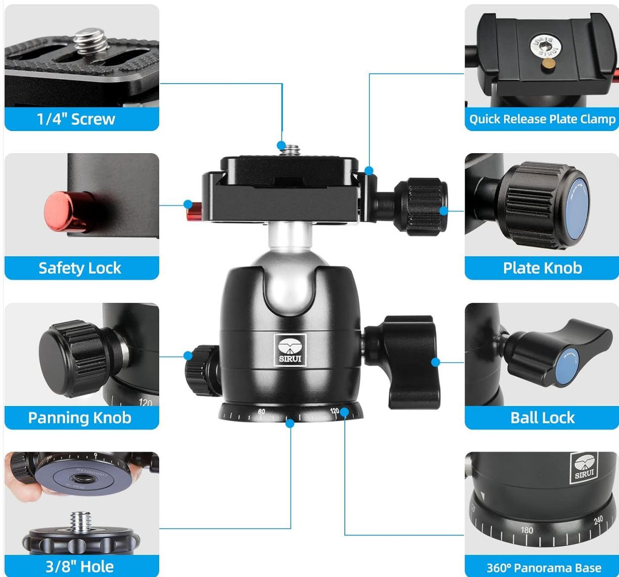
Figure 3.3: Features of the SIRUI B-00K Ball Head, including 1/4" screw, Quick Release Plate Clamp, Safety Lock, Plate Knob, Panning Knob, Ball Lock, 3/8" Hole, and 360° Panorama Base.

Your browser does not support the video tag.