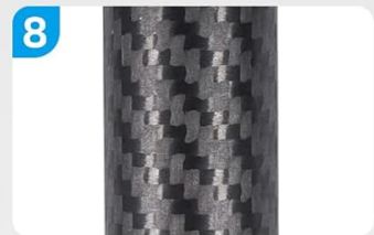
Carbon Fiber Leg