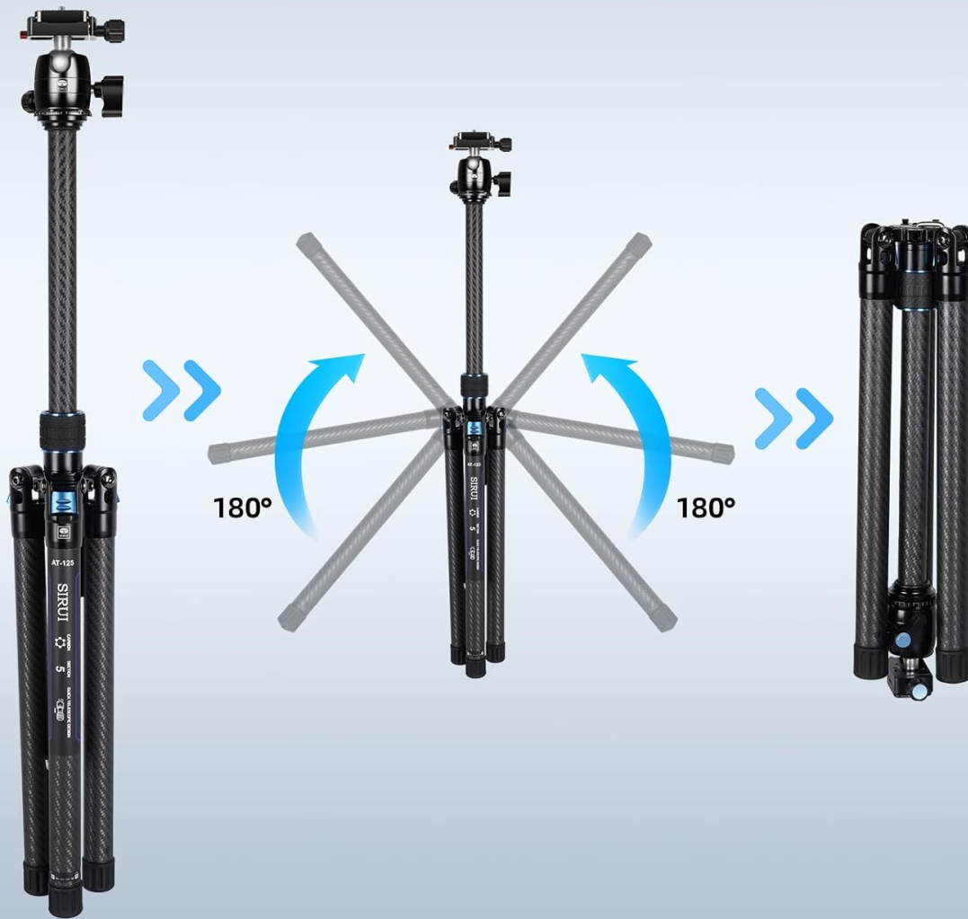
Figure 2.5: The tripod features 180° reverse folding legs for a compact storage size.