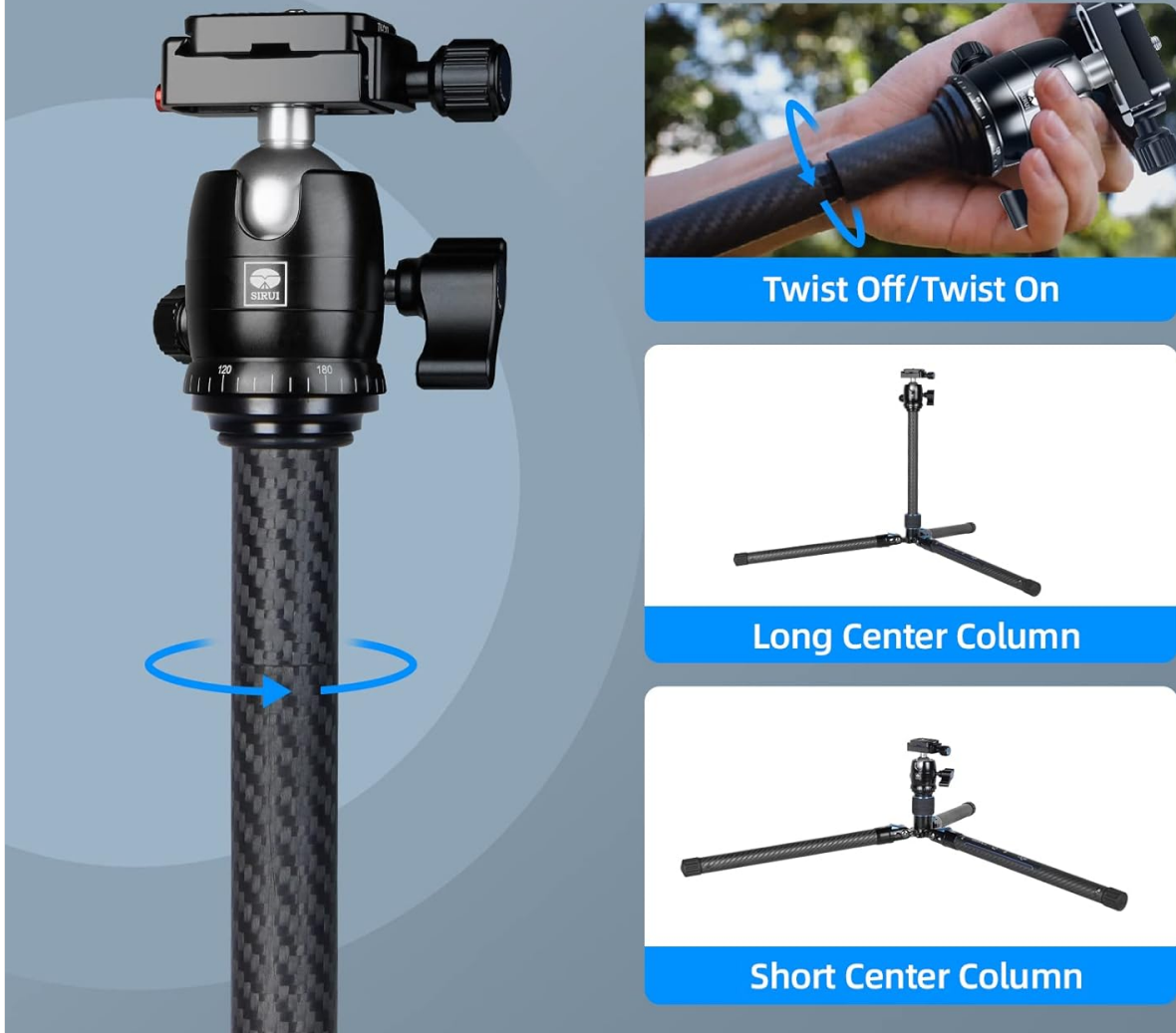
Figure 2.3: The two-section center column can be detached for a shorter setup or reversed for macro shooting. It can be twisted off and on.