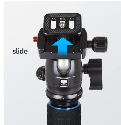
Figure 3.1: The B-00K ball head supports 360° panoramic shooting and 90° tilt. It features a quick release plate and Arca-Swiss compatibility.