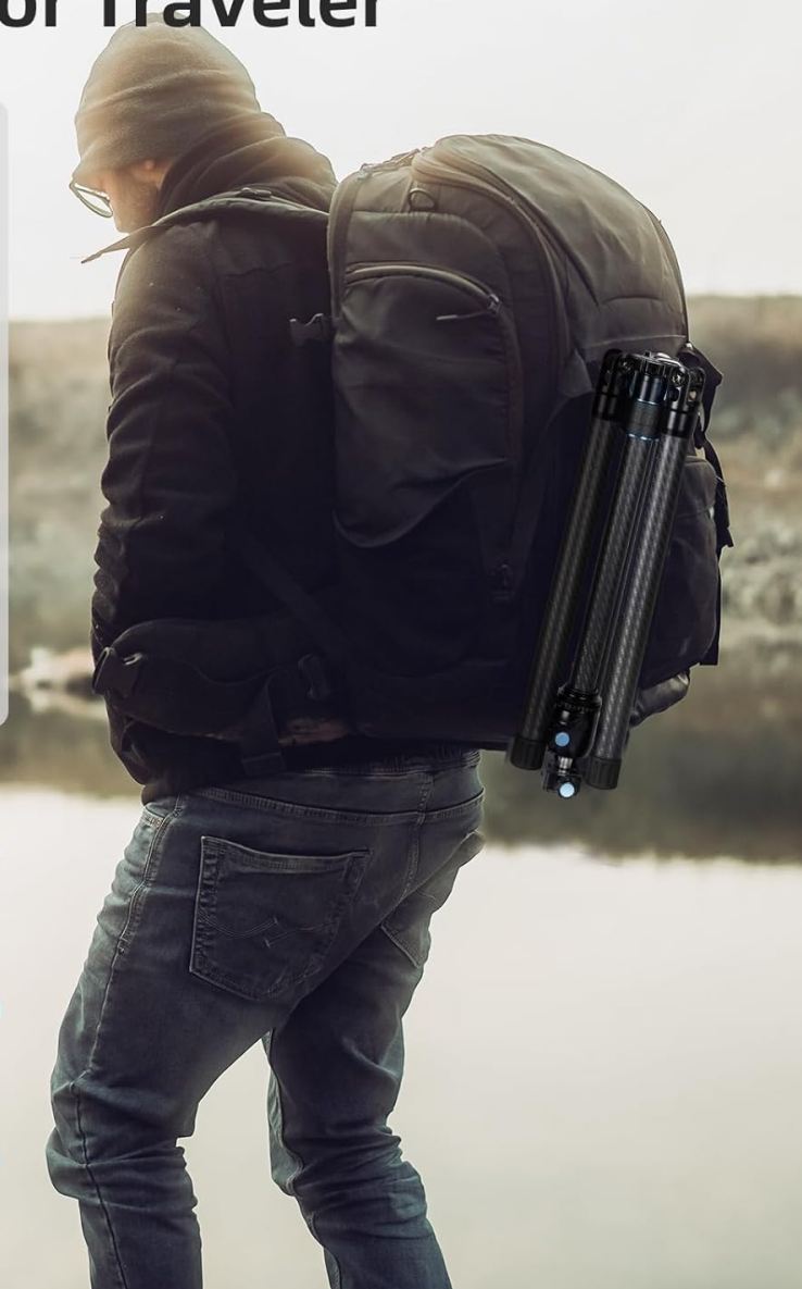
Figure 2.6: The tripod is lightweight at 1.9 lbs (0.865 kg) and folds to 14.3 inches (36 cm), making it portable for travel.

Your browser does not support the video tag.