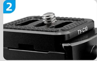
1/4" Standard Screw