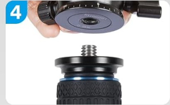
3/8" Hole Adapter Platform