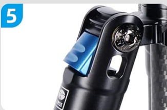
Leg Angle Adjuster