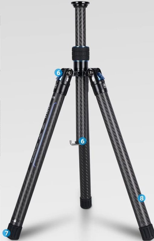
Figure 3.2: Detailed view of tripod components including Quick Release Plate Clamp, 1/4" Standard Screw, 360° Ball Head, 3/8" Hole Adapter Platform, Leg Angle Adjuster, Center Column with Hook, Twist Leg Lock, and Carbon Fiber Leg.