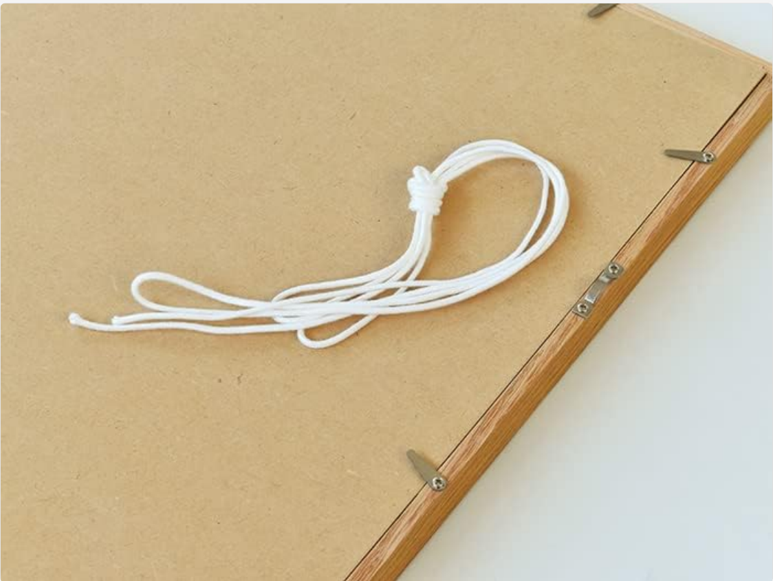
Figure 4: The included hanging string and pre-installed D-rings for easy wall mounting.