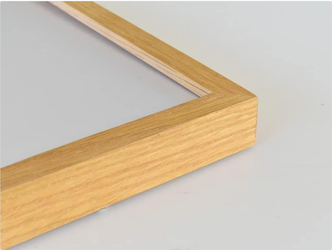
Figure 3: Detailed view of the frame's corner joint, highlighting the solid oak wood construction.