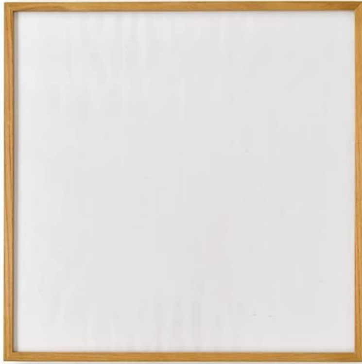
Figure 1: Front view of the cortina Wooden Poster Frame, showcasing its clear front panel and oak wood finish.