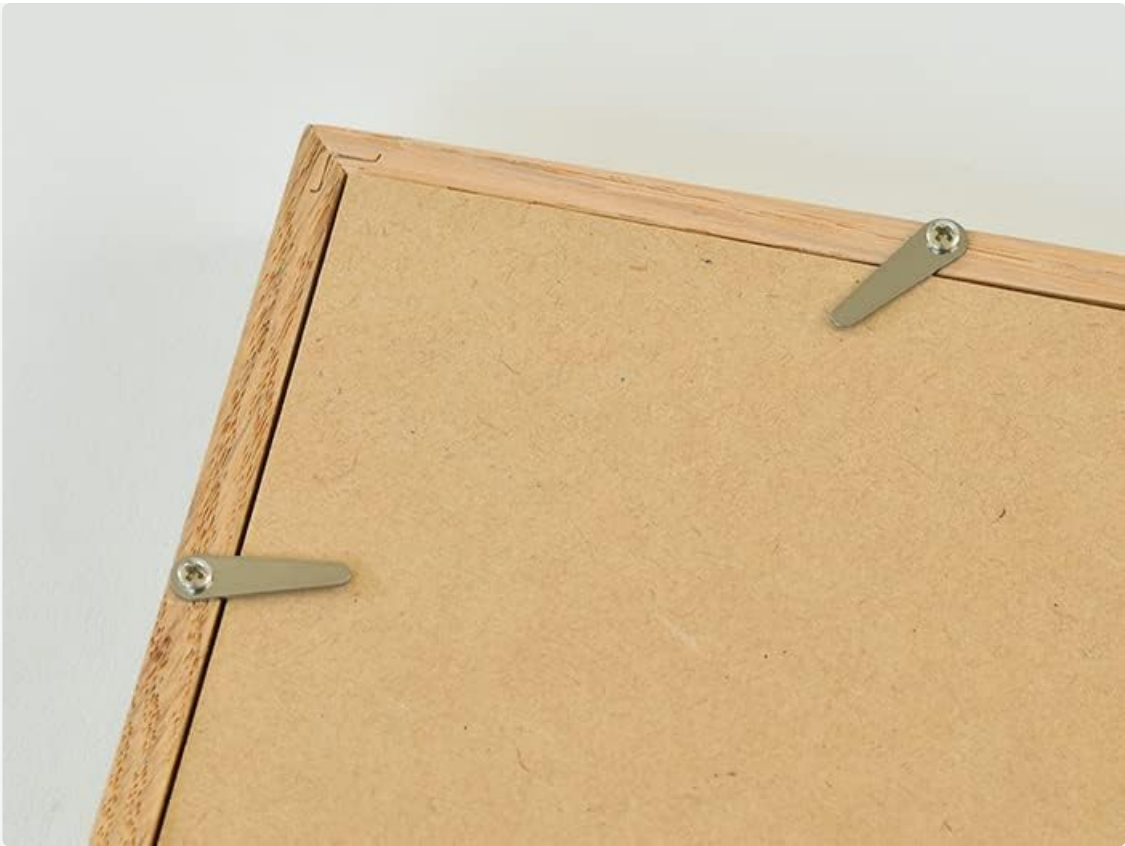
Figure 5: Close-up of the rotatable metal fasteners that secure the backing board.