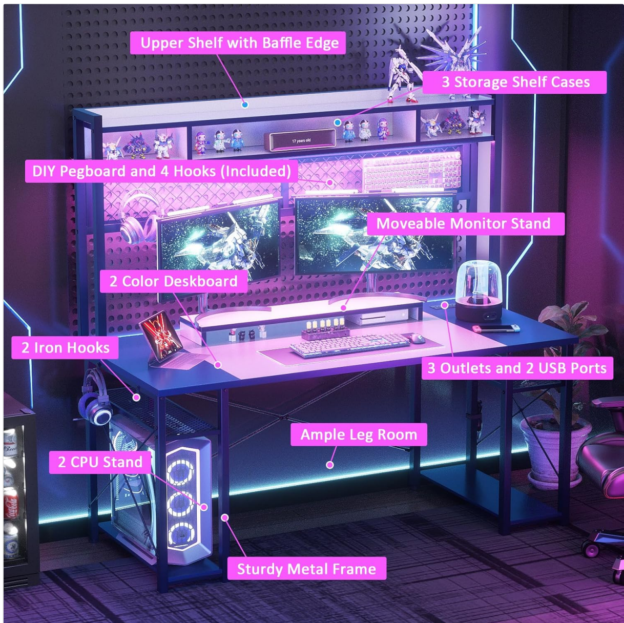
Figure 5: Desk Features Overview. This image provides a comprehensive view of the desk, labeling its various components and functionalities, including the pegboard, hutch, monitor stand, and charging station.