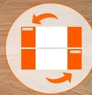
Figure 3: Reversible Charging Station. This image shows two desks configured for a dual workstation setup, emphasizing the reversible nature of the integrated power outlets and USB ports on the desk surface.