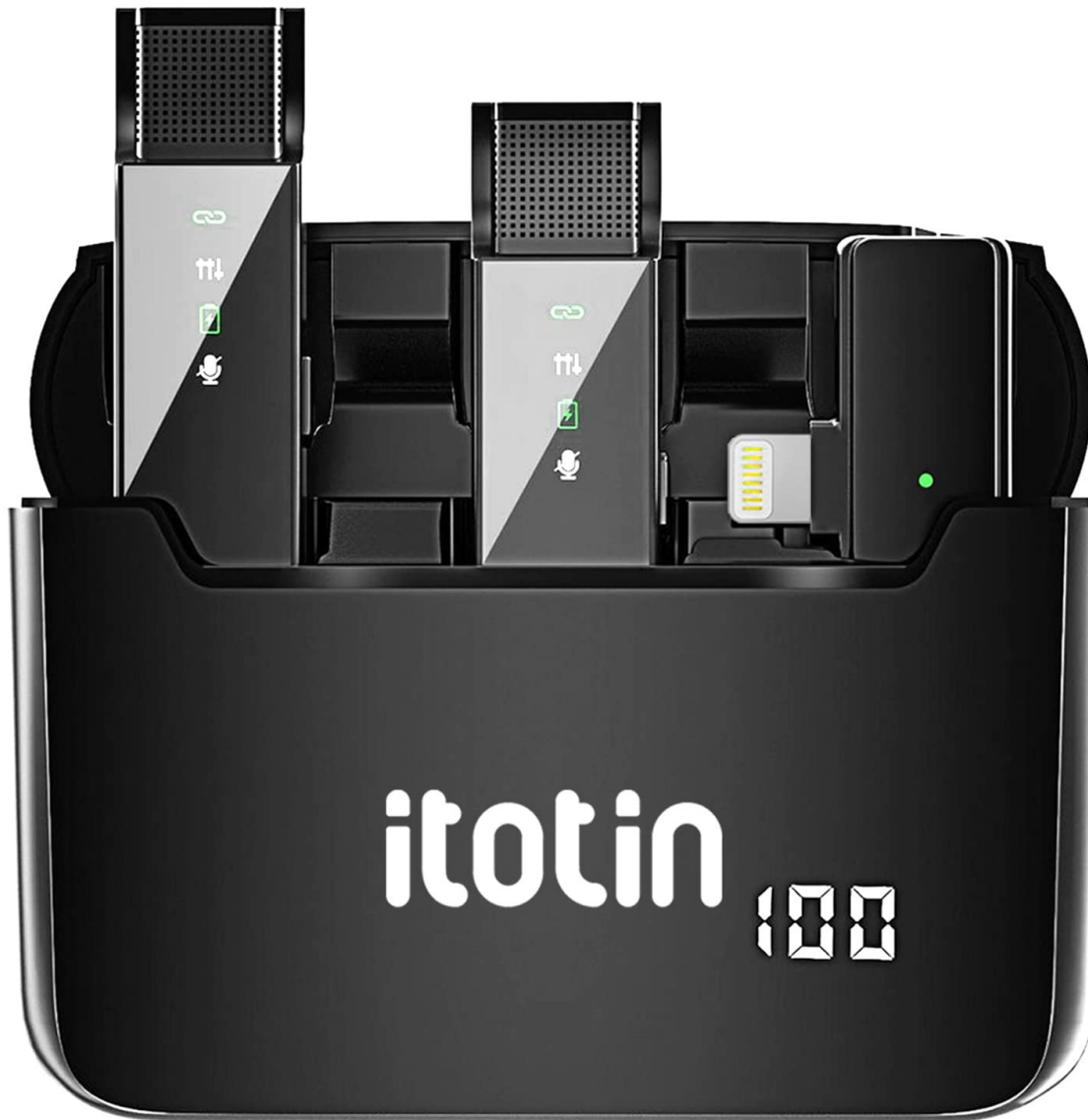
Figure 1: ITOTIN Wireless Lavalier Microphone System (ITT-S16I)