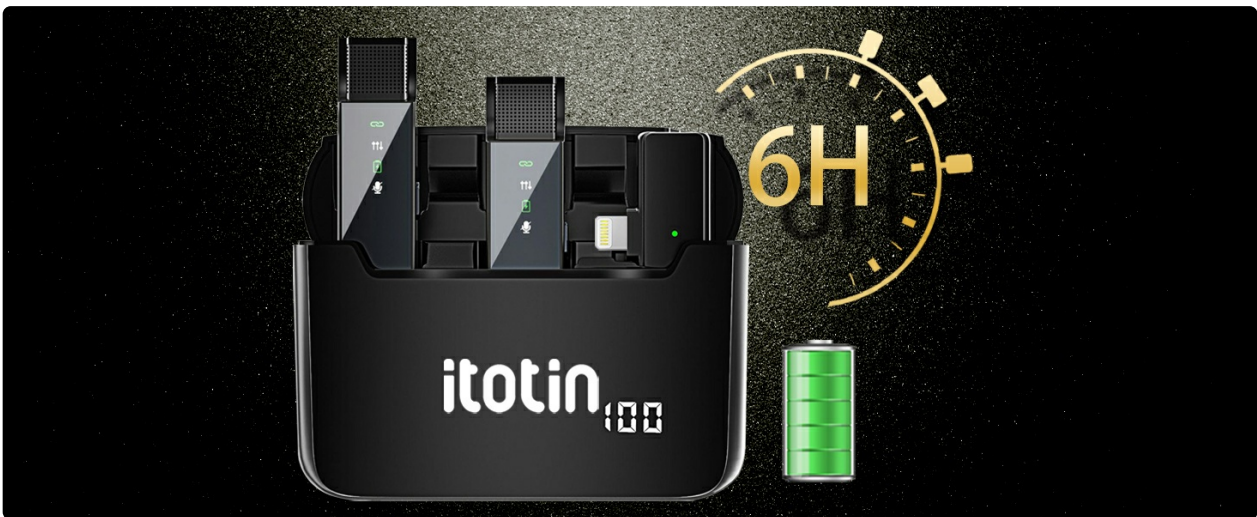
Figure 5: 6 Hours Working Time