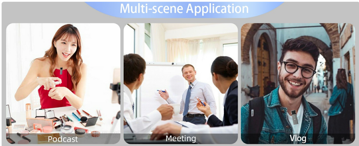
Figure 7: Multi-scene Application Examples

Your browser does not support the video tag.