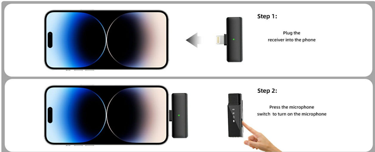
Figure 6: Plug & Play Setup Steps