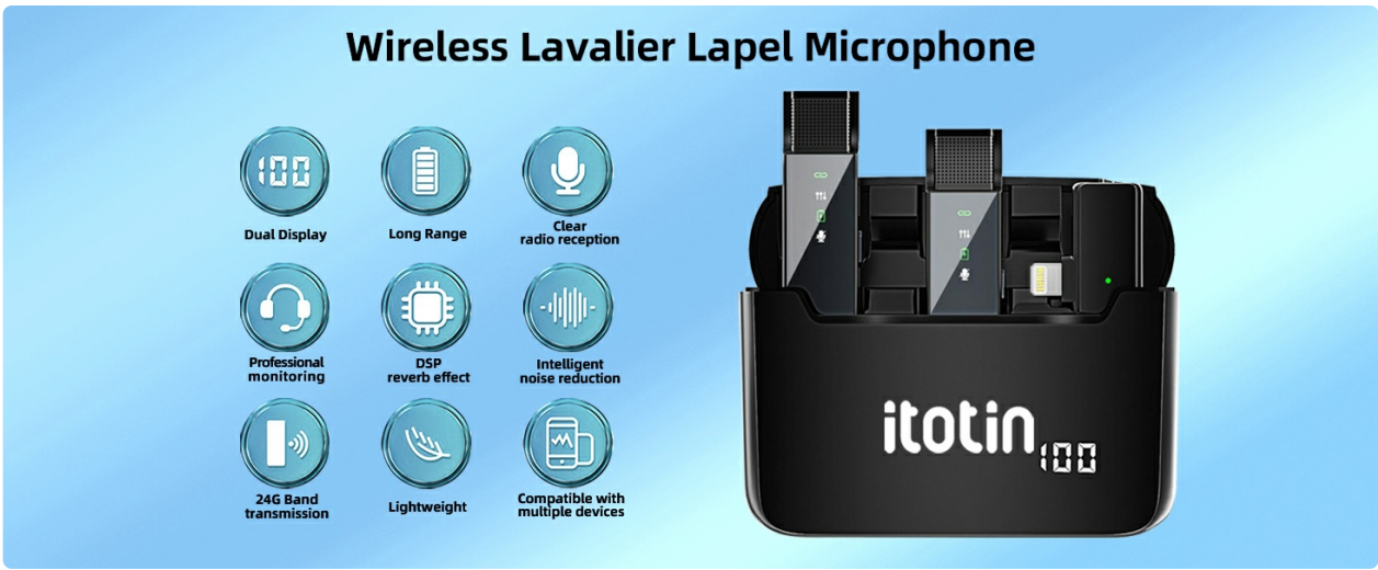
Figure 3: Key Product Features