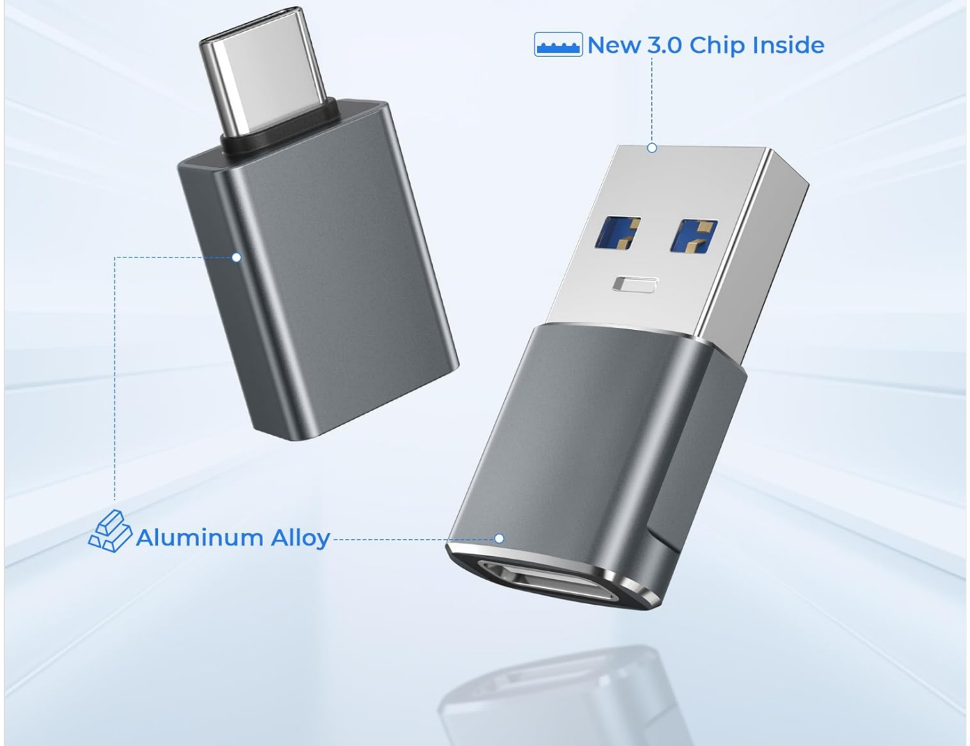
Image 2: The adapters feature an upgraded USB 3.0 alloy design for durability and performance.

Strong, lightweight, and built for fast performance