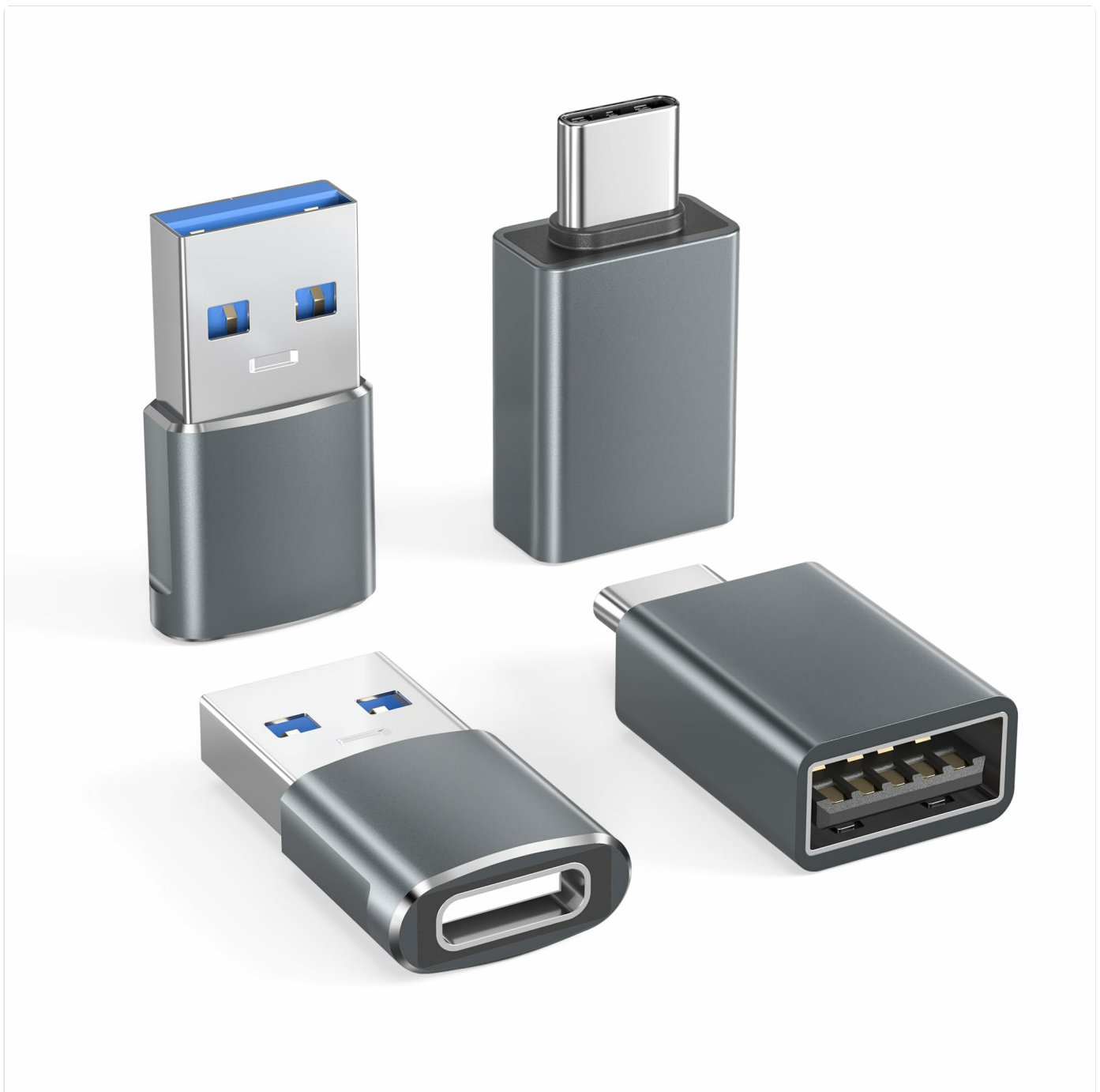
Image 1: The Basesailor USB to USB-C Adapter 4-pack, featuring two types of adapters in gray.