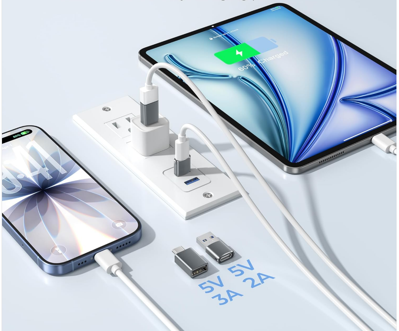
Image 5: The adapters provide reliable and stable charging for everyday devices.