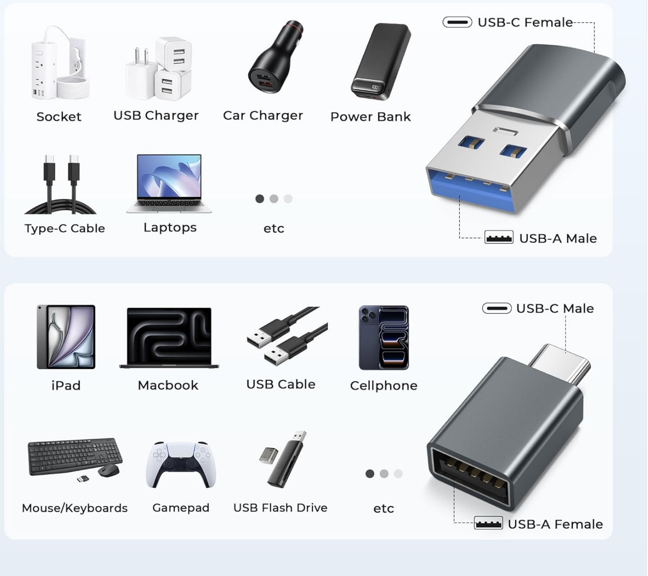
Image 7: The adapters offer wide compatibility across USB-A and USB-C ecosystems.