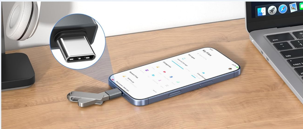
Image 3: The adapters offer dual conversion options for various devices without requiring drivers.

Your browser does not support the video tag.