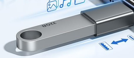
Image 6: The OTG function allows connecting USB-A peripherals to your USB-C device.