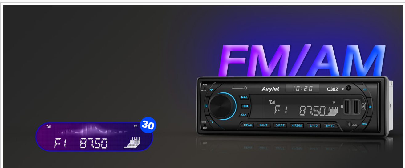
Image: The Avylet C302 car radio displaying an FM frequency (87.50 MHz) with a visual representation of radio waves, indicating its FM/AM support and ability to store up to 30 stations.