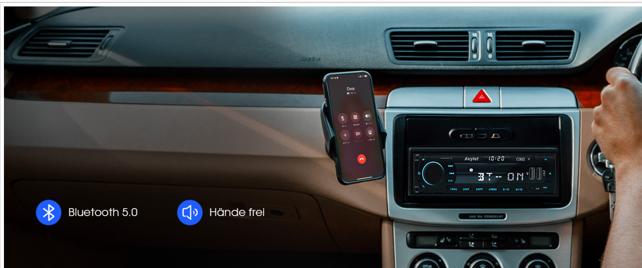
Image: A smartphone displaying an active call interface, positioned near the Avylet C302 car radio, illustrating the Bluetooth 5.0 hands-free calling feature.