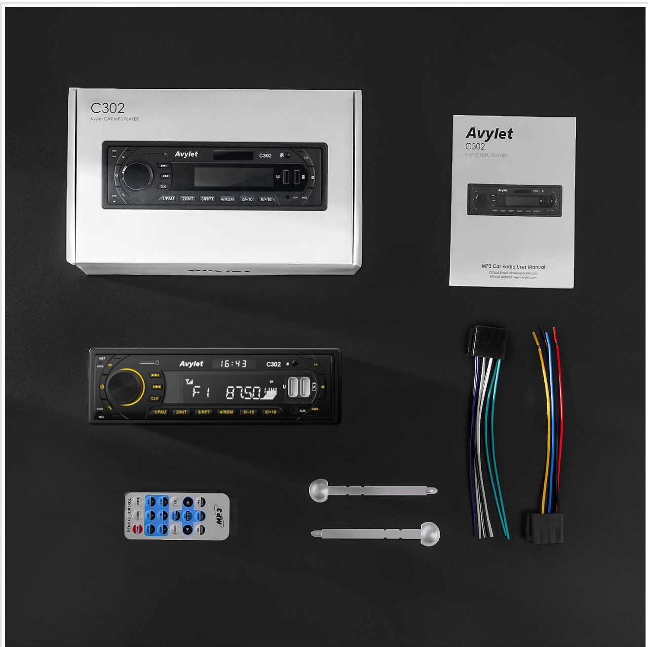
Image: All components included in the Avylet C302 car radio package, laid out on a dark surface.