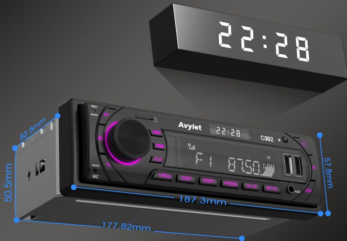
Image: The Avylet C302 car radio unit shown with an enlarged digital clock display, highlighting its independent time-telling feature and providing product dimensions.

Easy to check the time and minimize distractions