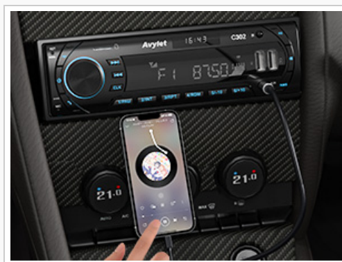
Image: A smartphone connected to the Avylet C302 car radio via USB, displaying a music playback interface.