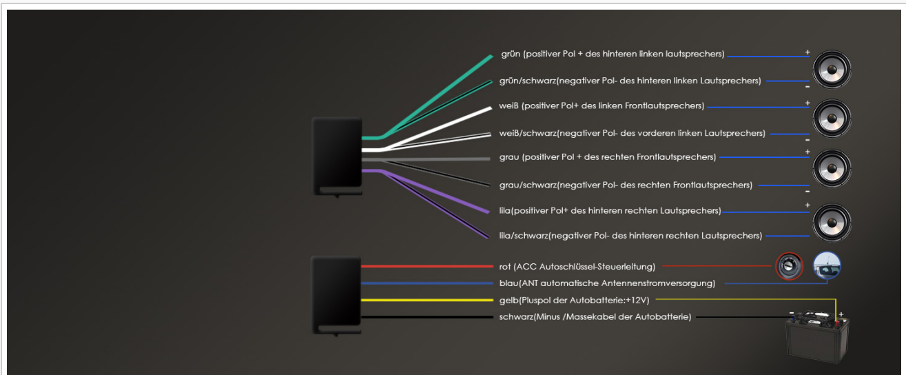
Image: A detailed wiring diagram showing connections for power (red, blue, yellow, black) and speaker outputs (green, white, gray, purple wires with positive and negative terminals).

Connect the provided wiring harness to your vehicle's electrical system. Ensure correct polarity and secure connections. The yellow wire (constant 12V) must be connected correctly for the memory function to work.