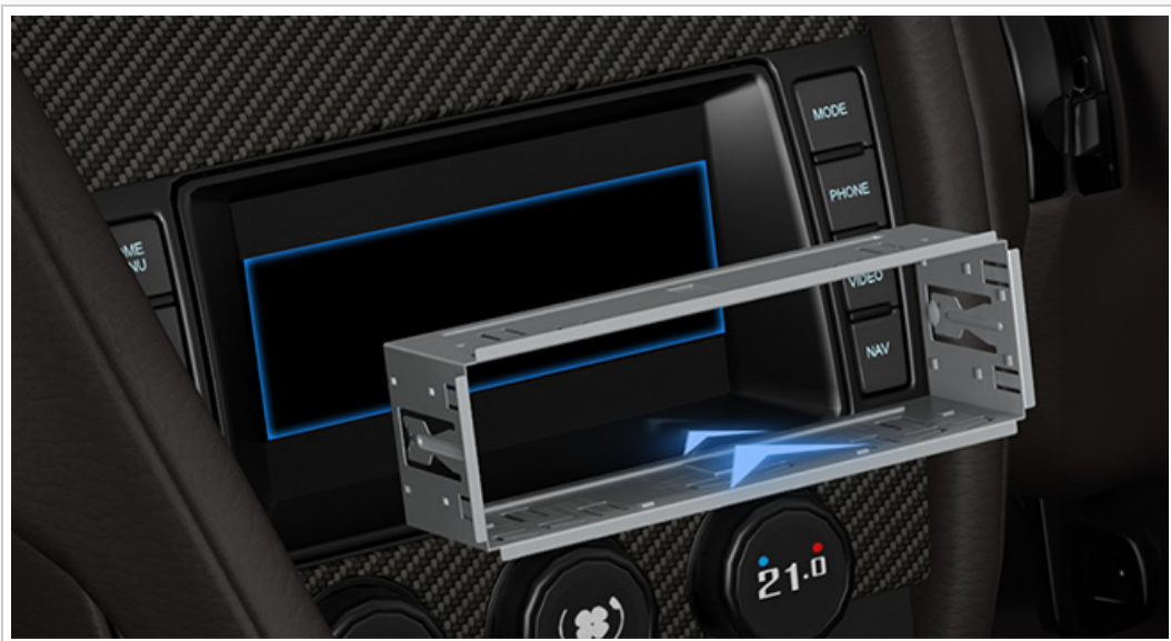
Image: A metal mounting sleeve being inserted into a car's dashboard opening.