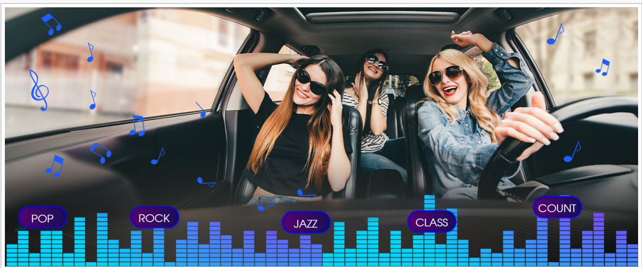
Image: A car interior with three people enjoying music, overlaid with graphic representations of different equalizer settings like Pop, Rock, Jazz, and Class, indicating the sound customization options of the Avylet C302 car radio.

Press the EQ button (or a similar button on the remote) to cycle through preset equalizer modes (e.g., Pop, Rock, Jazz, Classic) or to access bass/treble adjustments.