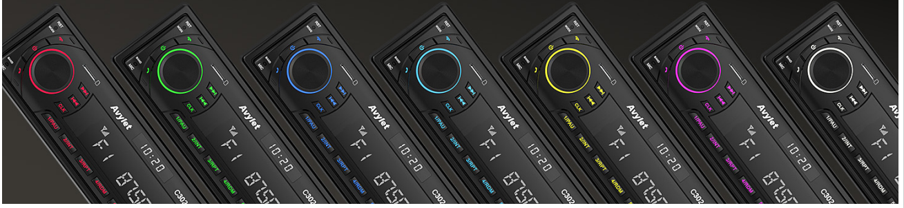
Image: A series of Avylet C302 car radio units, each displaying a different button backlight color (red, green, blue, yellow, cyan, purple, white), illustrating the 7-color illumination feature.

Ermöglicht es Ihnen, die Darstellung der Tastenbeleuchtung nach Ihren Wünschen anzupassen