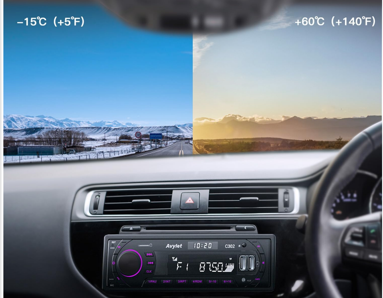
Image: Two split images showing a car interior with the Avylet C302 car radio, one in a cold, snowy environment ( -15^{\circ}\text{C} ) and another in a hot, sunny environment ( +60^{\circ}\text{C} ), demonstrating its temperature resilience.

Suitable for operating environments from -15^{\circ}\text{C} ( +5^{\circ}\text{F} ) to +60^{\circ}\text{C} ( +140^{\circ}\text{F} )