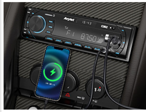
Image: A smartphone connected to the Avylet C302 car radio via USB, displaying a charging indicator.