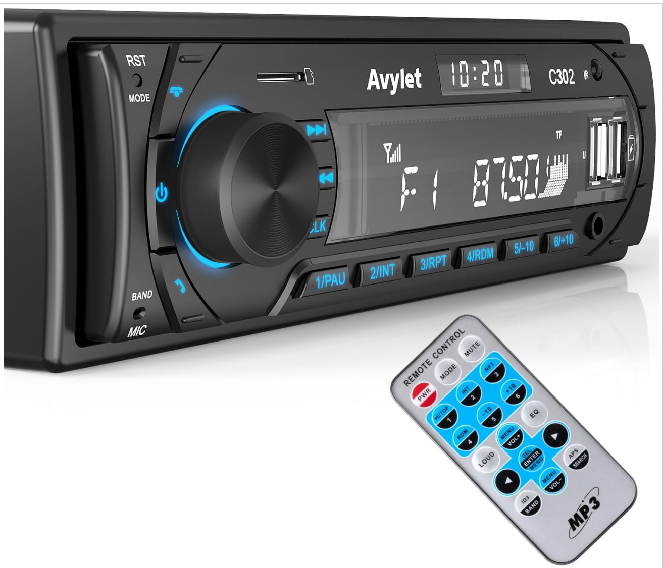
Image: The Avylet C302 car radio unit with its included remote control.