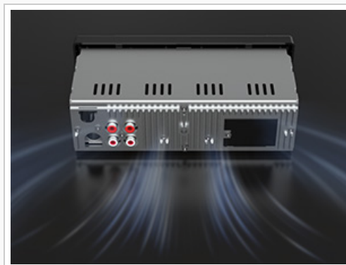
Image: A rear view of the Avylet C302 car radio, showing airflow patterns to illustrate its heat dissipation design.