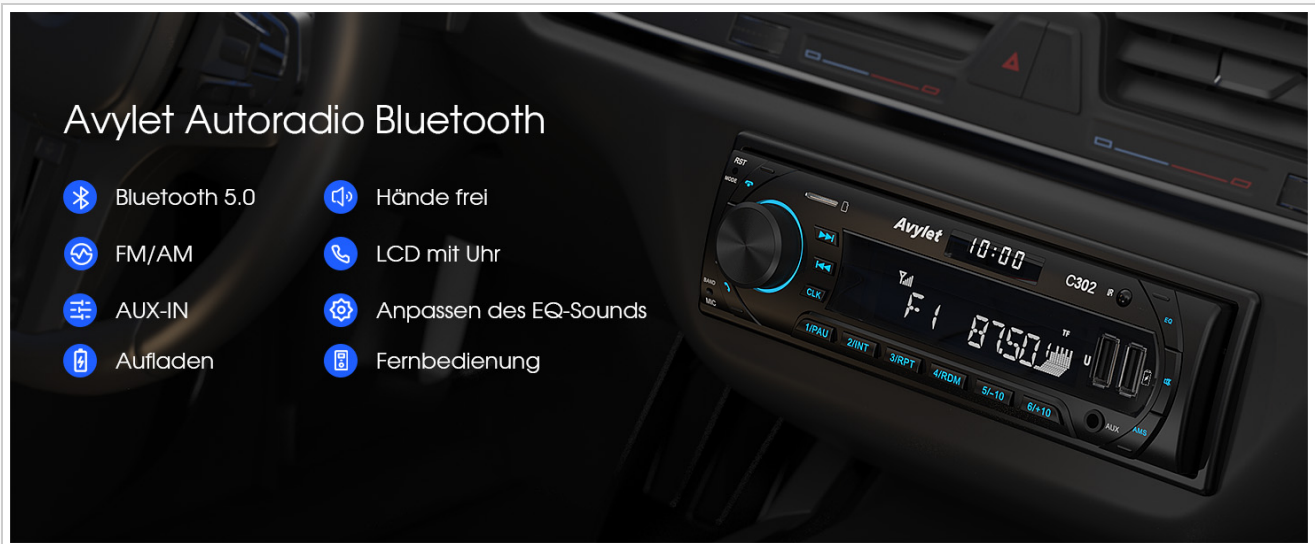
Image: A graphic illustrating the main features of the Avylet C302 car radio, including Bluetooth 5.0, hands-free, FM/AM, AUX-IN, charging, LCD clock, EQ sound adjustment, and remote control.