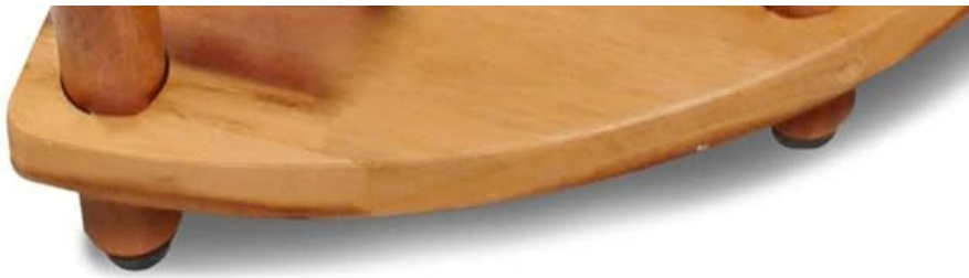
Image: Using the shower stool as a footrest for shaving.