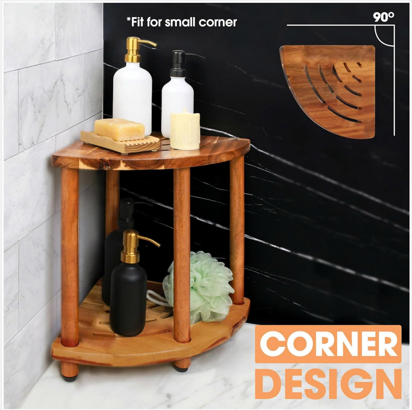
Image: Corner design of the shower stool in a bathroom setting.