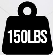
Image: Product dimensions and weight capacity.