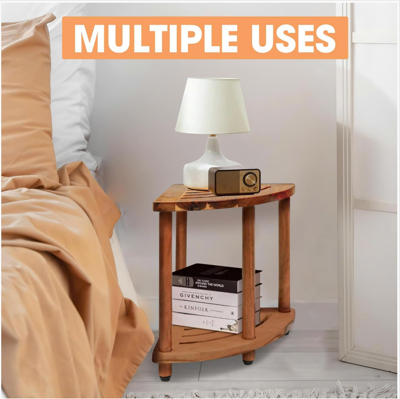
Image: Shower stool demonstrating multiple uses as a nightstand.

Your browser does not support the video tag.