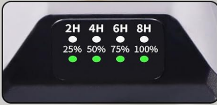
Timer Setting & Power Indicator Display