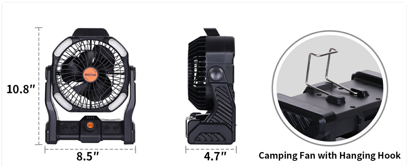
Image: A diagram illustrating the dimensions of the WESTTREE X26A fan (10.8"H x 8.5"W x 4.7"D) and a close-up view of its integrated hanging hook, emphasizing its portability and versatile placement options.