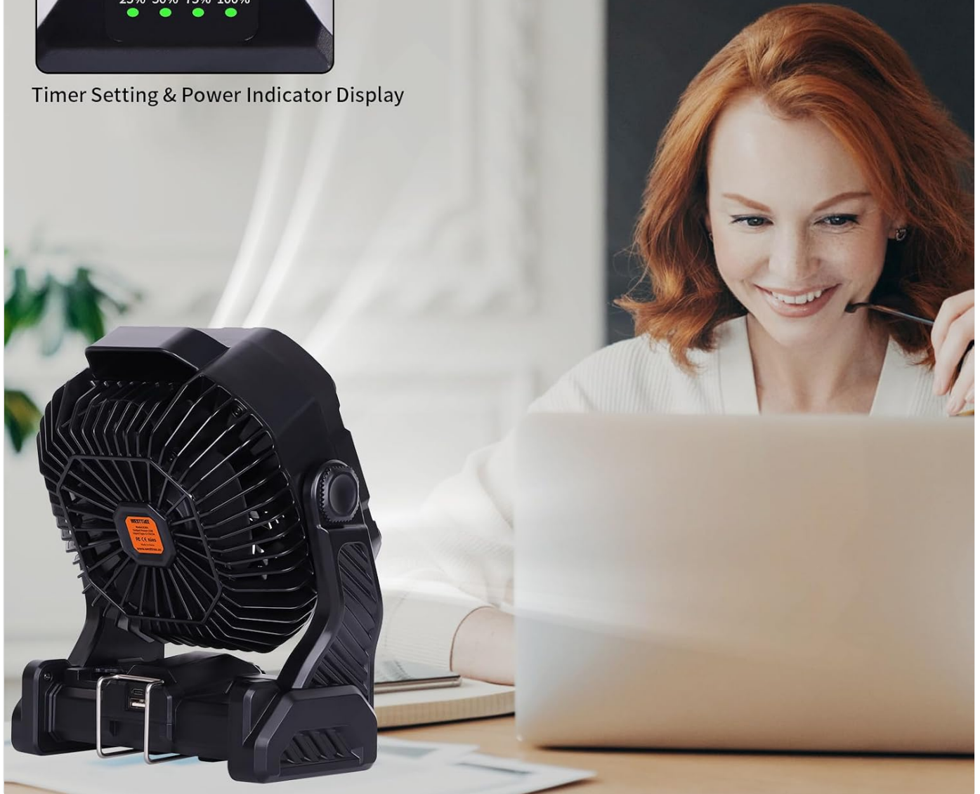
Image: The WESTTREE X26A fan on a desk, displaying its power indicator with charging percentages and timer settings. A smartphone is shown connected to the fan, illustrating its capability to charge external devices.