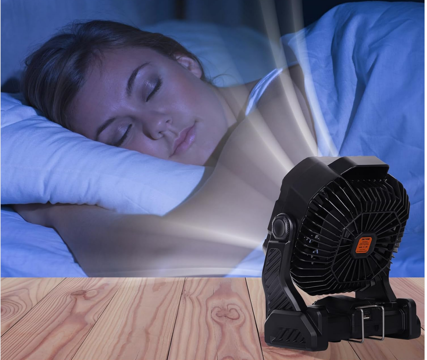
Image: The WESTTREE X26A fan positioned on a bedside table, providing quiet airflow to a person sleeping. This illustrates the fan's low noise level, making it suitable for use in quiet environments like bedrooms or tents.

Quiet ( \leq 20\text{dB} ) fans for bedroom, enjoy coolness