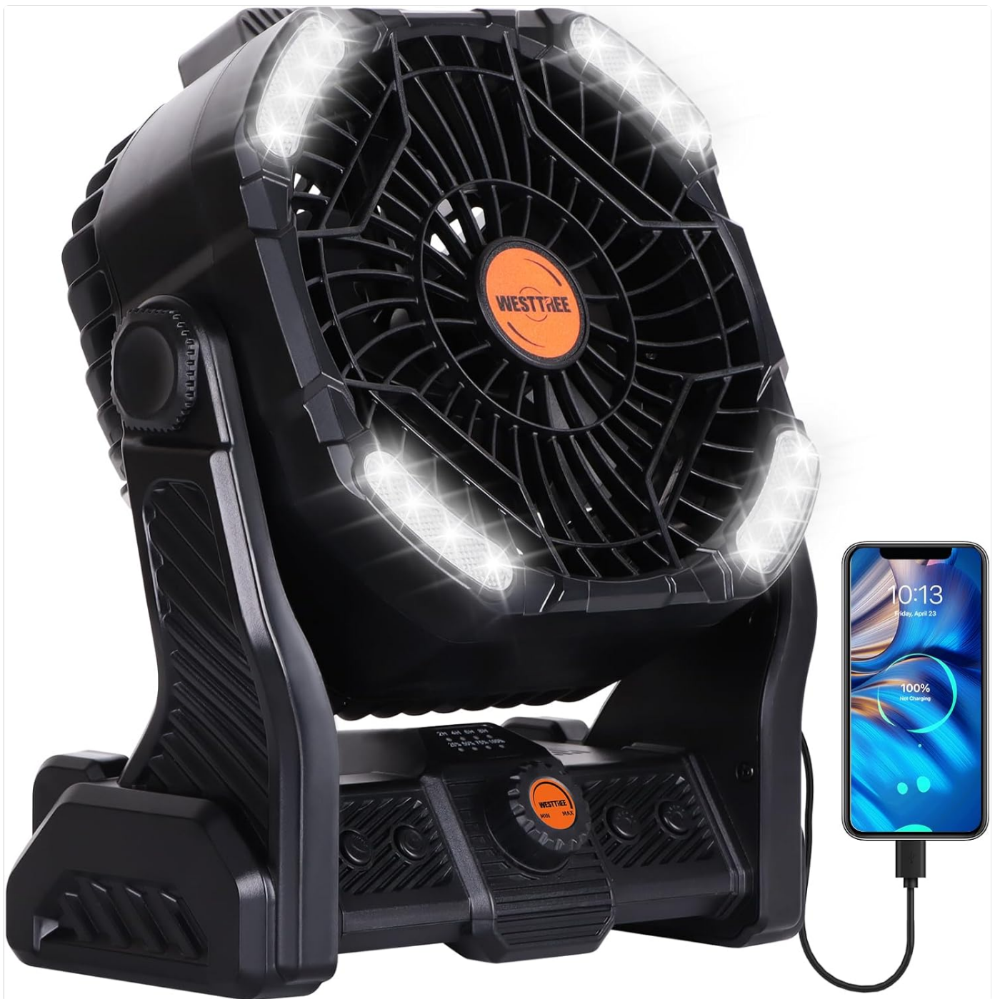
Image: The WESTTREE X26A fan with its LED lights on, demonstrating its ability to charge a smartphone via its USB output port. This image highlights the fan's multi-functional design, serving as both a cooling device and a portable power source.