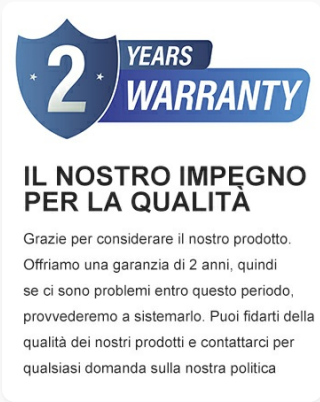
Image 9.1: 2 Years Warranty. This image displays a badge indicating a 2-year warranty, highlighting Jesebang's commitment to quality.

Jesebang offers a 2-year warranty for the BD86 Wireless Earbuds. This warranty covers manufacturing defects and ensures that any issues arising within this period will be addressed. Please retain your proof of purchase for warranty claims.