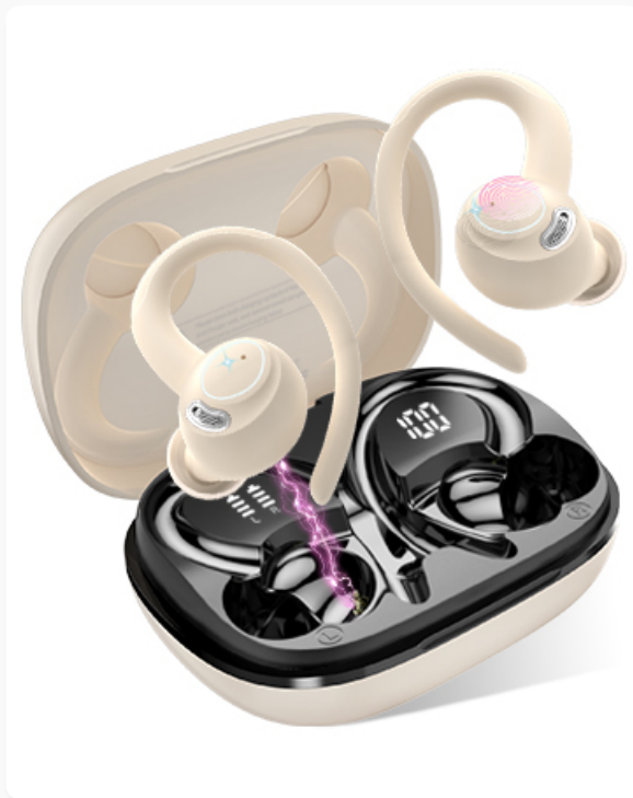
Image 3.1: Component Diagram. This image illustrates the key parts of the earbuds and charging case, including Mic 1, LED Indicator, Mic 2, Charging Pin on the earbuds, and the Dual LED Display and Type-C Input on the charging case.

Familiarize yourself with the components of your Jesebang BD86 earbuds and charging case.