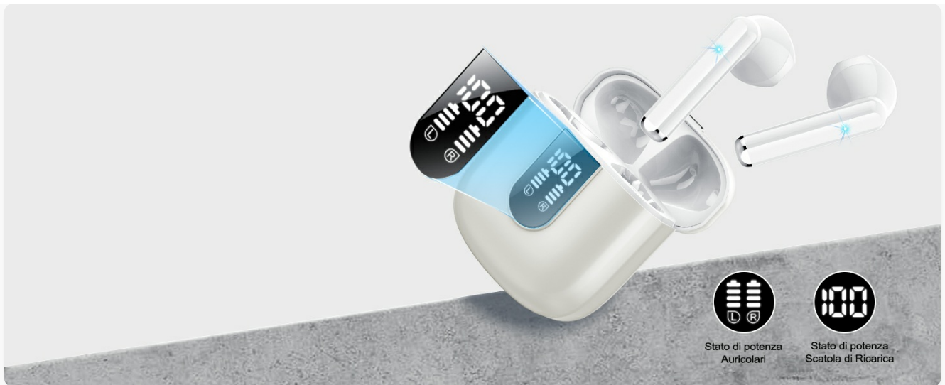
Image 4.1: Charging Case LED Display. This image shows the charging case with its LED display indicating the battery levels for both the case and the individual left and right earbuds.