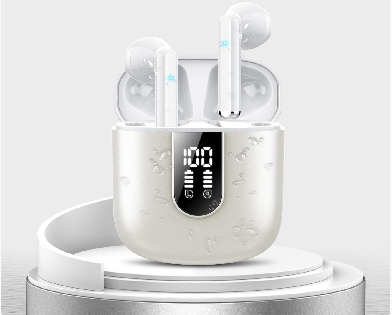
Image 5.3: IP7 Water Resistance. The image shows the earbuds with water droplets, symbolizing their IP7 dust and water resistance, suitable for daily use.

IP7 rating means that you can enjoy music with your BD86 in daily life.