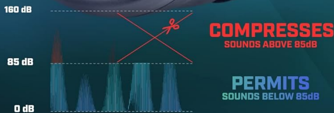
Image: Visual explanation of how the earbuds provide both physical noise reduction and electronic sound compression.

Compresses harmful sounds above 85dB from coming through the earbuds to your ear drums