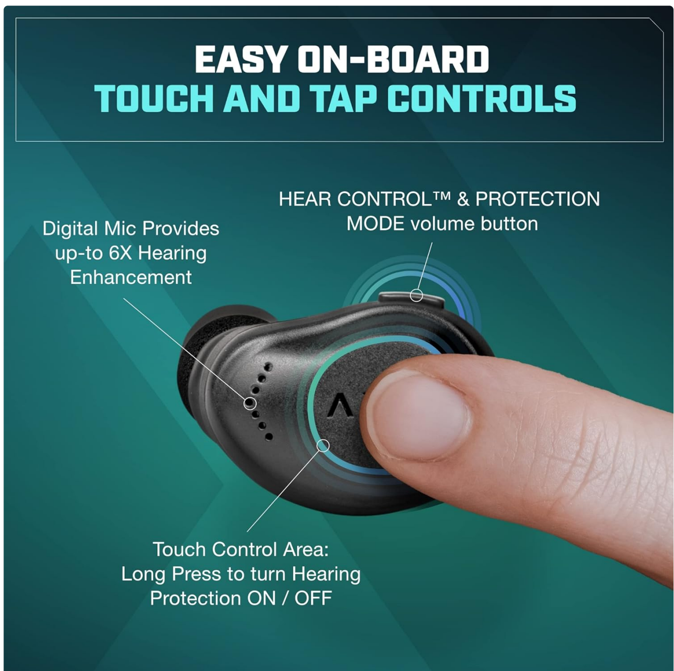
Image: Detailed illustration of the touch and tap controls for the earbuds.