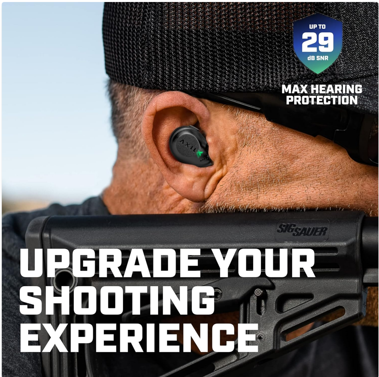
Image: A user demonstrating the earbuds' use in a high-noise environment, emphasizing maximum hearing protection.