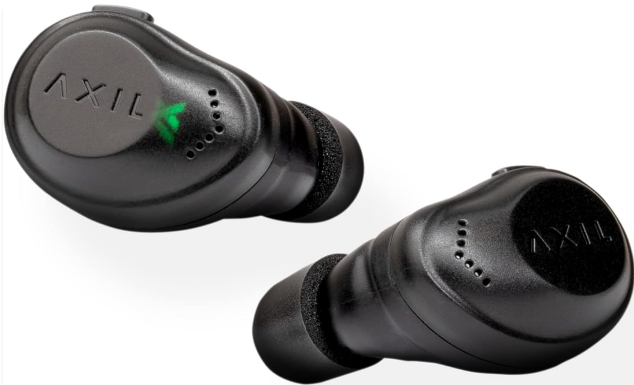
Image: The AXIL XCOR PRO Wireless Earbuds and their compact charging case.