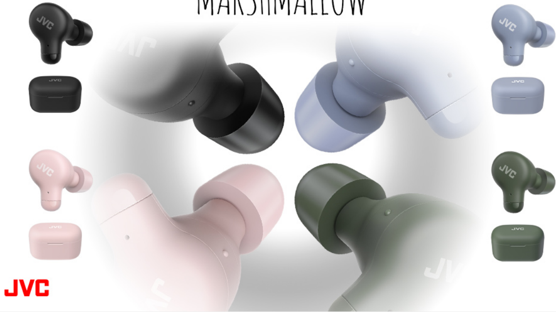
Image: Close-up view of JVC Marshmallow earbuds highlighting the soft and elastic ear tips for a comfortable fit.