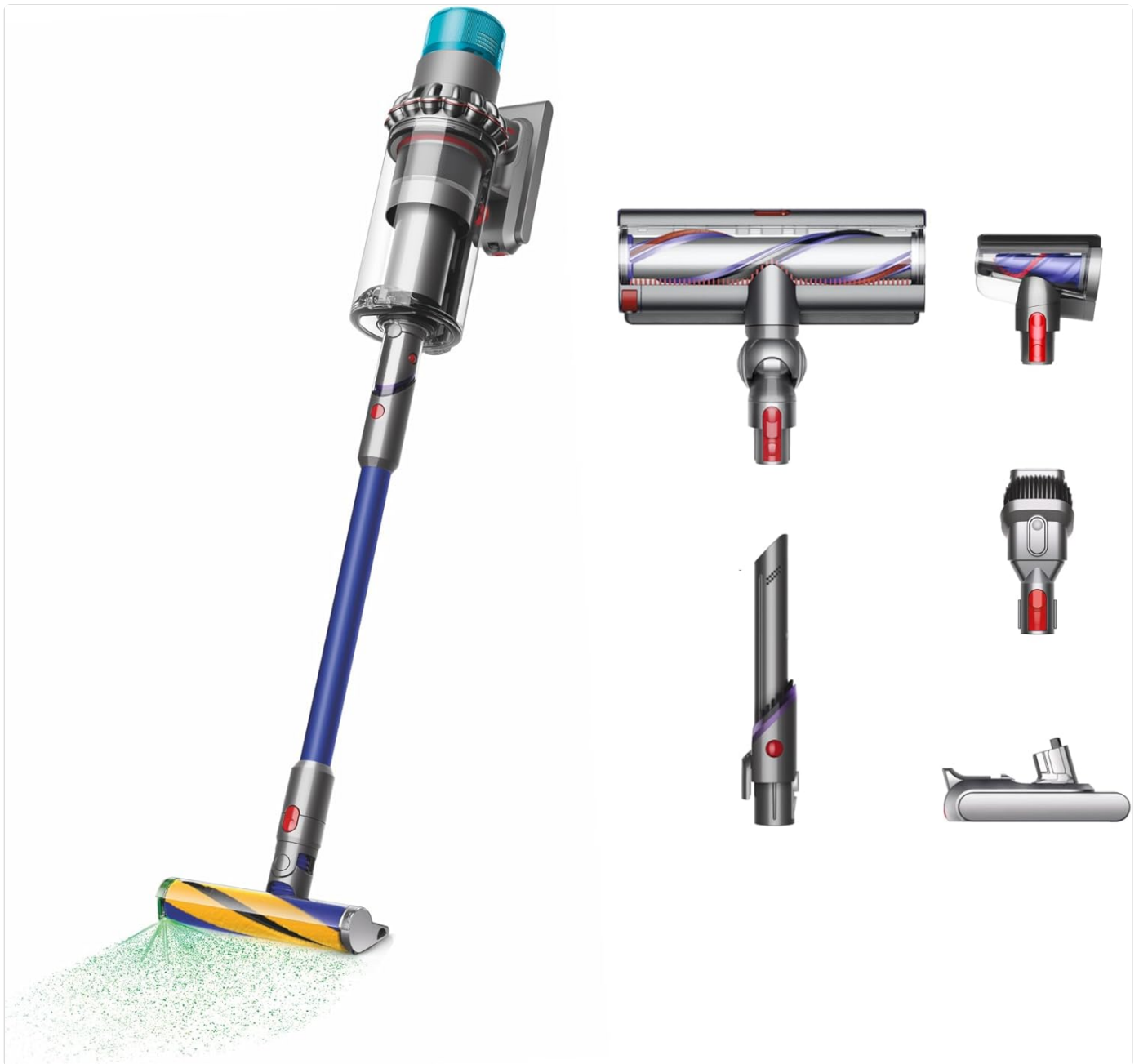
Image: All components included with the Dyson Gen5outsize, including the main vacuum unit, two cleaner heads, wand, various tools, charger, docking station, and two batteries.