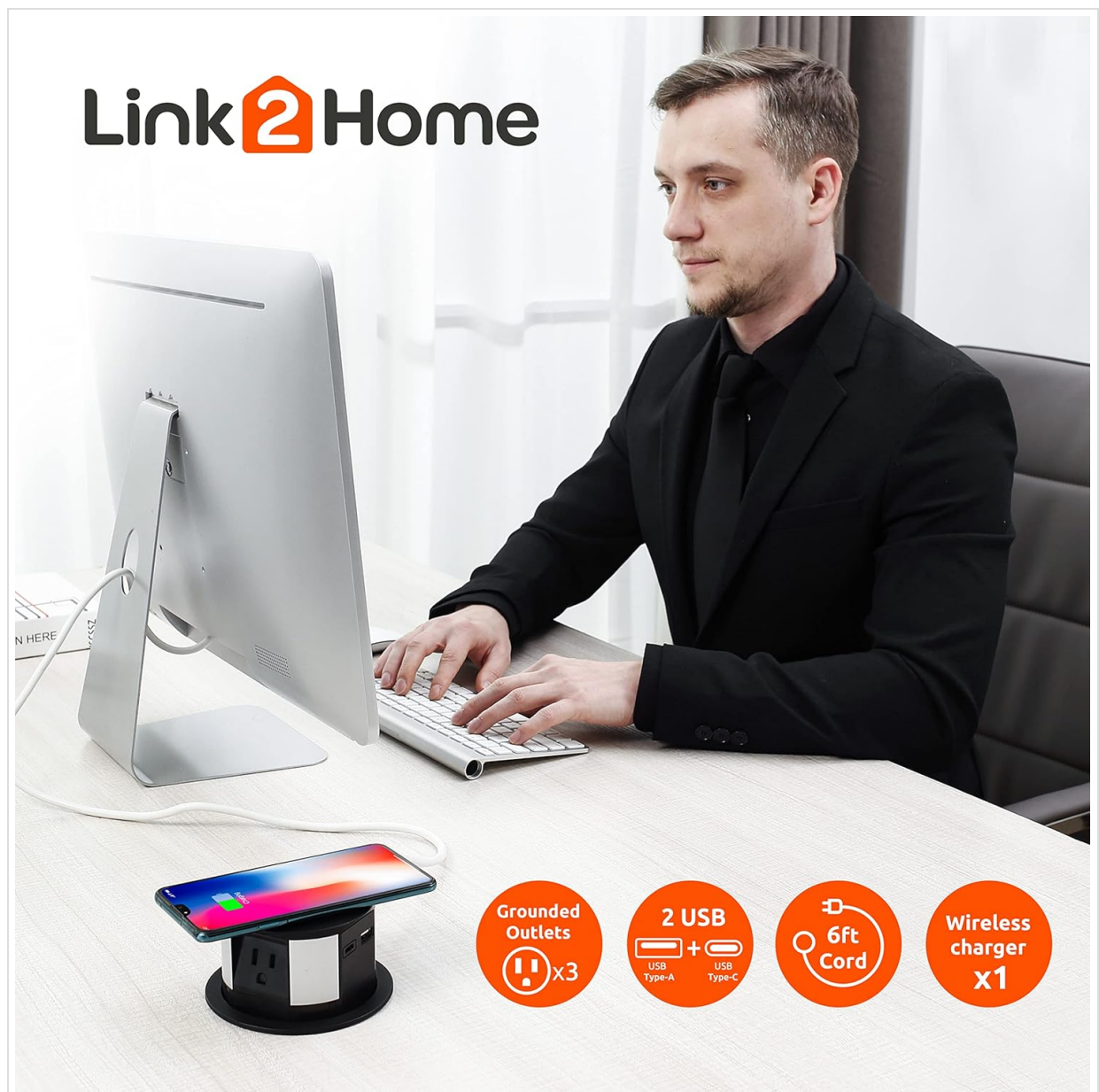
Image 4: A person is shown working at a desk. A smartphone is wirelessly charging on the top surface of the Link2Home Pop Up Outlet, which is extended to provide access to its grounded outlets and USB Type-A/Type-C ports.

Your browser does not support the video tag.