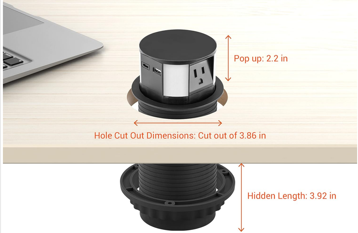
Image 2: A diagram illustrating the required hole cutout dimensions for installation. The pop-up height is 2.2 inches and the hidden length is 3.92 inches, with a hole cutout of 3.86 inches.

Your browser does not support the video tag.