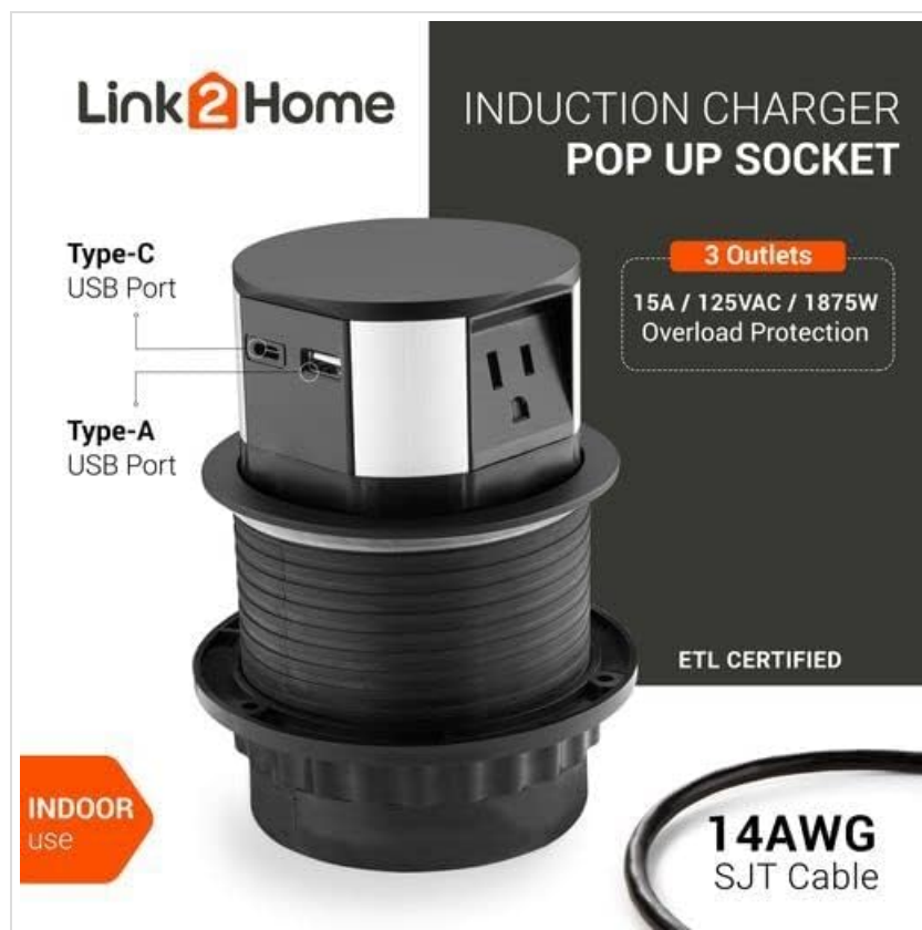
Image 1: The Link2Home Pop Up Outlet in its retracted state, showing the wireless charging pad on top and the Type-C and Type-A USB ports. The image highlights its compact design and various charging options.

The Link2Home Wireless Charging Pop Up Outlet with USB is a versatile power solution designed for modern kitchens, offices, and workshops. This space-saving, retractable power station provides convenient access to electrical outlets and USB charging ports, including a built-in wireless charger. Its splash-resistant housing ensures durability in various environments.