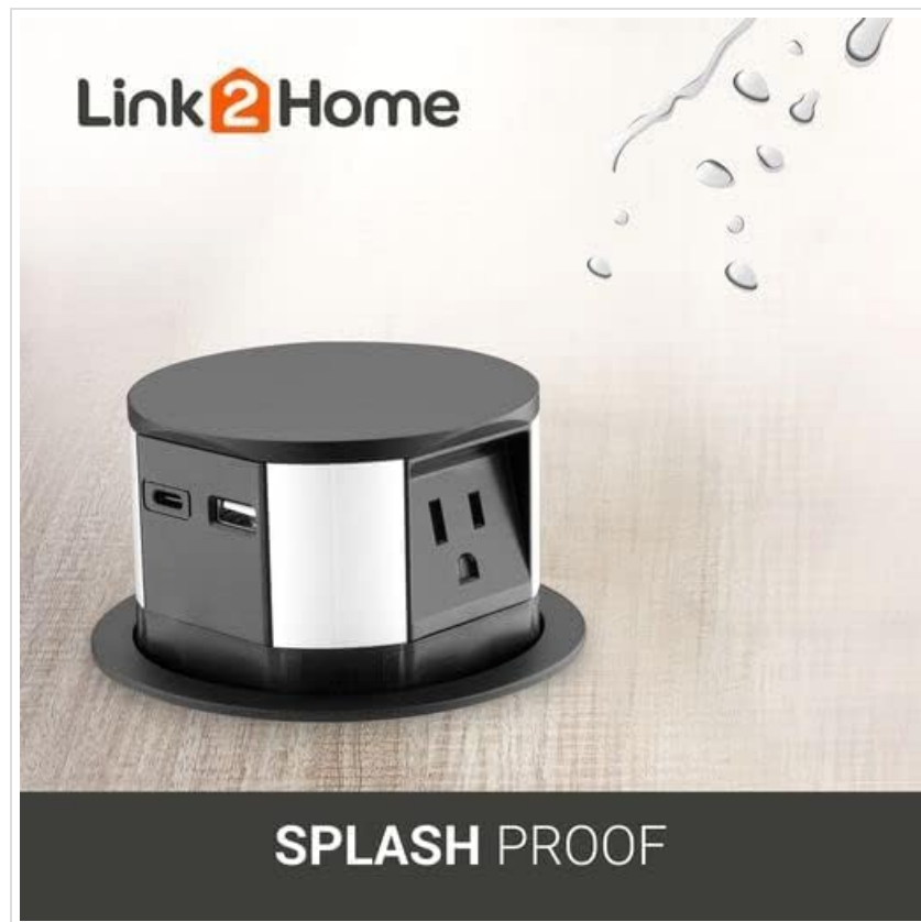
Image 5: The Link2Home Pop Up Outlet is shown with water droplets on its top surface, illustrating its splash-resistant design. The unit is in its retracted position, flush with the countertop.

Your browser does not support the video tag.