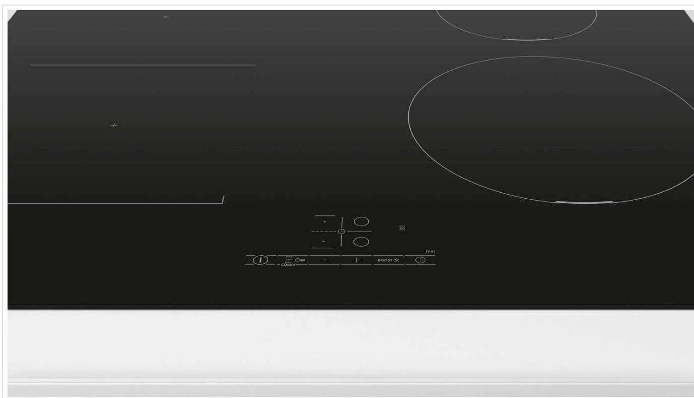
Figure 3: Touch Control Panel. A detailed view of the touch controls, including the power button, individual zone selection, '+' and '-' buttons for power adjustment, and the timer function.