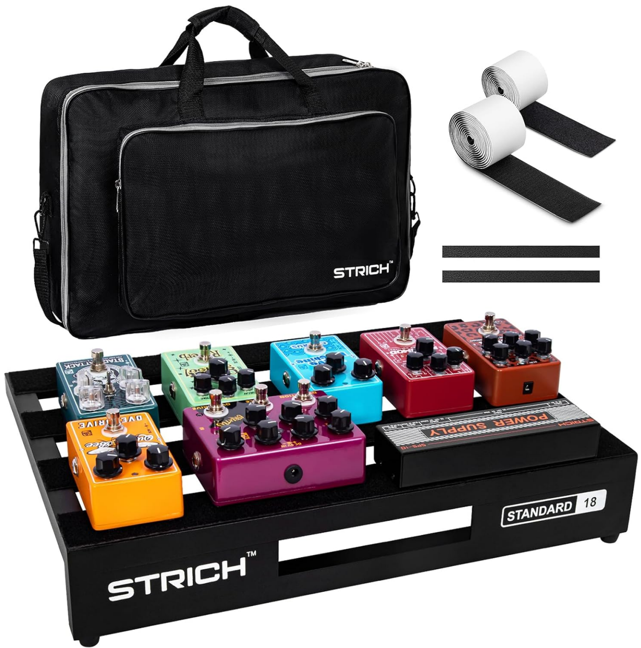
Figure 1: Complete STRICH STANDARD 18 Pedal Board setup, including the board, carry bag, and velcro strips. Effect pedals are shown for illustrative purposes.