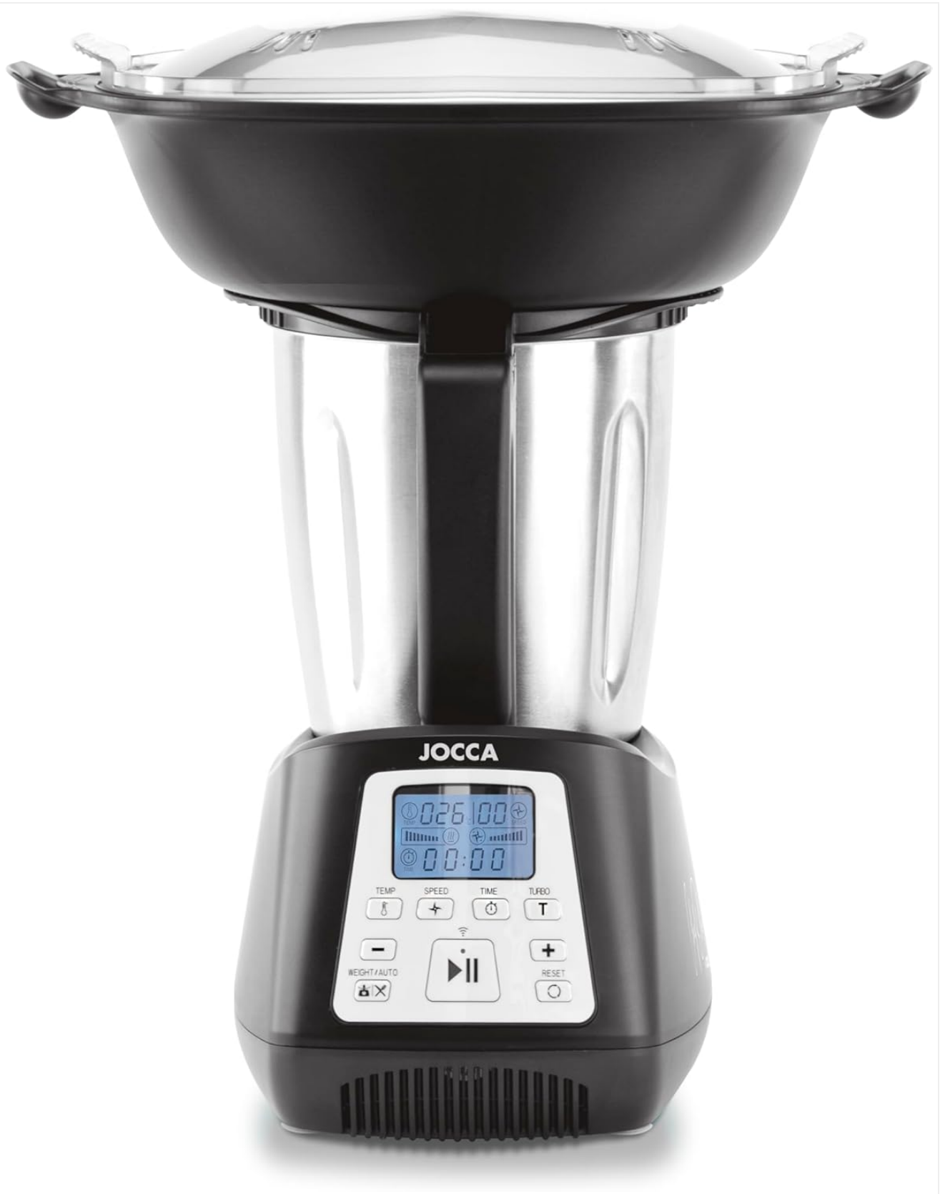
Image 4.1: Close-up of the control panel, showing the digital display for temperature, speed, and time, along with various function buttons.