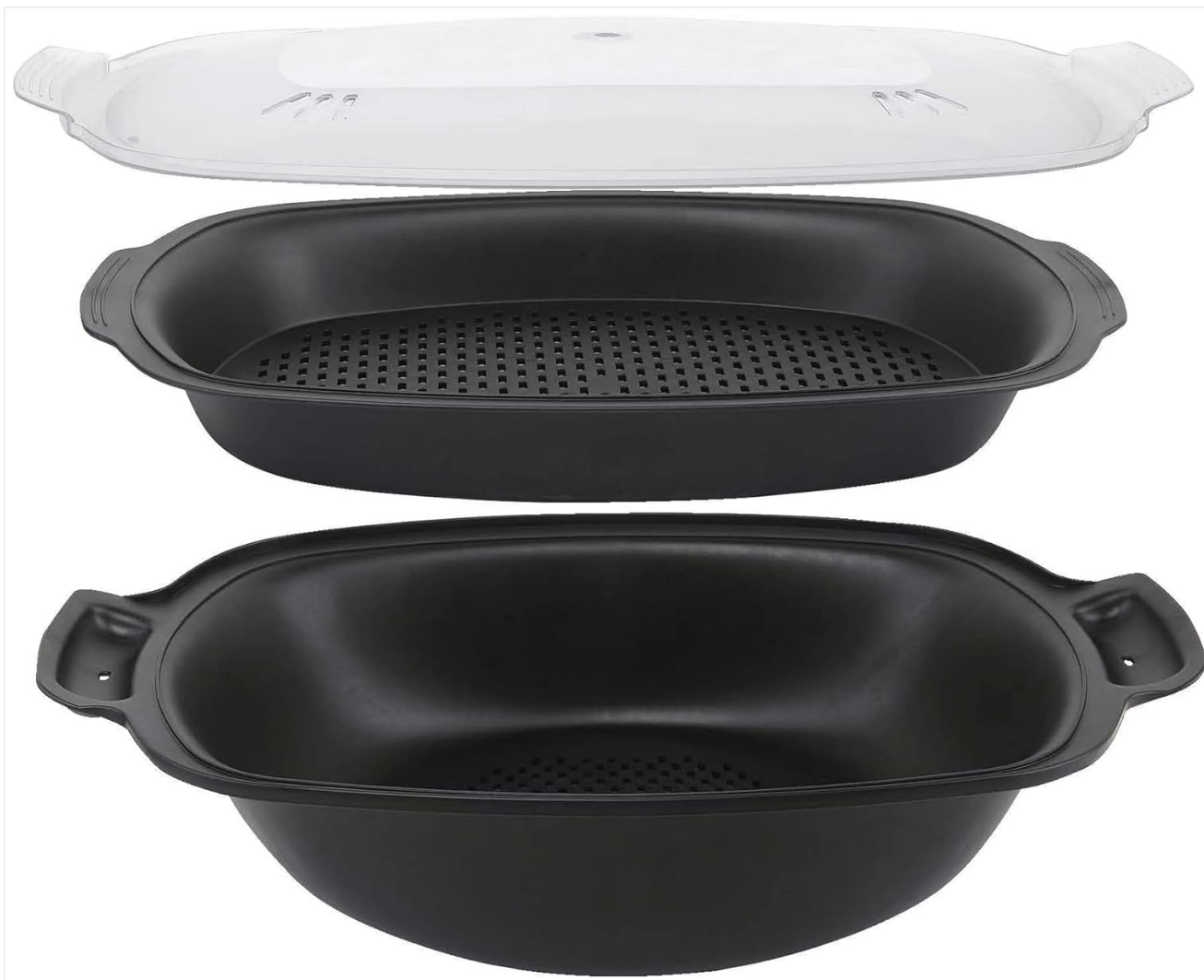
Image 4.4: The complete steaming assembly, including the lower steaming tray, upper steaming tray, and transparent lid, allowing for two levels of steaming.