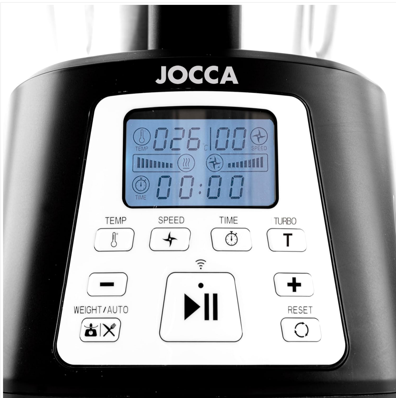
Image 4.2: Detailed view of the control panel buttons and display. This image highlights the temperature, speed, time, turbo, and integrated scale controls.