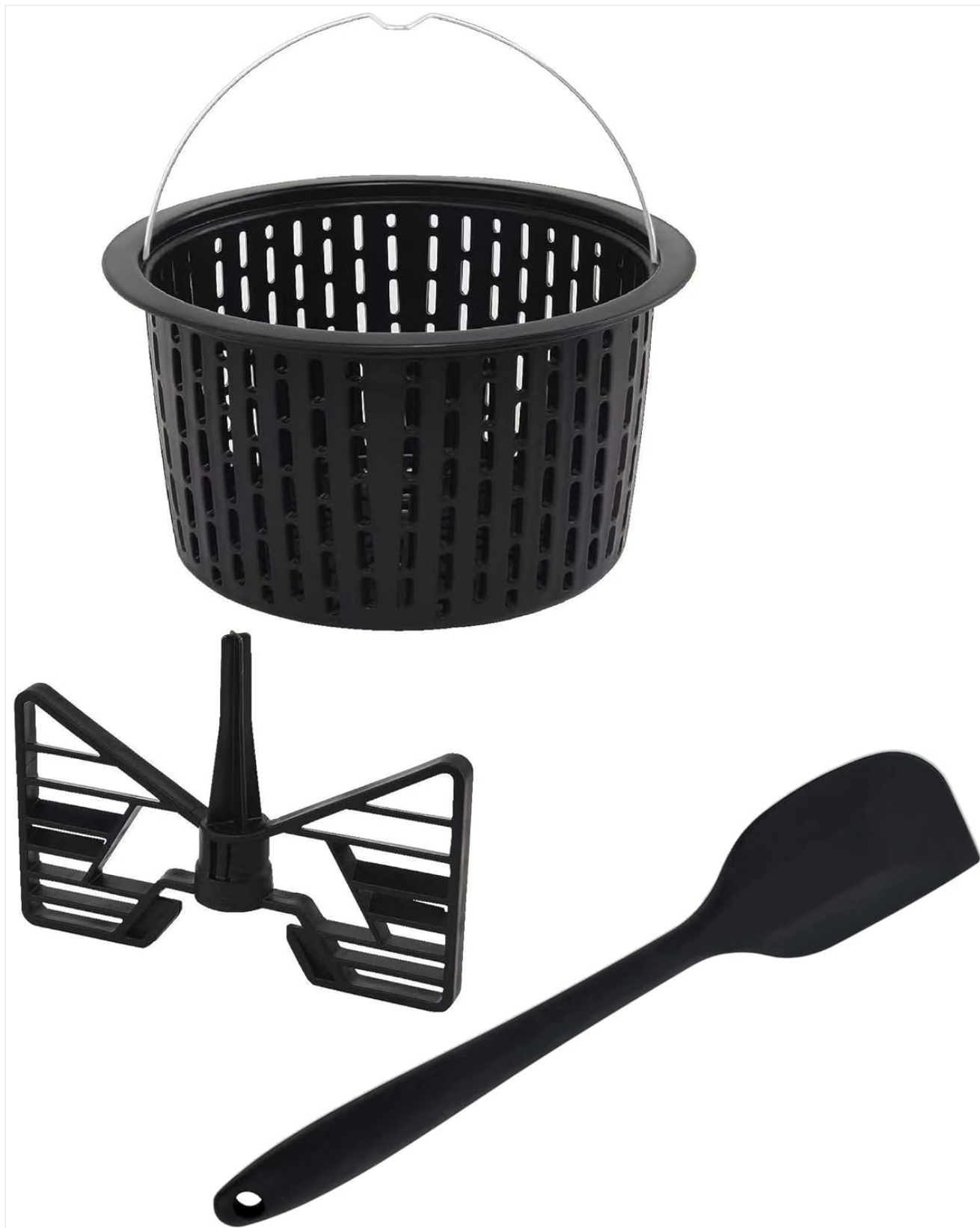
Image 2.2: Included accessories: a basket, a mixing paddle, and a spatula. These tools assist in various food preparation tasks.