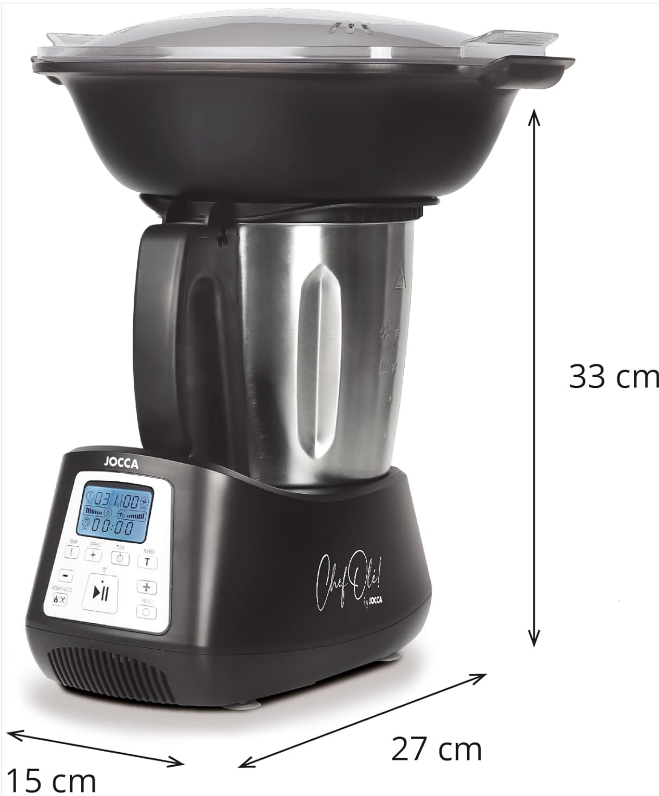
Image 7.1: The Jocca Food Processor with indicated dimensions: approximately 33 cm height, 27 cm depth, and 15 cm width at the base.