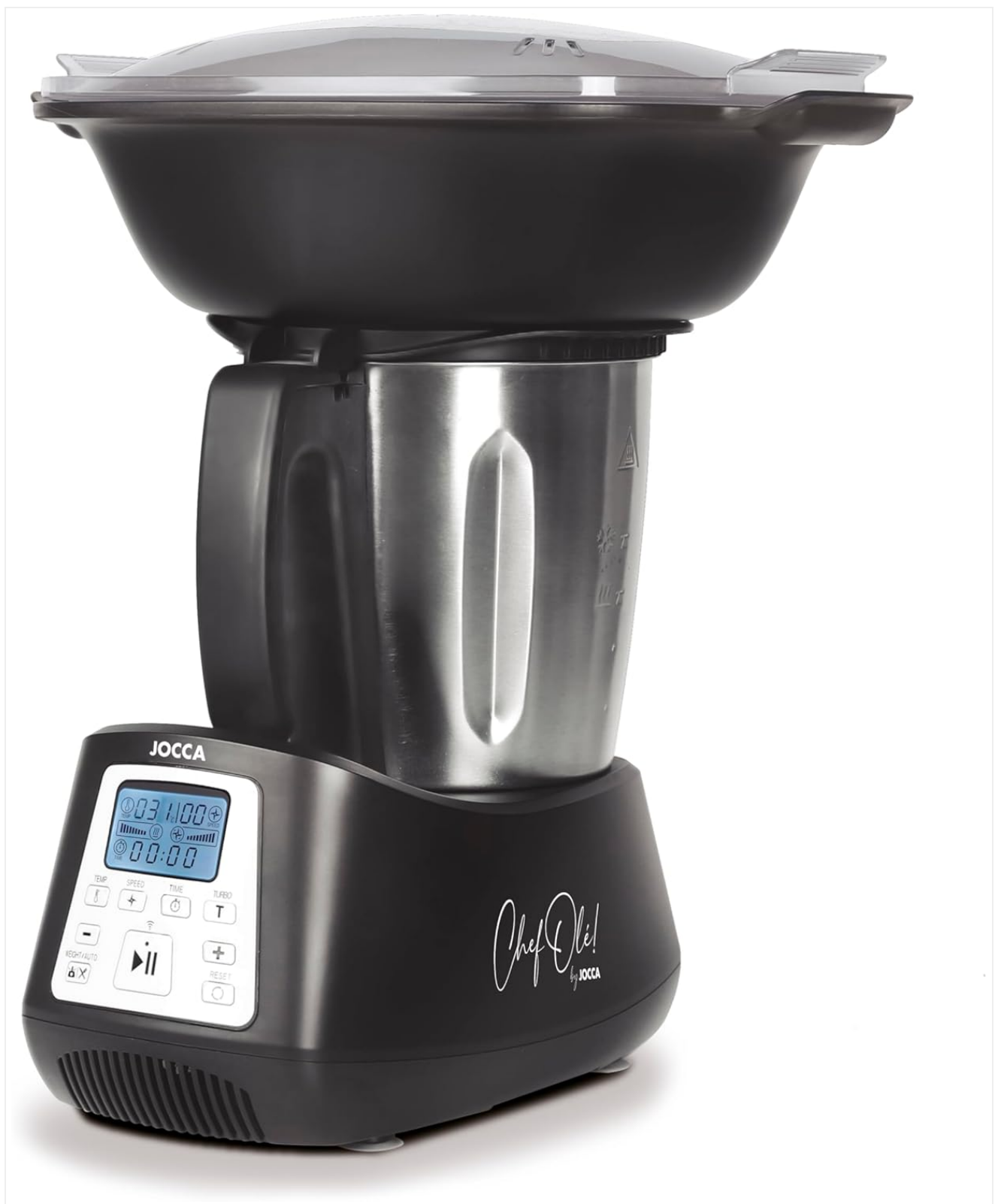
Image 2.1: Front view of the Jocca Multifunction Food Processor. This image displays the main unit with the stainless steel mixing bowl, the control panel, and the steaming basket assembly on top.