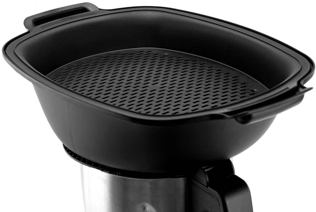
Image 4.3: The steaming basket, designed to fit inside the mixing bowl for healthy cooking.