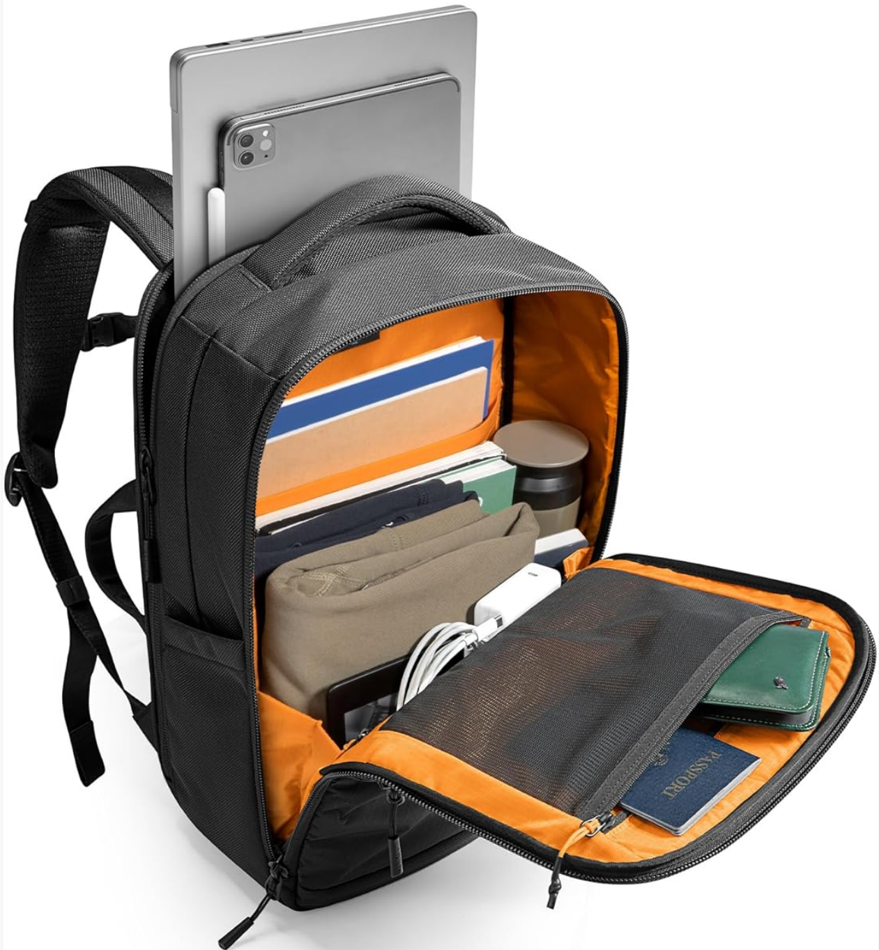
Figure 1: Front view of the tomtoc TechPack-T73 X-Pac Laptop Backpack.

Always stays sharp no matter more or less loaded