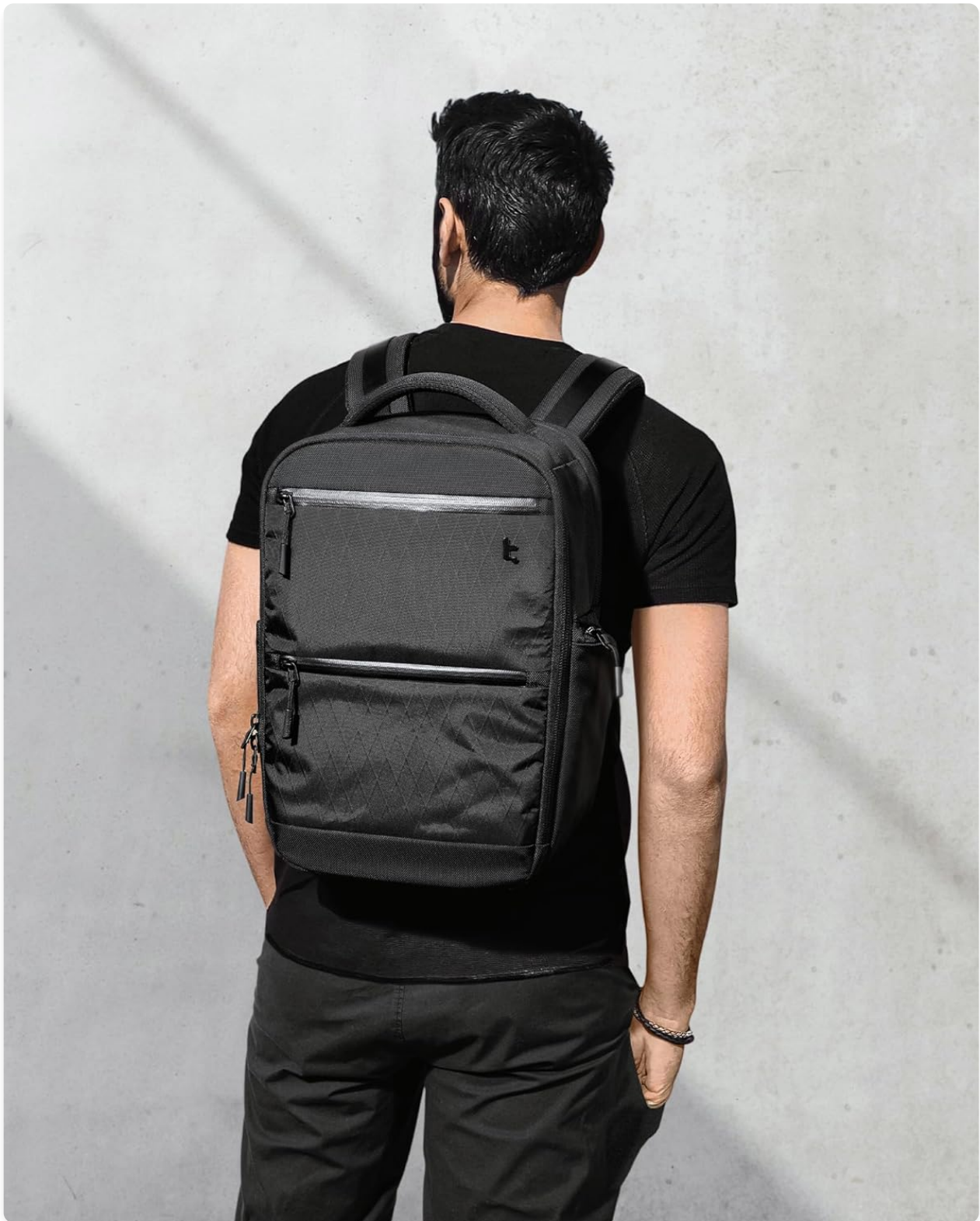
Figure 6: Utilizing the luggage pass-through strap.

Your browser does not support the video tag. This video demonstrates the features and usage of the tomtoc TechPack-T73 X-Pac Laptop Backpack 30L.