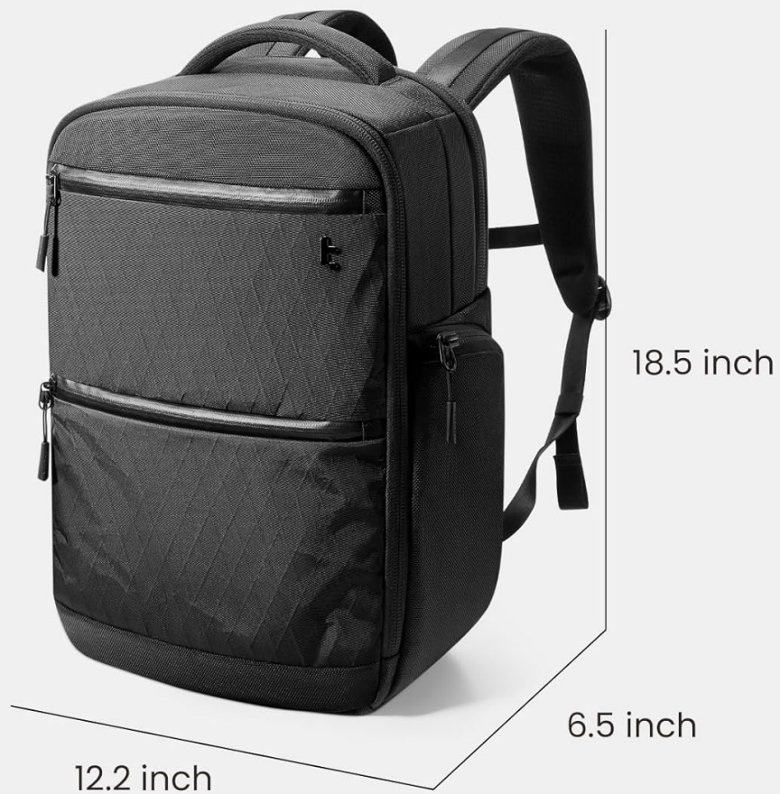
Figure 7: Product dimensions of the tomtoc TechPack-T73 backpack.