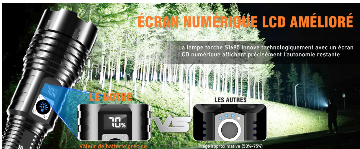
Image: The Shadowhawk S1695 flashlight demonstrating its powerful beam and LCD digital display.