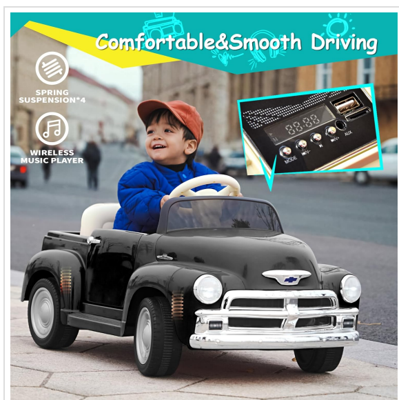
Image: A child enjoying the ride-on car, with an inset showing the built-in media player for music and FM radio.