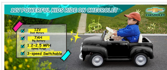
Image: A child operating the ride-on car, highlighting the powerful 12V motor and 7AH battery for stable driving.