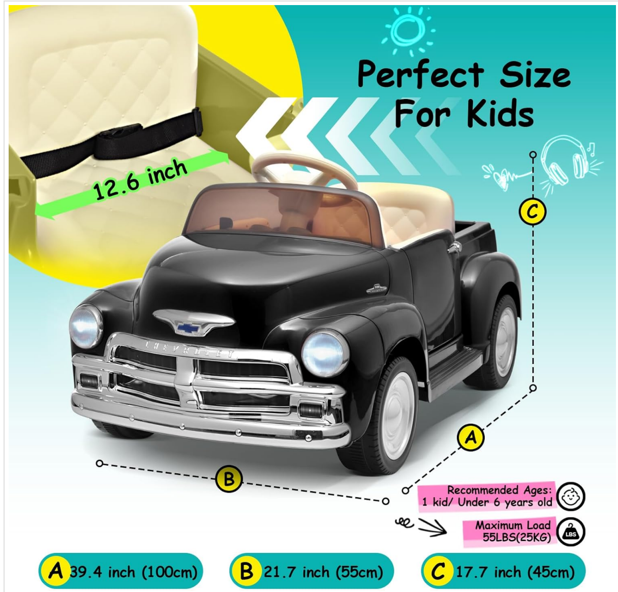
Image: Visual representation of the ride-on car's dimensions and recommended user specifications.