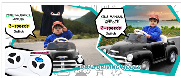
Image: Illustration of the dual driving modes, showing both child manual operation and parental remote control.