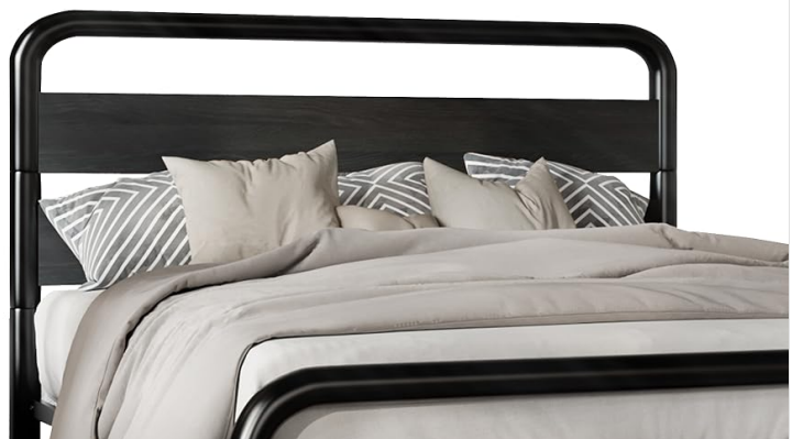
Figure 2: Detail of the wooden headboard, showcasing the blend of metal and wood design.