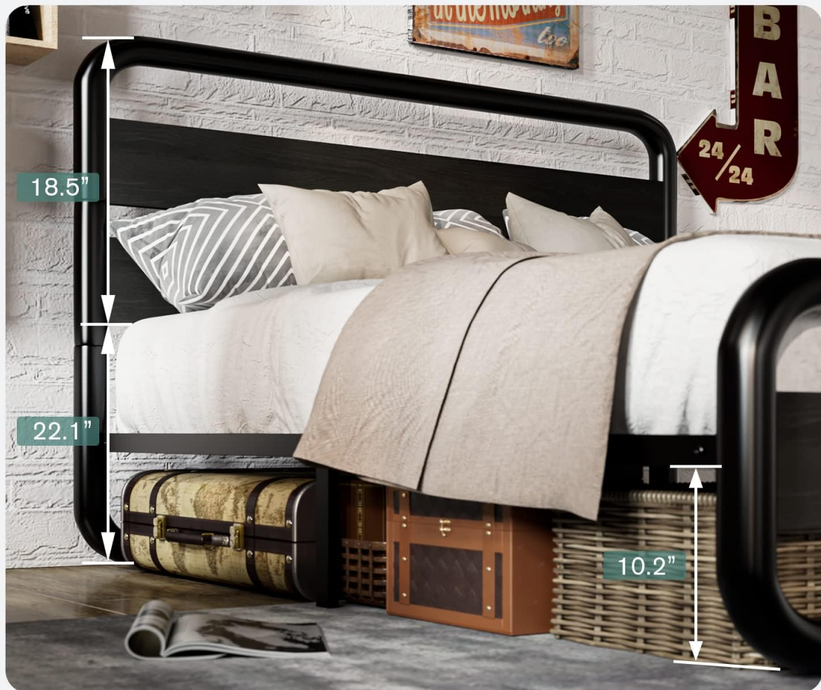
Figure 4: Illustration of the generous 10.2-inch under-bed storage space.