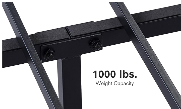
Figure 6: View of the strong metal slats, highlighting their robust construction and 1000 lbs weight capacity.