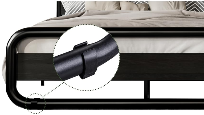
Figure 5: Detail of the non-slip mat or rubber ring on the bed frame leg, designed for floor protection.

Rubber Ring for Protecting Your Beloved Floor