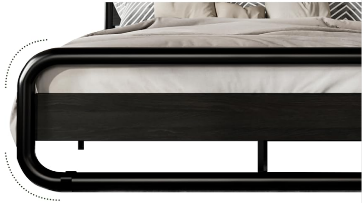
Figure 3: Detail of the rounded wooden footboard, designed to secure the mattress and prevent noise.

Round Edges Design for More Safe and More Assured