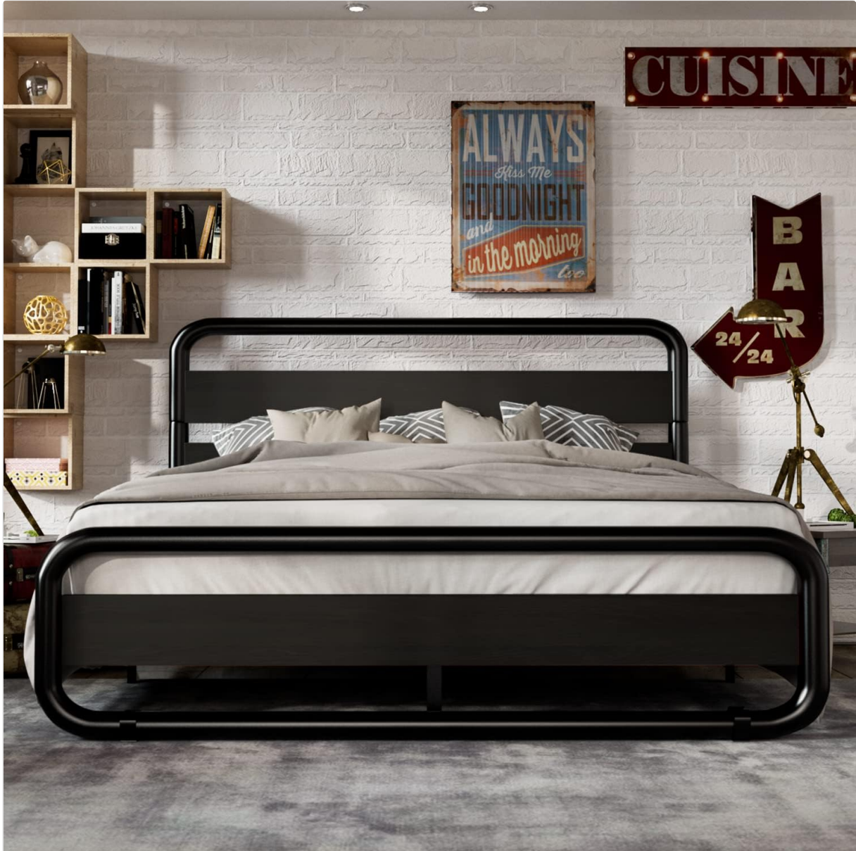
Figure 7: The MUTICOR Queen Size Metal Bed Frame, showcasing its modern design and sturdy construction.