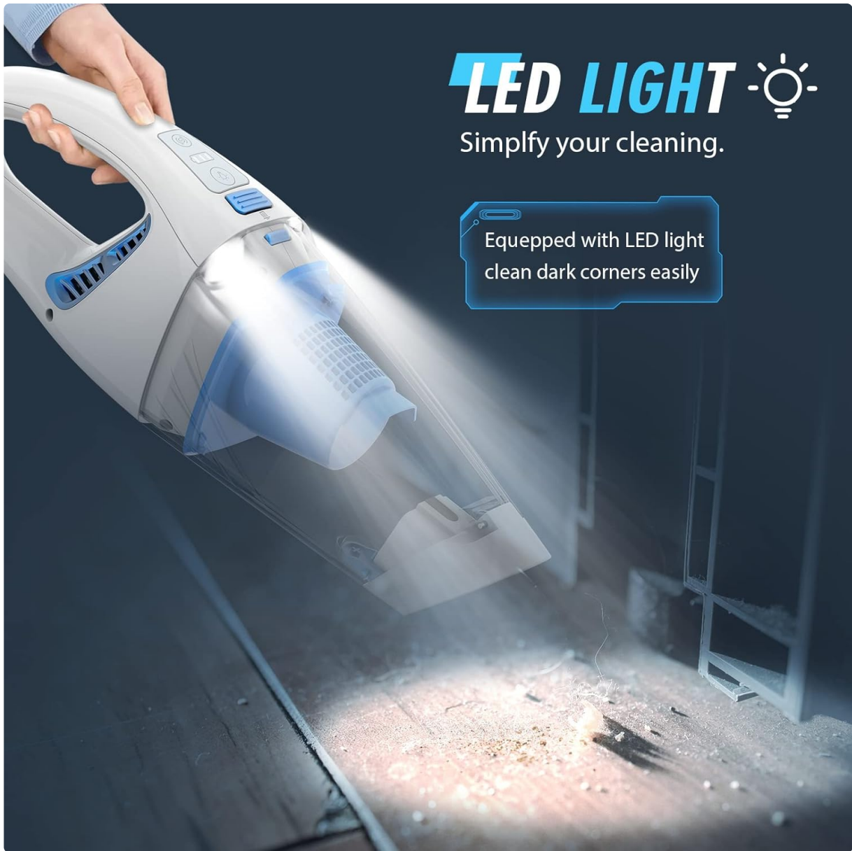
Image: The handheld vacuum's LED light illuminates a dark corner, simplifying cleaning in low-light conditions.