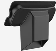
Image: Demonstrates the use of brush, long-mouth, and wide-mouth suction nozzles for different cleaning scenarios.