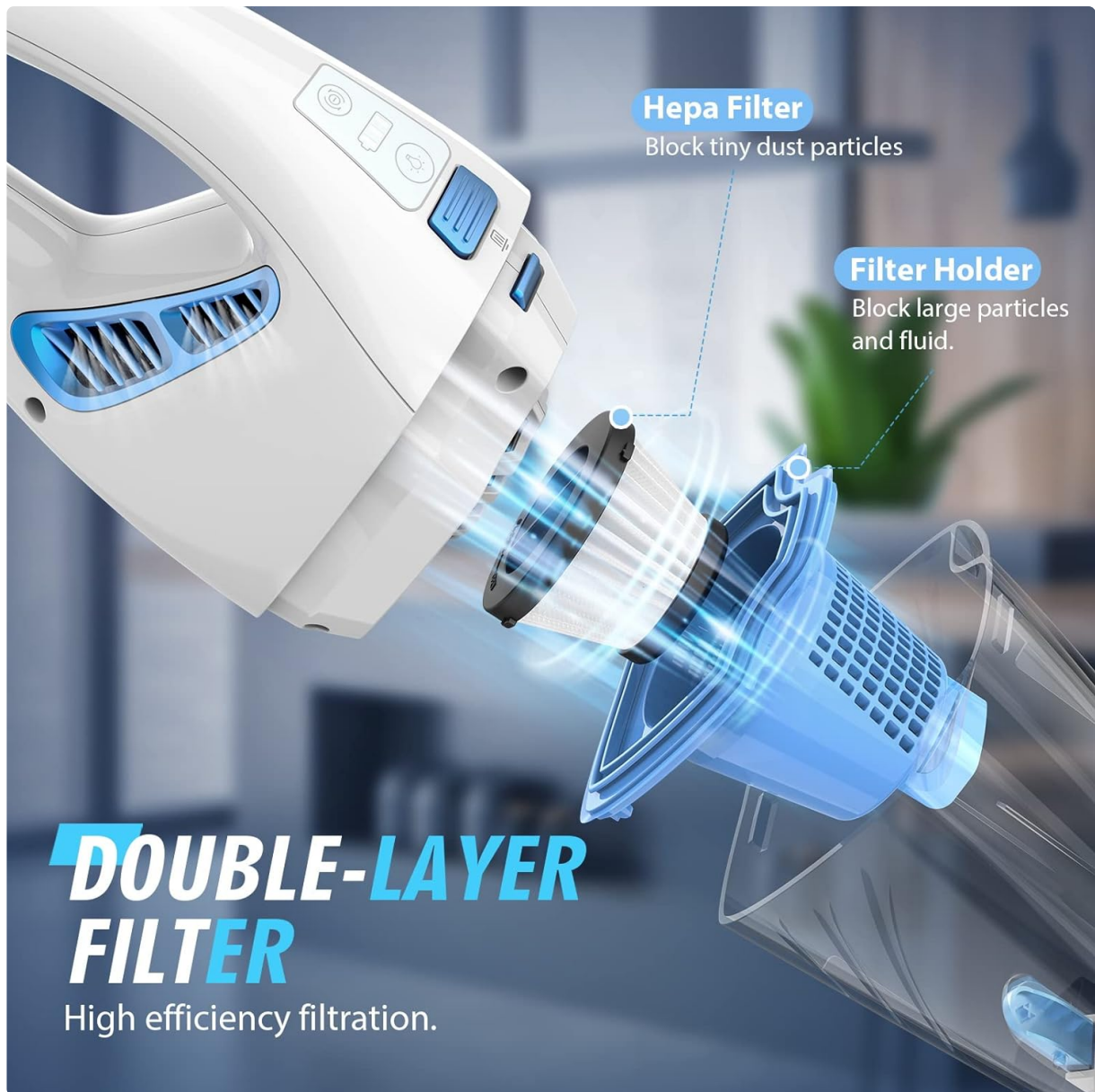
Image: An exploded view showing the double-layer filter system, including the HEPA filter and filter holder.