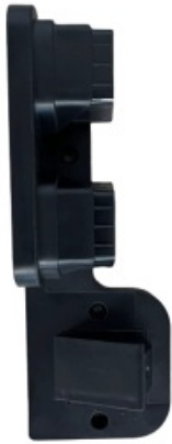
Image: The USB charging cable for the vacuum cleaner.