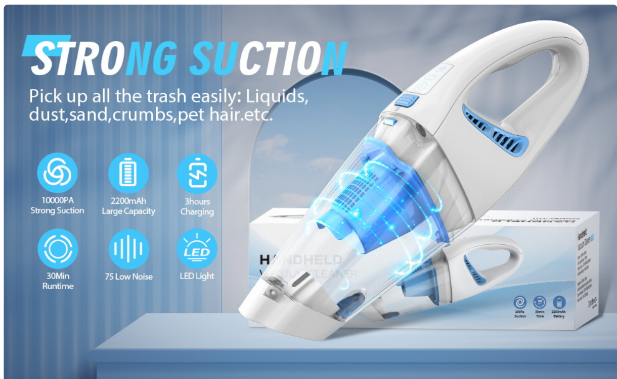
Image: The Bossdan Handheld Cordless Vacuum Cleaner with its various attachments and charging dock.

Thank you for choosing the Bossdan Handheld Cordless Vacuum Cleaner, Model ATJ. This manual provides essential information for the safe and efficient operation, maintenance, and troubleshooting of your new device. Please read this manual thoroughly before use and retain it for future reference.