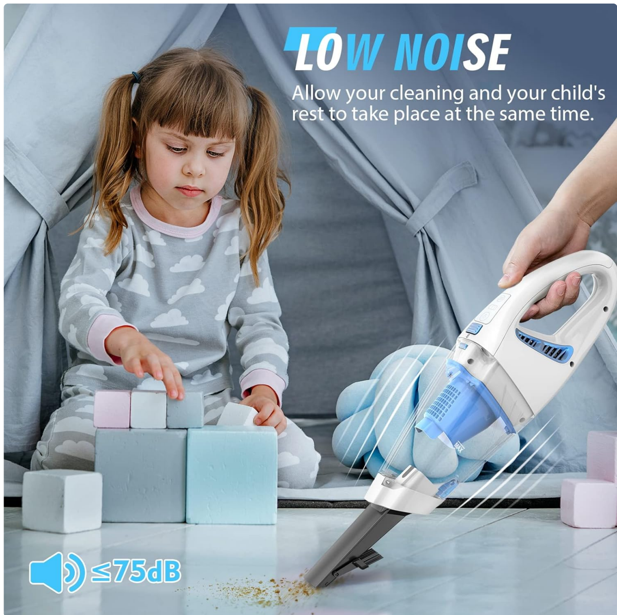
Image: A child plays near the operating handheld vacuum, highlighting its low noise level.

Video: A demonstration of the Bossdan Handheld Vacuum's features, including LED lights and various accessories.