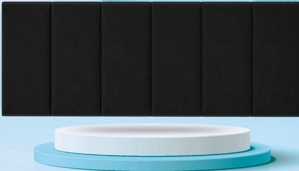
Image: A graphic emphasizing key features such as easy installation, soft-touch fabric, easy cleaning, and quality finish.