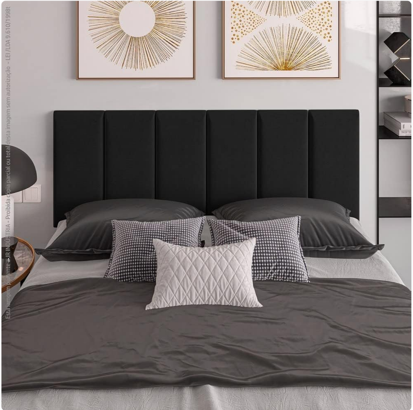
Image: The Dubai Upholstered Headboard, black, installed behind a bed with pillows and bedding, showcasing its modern design.

bedroom's aesthetic. While no complex assembly is required for the headboard itself, it needs to be securely attached to your bed frame or wall.