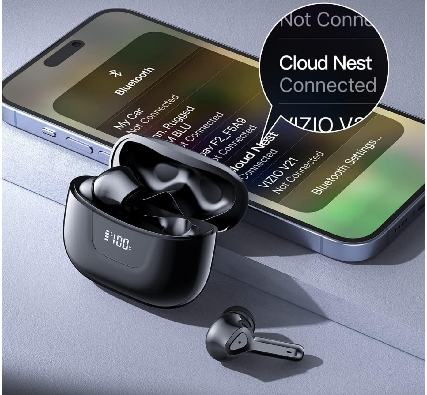
Image: Depicts a smartphone screen showing Bluetooth settings with the earbuds' name "Cloud Nest" connected, illustrating the one-step auto pairing process.