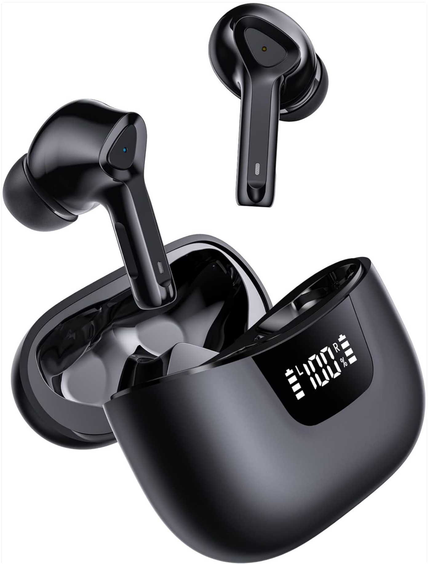
Image: The DBSOARS wireless earbuds shown with their charging case, highlighting their sleek black design and the digital display on the case.