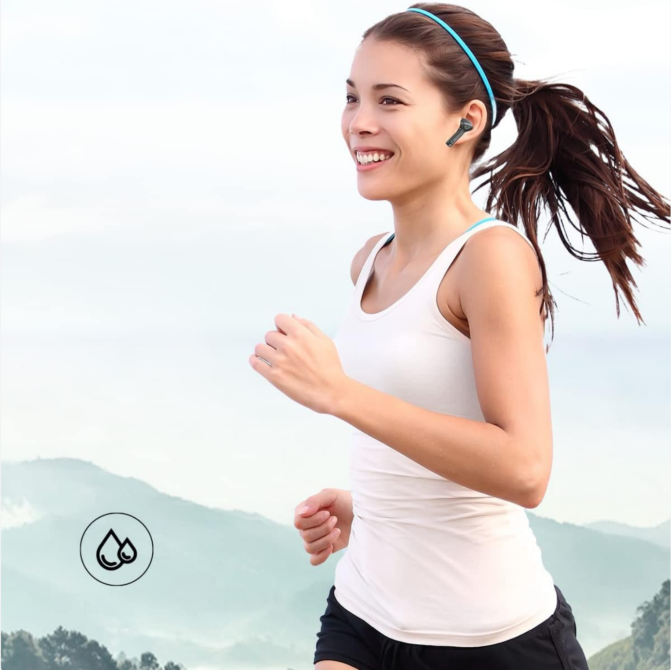
Image: A person is shown running outdoors while wearing the earbuds, demonstrating their suitability for active use due to their IPX5 waterproof rating.

Effectively prevent earbuds from being damage of sweat during workouts