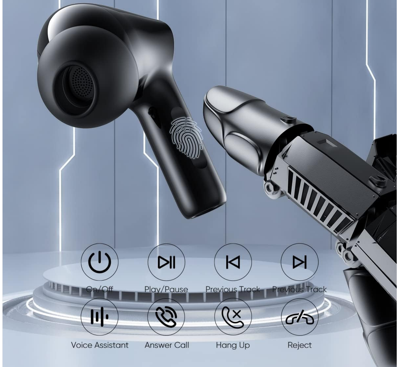
Image: Diagram illustrating the various smart touch control functions on the earbuds, including On/Off, Play/Pause, Previous/Next Track, Voice Assistant, Answer Call, Hang Up, and Reject Call.