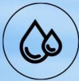
Image: The earbuds are shown with water droplets, illustrating their IPX5 waterproof capability, which protects them from sweat during workouts.