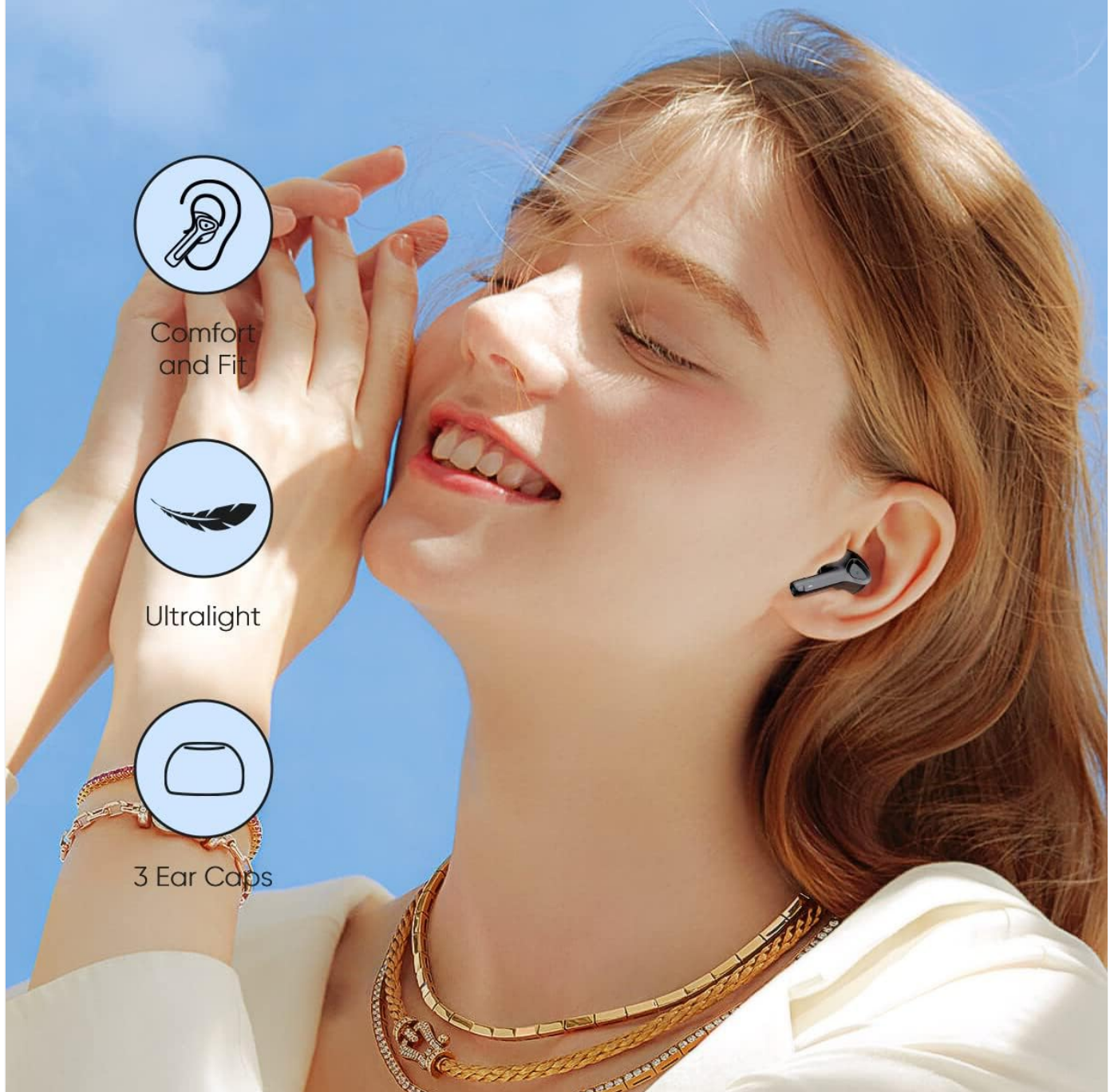
Image: Illustrates the ergonomic design of the earbuds, emphasizing comfort, ultralight weight, and the inclusion of 3 ear cap sizes for a customized fit.