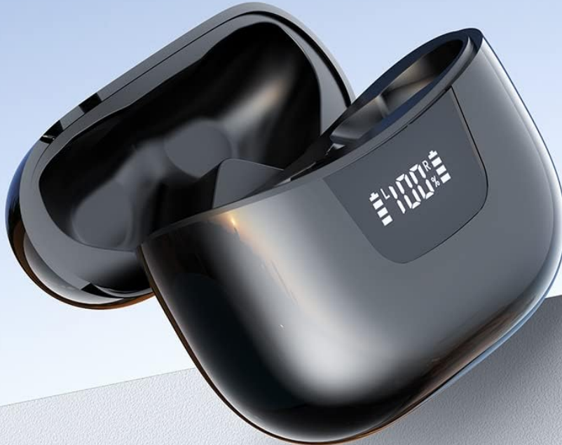
Image: Close-up of the charging case displaying the battery percentage for the case and individual earbud battery levels, indicating the case can fully charge earbuds 4 times.