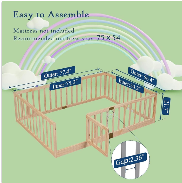
Figure 1: Easy Assembly Diagram. The bed is designed for straightforward setup.

Assembly is required for this product. Please follow the included hardware and instructions carefully. A power drill may be helpful for pre-drilling holes if not already present, as noted by some users for hinge installation.