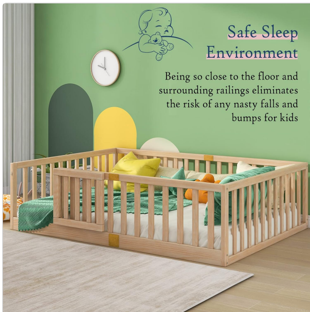
Figure 3: Tatub Montessori Floor Bed with Guardrails. Provides safety and closeness for a settled night's sleep.

Provide safety and closeness for a settled night's sleep