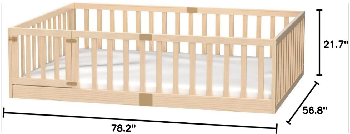
Figure 5: Product Dimensions. Refer to this diagram for precise measurements.