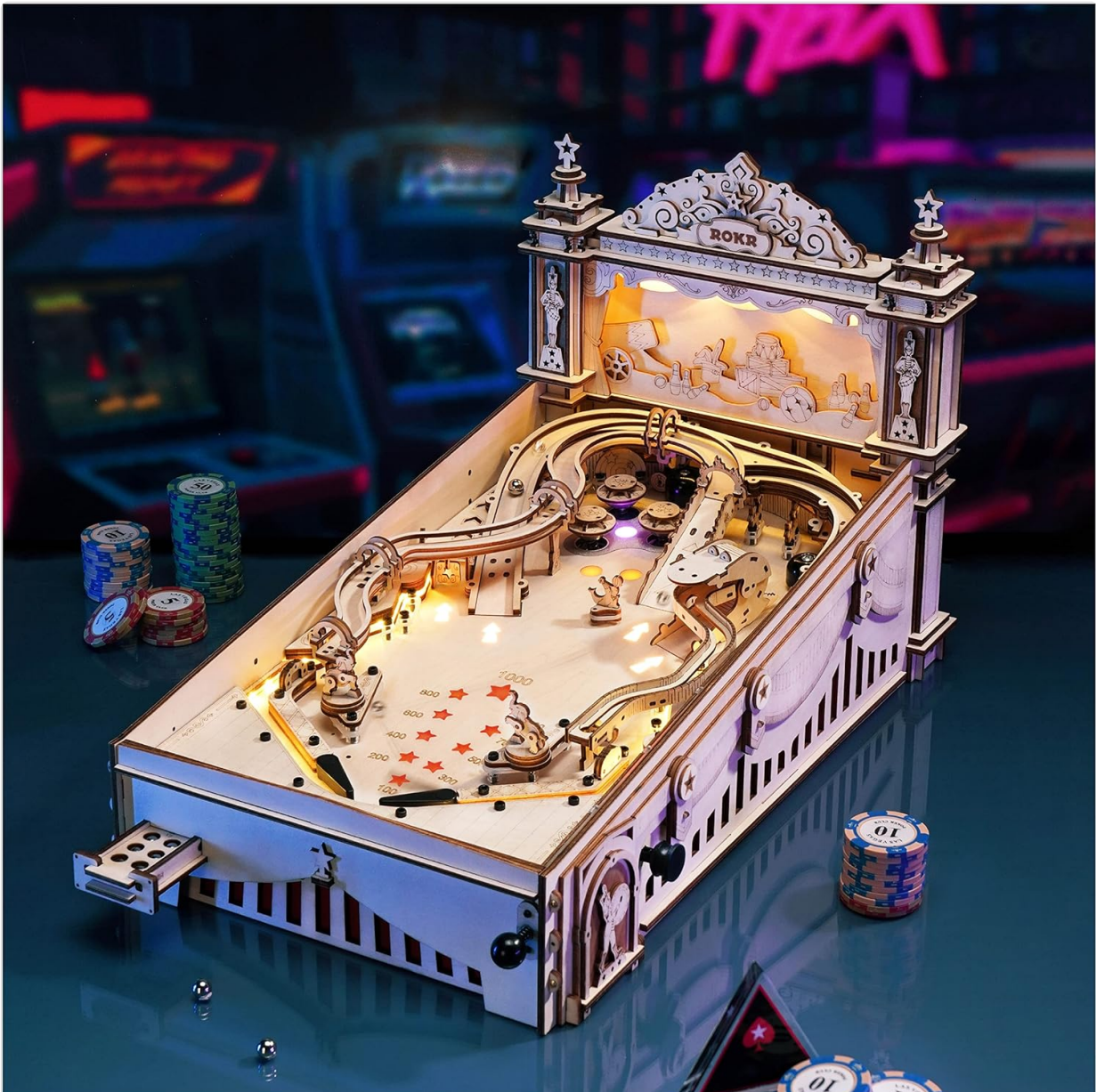
Image: The ROKR pinball machine illuminated and ready for play, showcasing the detailed wooden playfield and lights.

Your browser does not support the video tag.