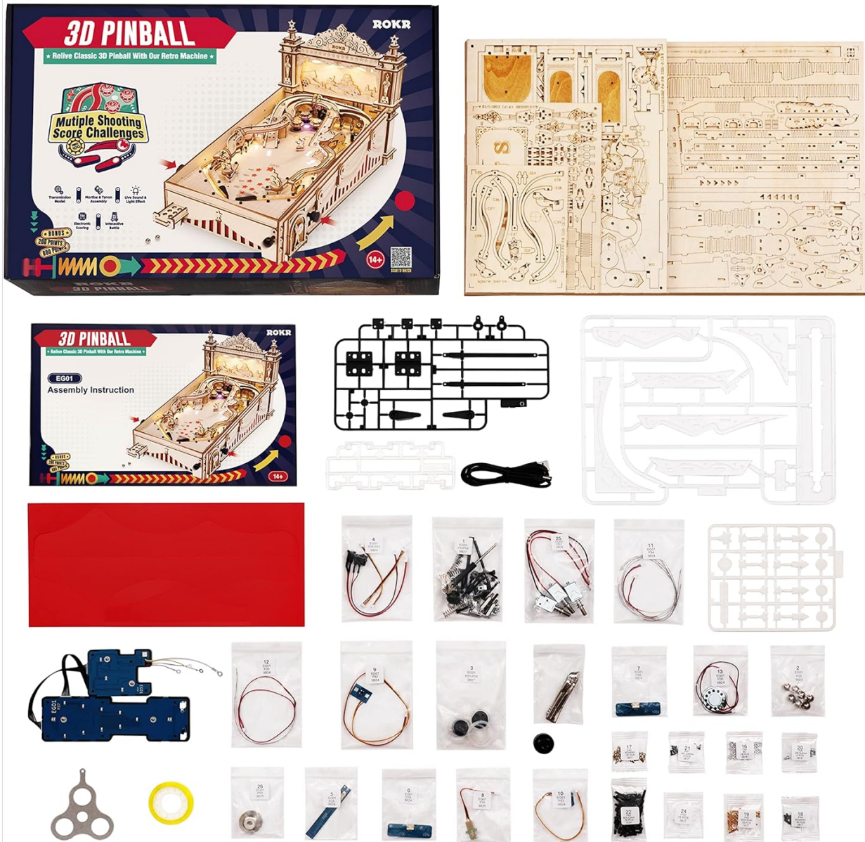
Image: Overview of all components included in the kit, including wooden sheets, electronic parts, and tools.