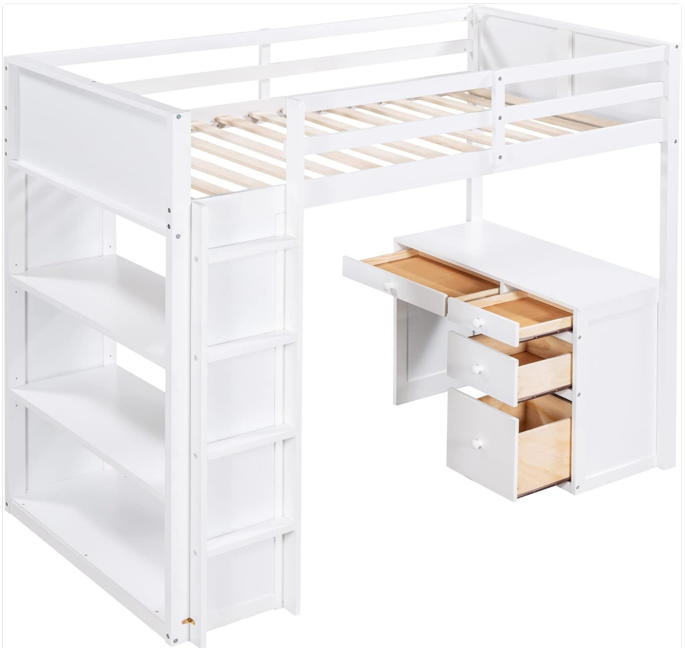
Image: A detailed view of the desk's drawers, showing them partially open to illustrate the storage capacity and smooth operation.