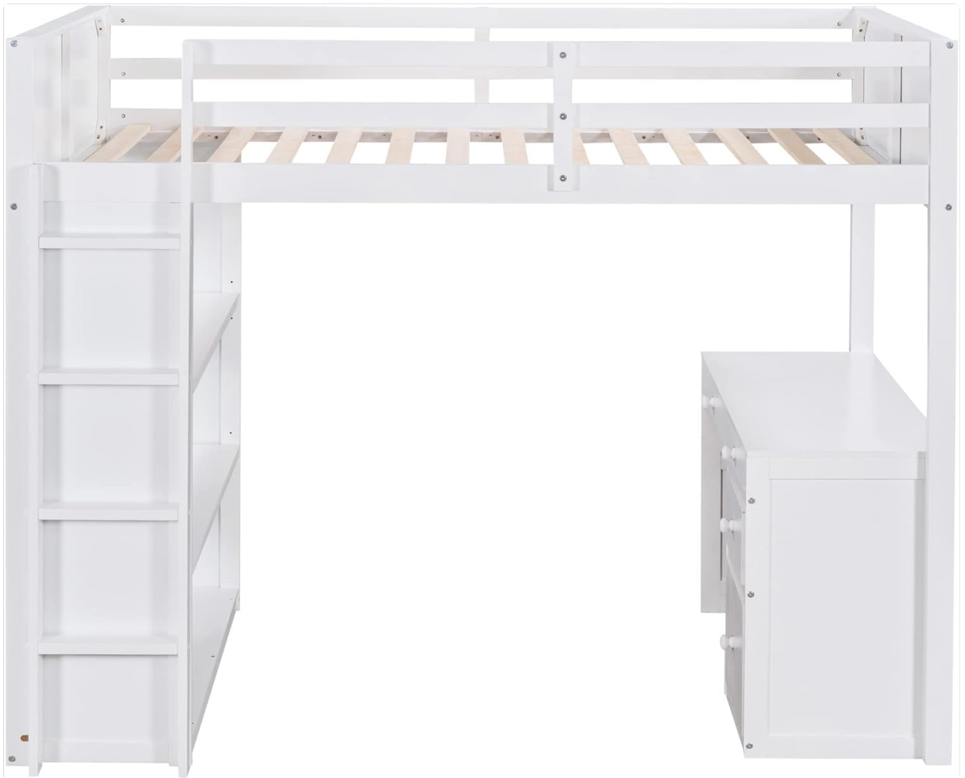
Image: A close-up view of the integrated desk and shelving unit of the loft bed, highlighting the functional design for study and storage.