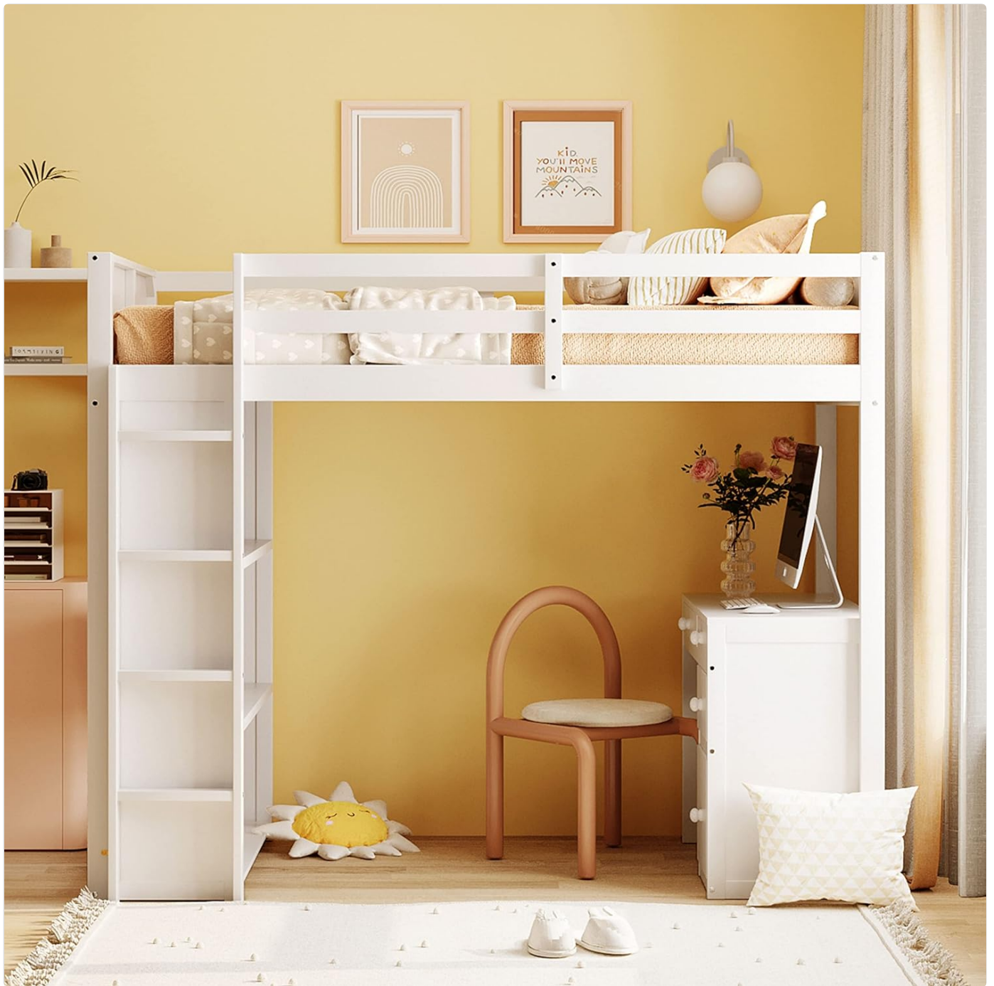
Image: Fully assembled ModernLuxe Twin Size Loft Bed, showcasing the integrated desk and shelving unit. The bed is white and features a ladder for access to the upper bunk.