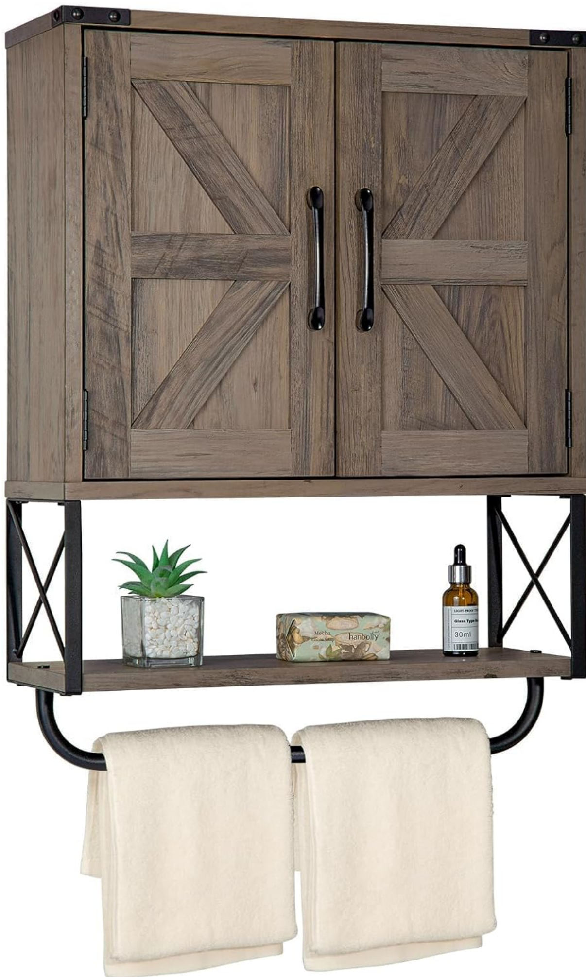
Image: The RUSTOWN Farmhouse Wall-Mounted Medicine Cabinet in Washed Oak, featuring two barn doors, an open