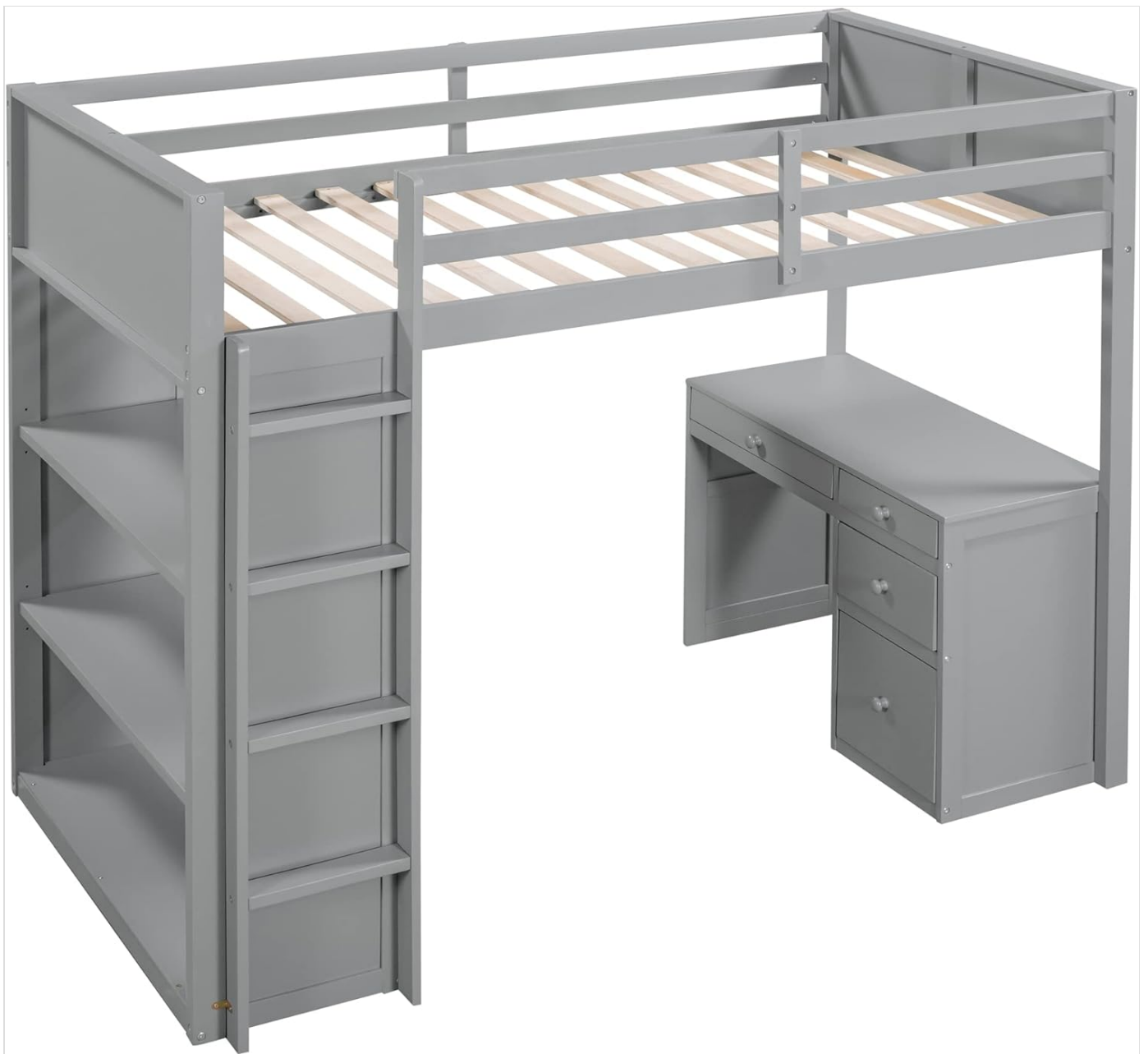
Image: A front perspective of the ModernLuxe Twin Size Loft Bed, clearly showing the desk area with drawers and the adjacent shelving unit beneath the elevated bed.