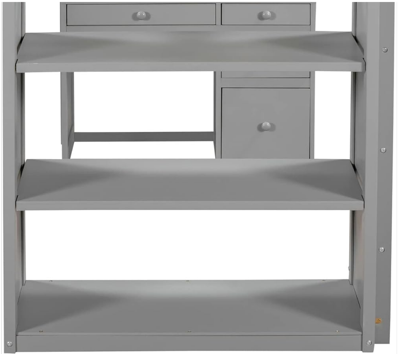
Image: A detailed close-up of the ModernLuxe Twin Size Loft Bed's integrated desk and shelving unit, showing the design and storage capabilities.