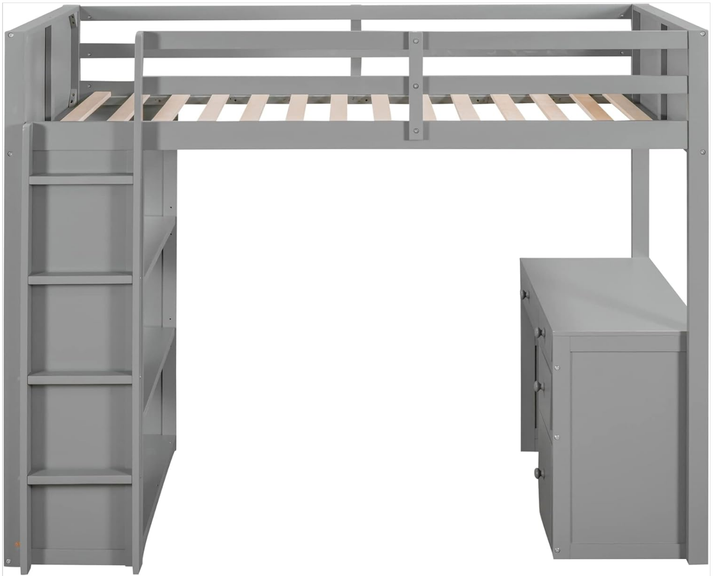
Image: An aerial view of the ModernLuxe Twin Size Loft Bed, providing a clear perspective of the bed frame structure and the integrated desk area below.