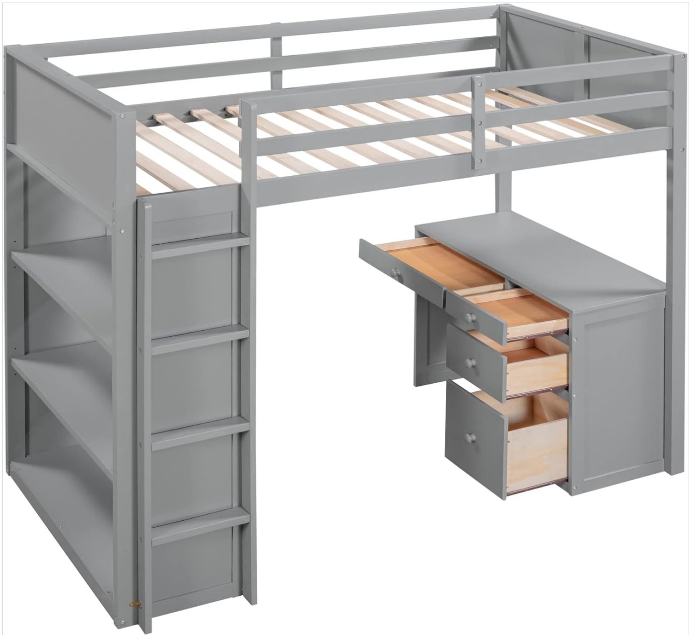
Image: A side view of the ModernLuxe Twin Size Loft Bed, highlighting the sturdy ladder for access to the bed and the multi-tiered shelving unit.