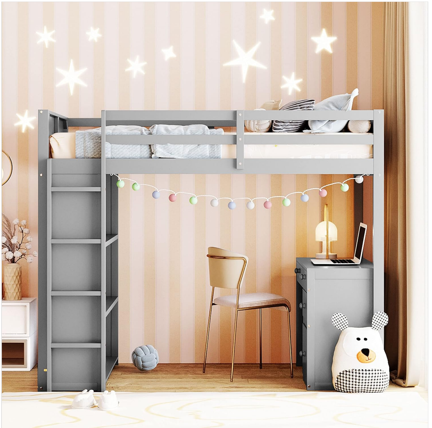
Image: The ModernLuxe Twin Size Loft Bed fully assembled, showcasing the elevated bed, integrated desk with drawers, and side shelving unit, all in a gray finish.