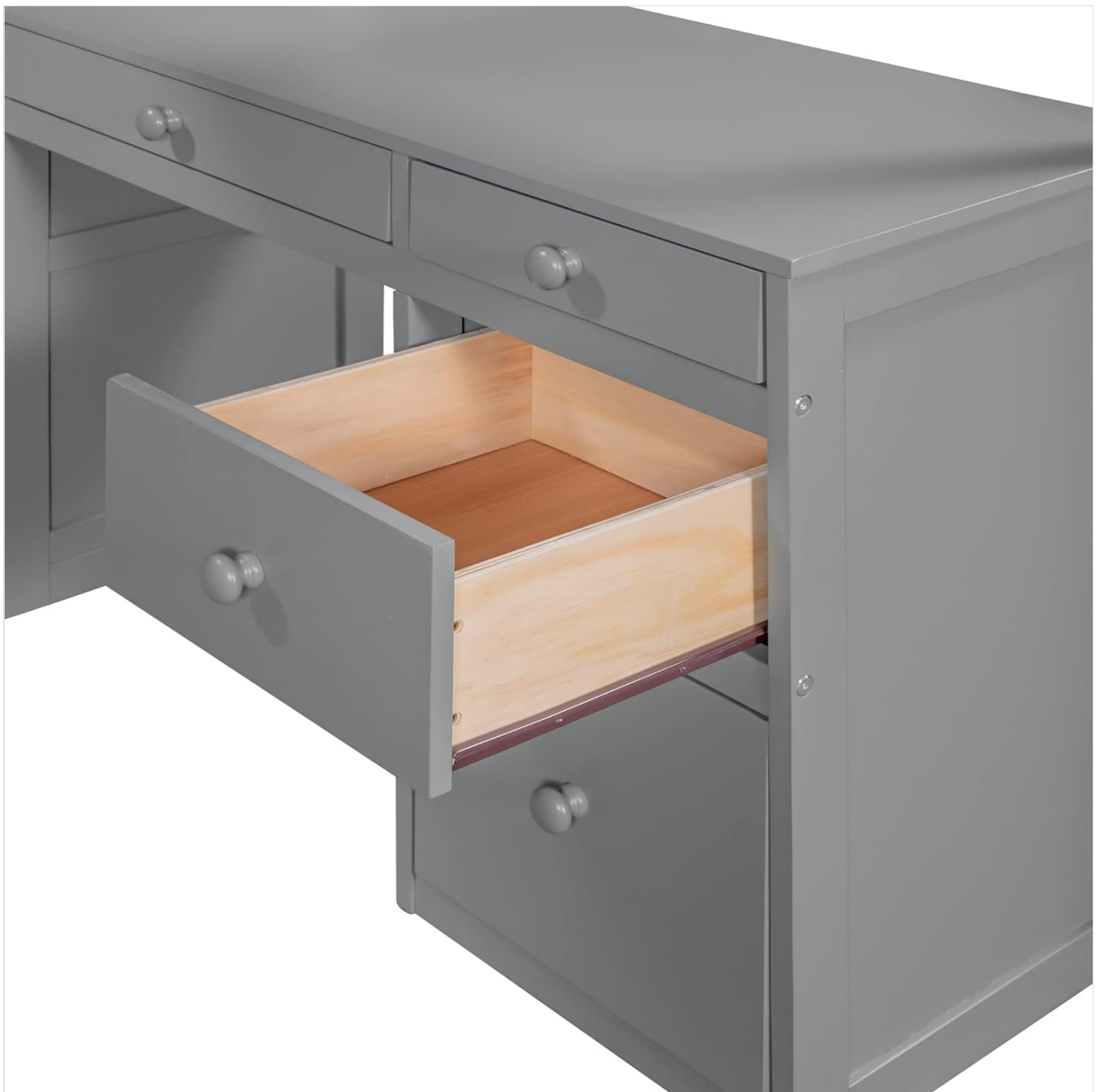
Image: A close-up of one of the desk drawers from the ModernLuxe Twin Size Loft Bed, showing its construction and internal space.