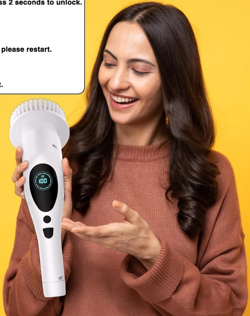
Image 6: A woman holding the electric spin scrubber, with a speech bubble listing voice broadcast messages such as "Welcome for use, please press 2 seconds to unlock," "Low speed," "Medium speed," "High speed," "Overloaded, product stopped, please restart," "Turn voice off," "Turn voice on," and "Low Battery, please charge it." The image highlights the speaker area on the device.