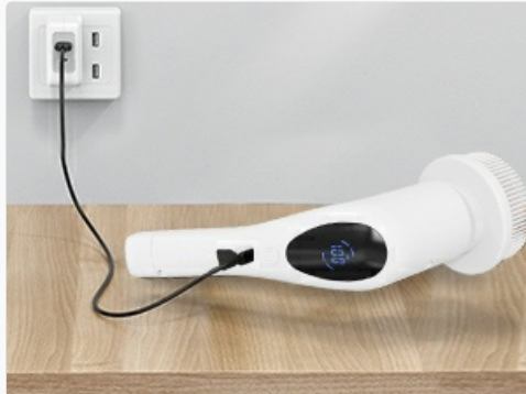
Image 7: The electric spin scrubber main unit is shown connected to a wall outlet via its USB Type-C charging cable, indicating the charging process.