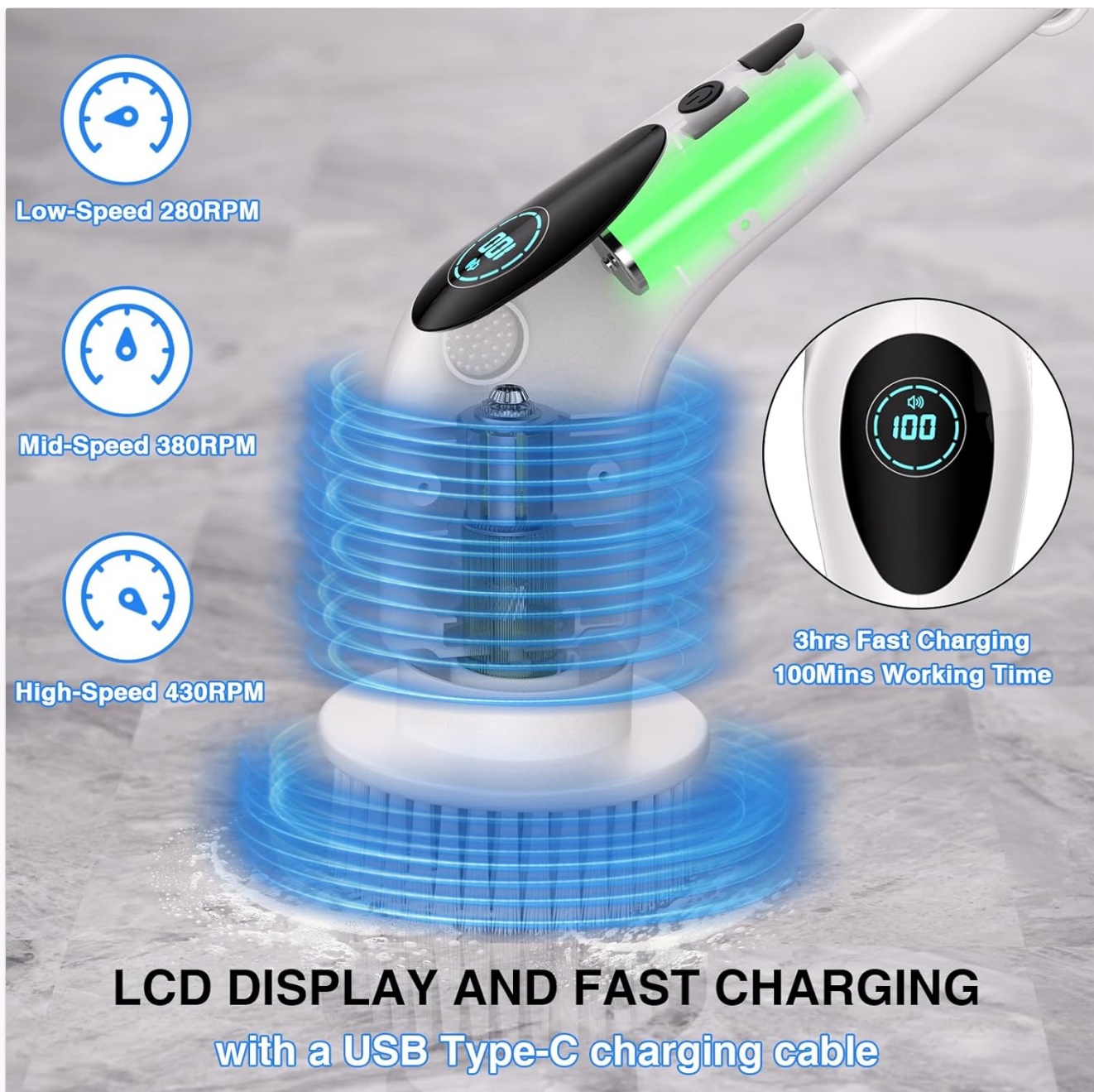
Image 5: An illustration detailing the three adjustable speeds (Low-Speed 280RPM, Mid-Speed 380RPM, High-Speed 430RPM) and information about fast charging (3 hours) and working time (100 minutes), with the LCD display showing battery percentage.