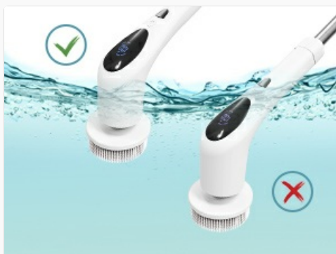
Image 8: A diagram illustrating the correct way to rinse the scrubber head under water (partially submerged) and an incorrect way (fully submerging the main unit), emphasizing its IPX7 rating for splashes and brief immersion, not full submersion.

The main unit has an IPX7 waterproof rating, meaning it is protected against temporary immersion in water up to 1 meter for 30 minutes. However, it is not designed for continuous underwater use or submersion. Avoid prolonged exposure to water.