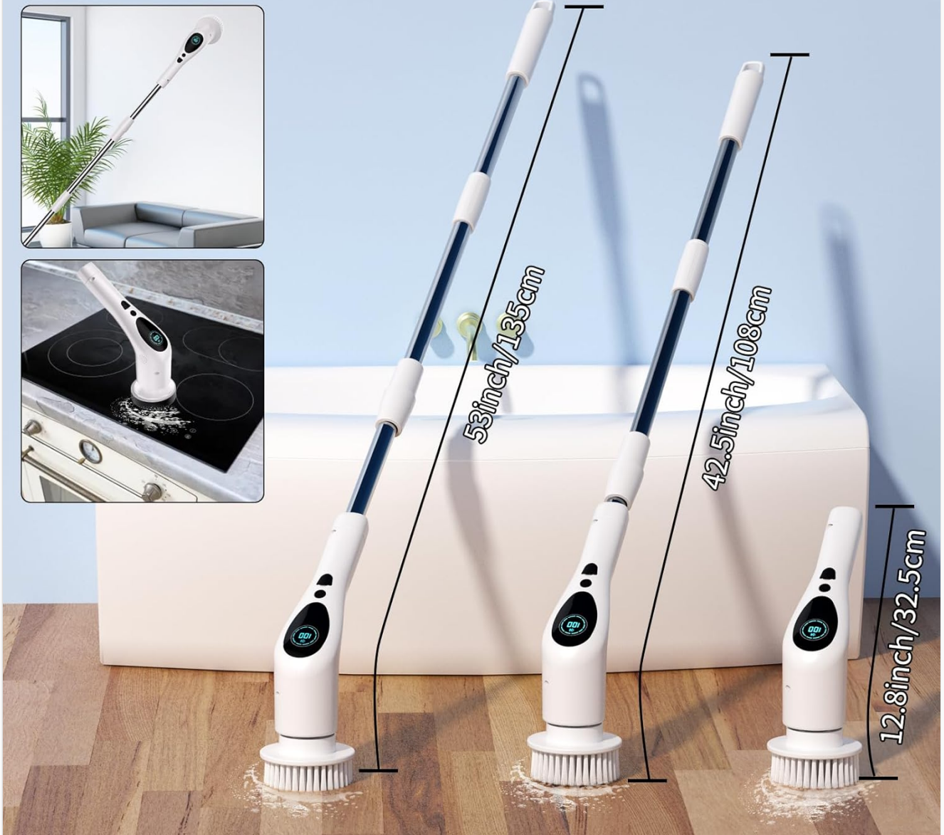
Image 3: The electric spin scrubber shown in three configurations: handheld (12.8 inches), with one extension rod (42.5 inches), and with two extension rods (53 inches), demonstrating its adjustable length for various cleaning needs.