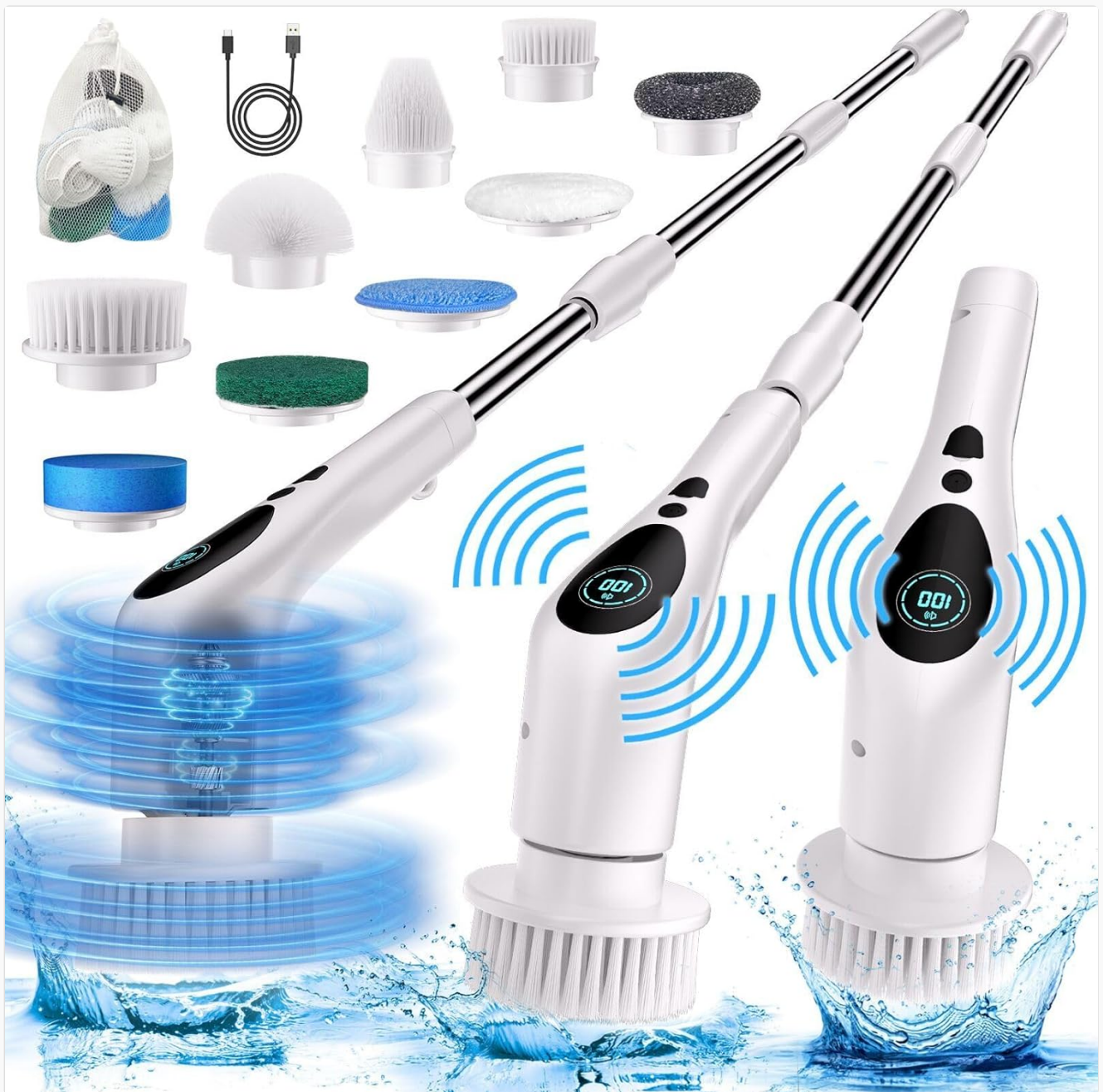
Image 1: The TiKenSo Electric Spin Scrubber main unit, two telescopic rods, USB-C charging cable, and nine various brush heads, including flat, dome, sponge, fiber, cloth, corner, wool, and wire ball brushes, along with a mesh storage bag.