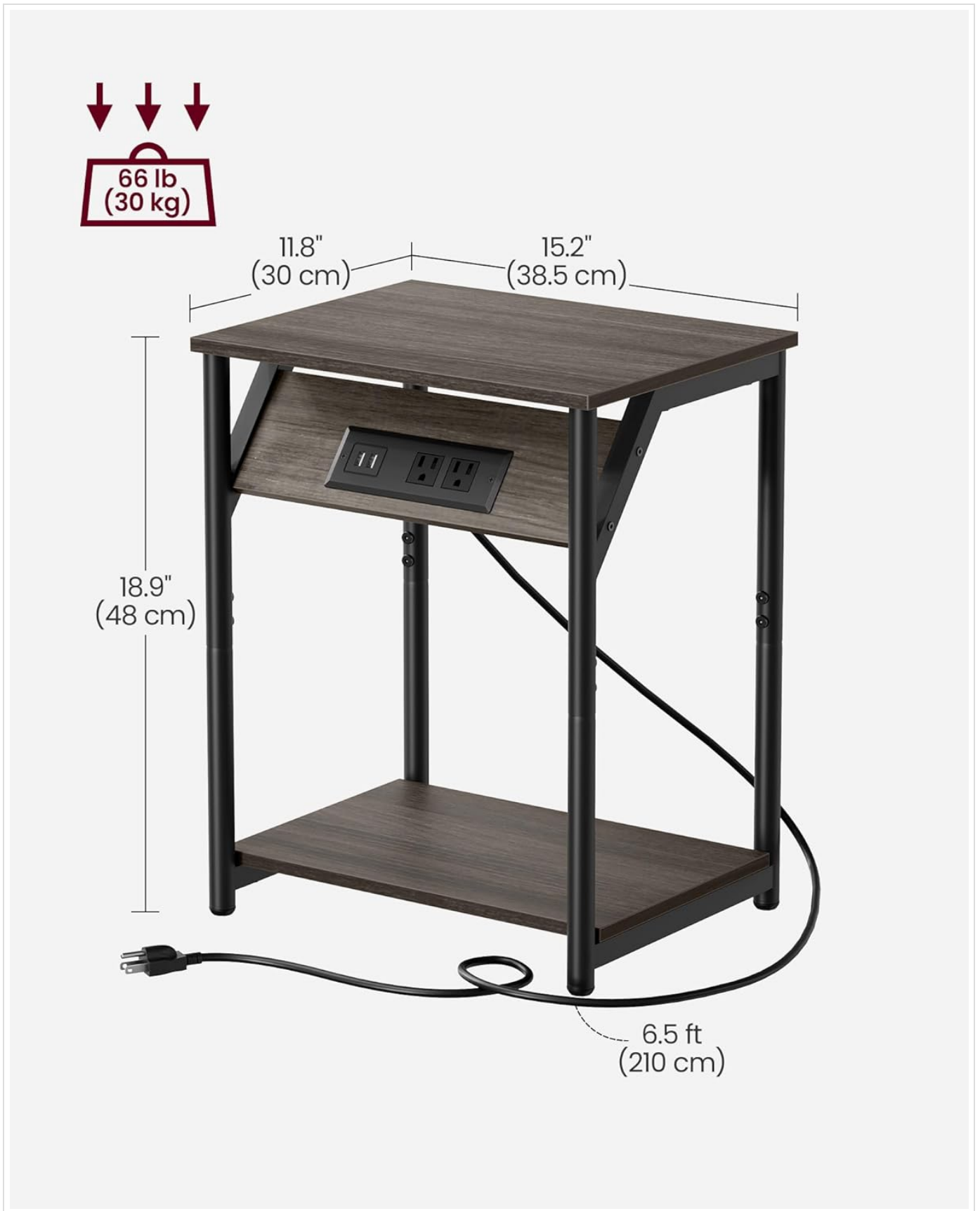
Image: A technical diagram illustrating the precise dimensions (depth, width, height) and the maximum weight capacity for both the tabletop and the lower shelf of the end table.