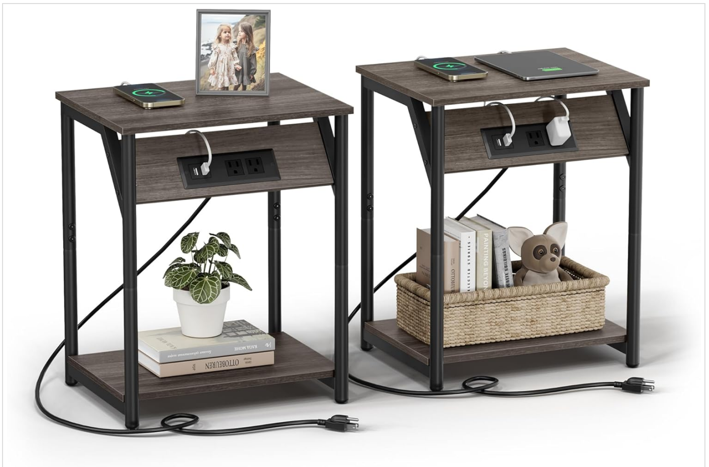
Image: A set of two VASAGLE end tables, showcasing their design and integrated charging capabilities. One table displays a plant and

Thank you for choosing the VASAGLE End Table with Charging Station. This versatile furniture piece is designed to enhance your living space with convenient power access and practical storage. Each table features two AC outlets and two USB ports, allowing you to charge multiple devices simultaneously. Its robust construction and thoughtful design make it a reliable addition to any room.