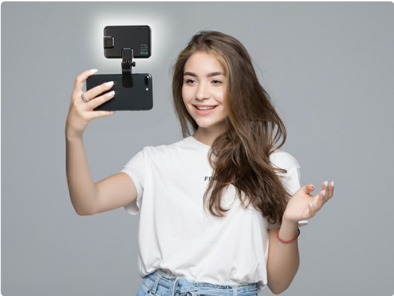
Figure 3: Visual comparison showing the enhanced lighting effect provided by the ALTSON 60 LED Portable Selfie Light.