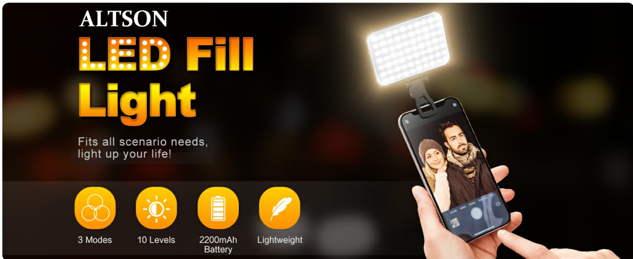
Figure 1: Universal compatibility of the ALTSON 60 LED Portable Selfie Light with different devices and adjustable angle.

3. Adjust Angle: The LED light panel features 160° rotation, allowing for precise light positioning. Rotate the knob on the clip or adapter to adjust the angle as needed.