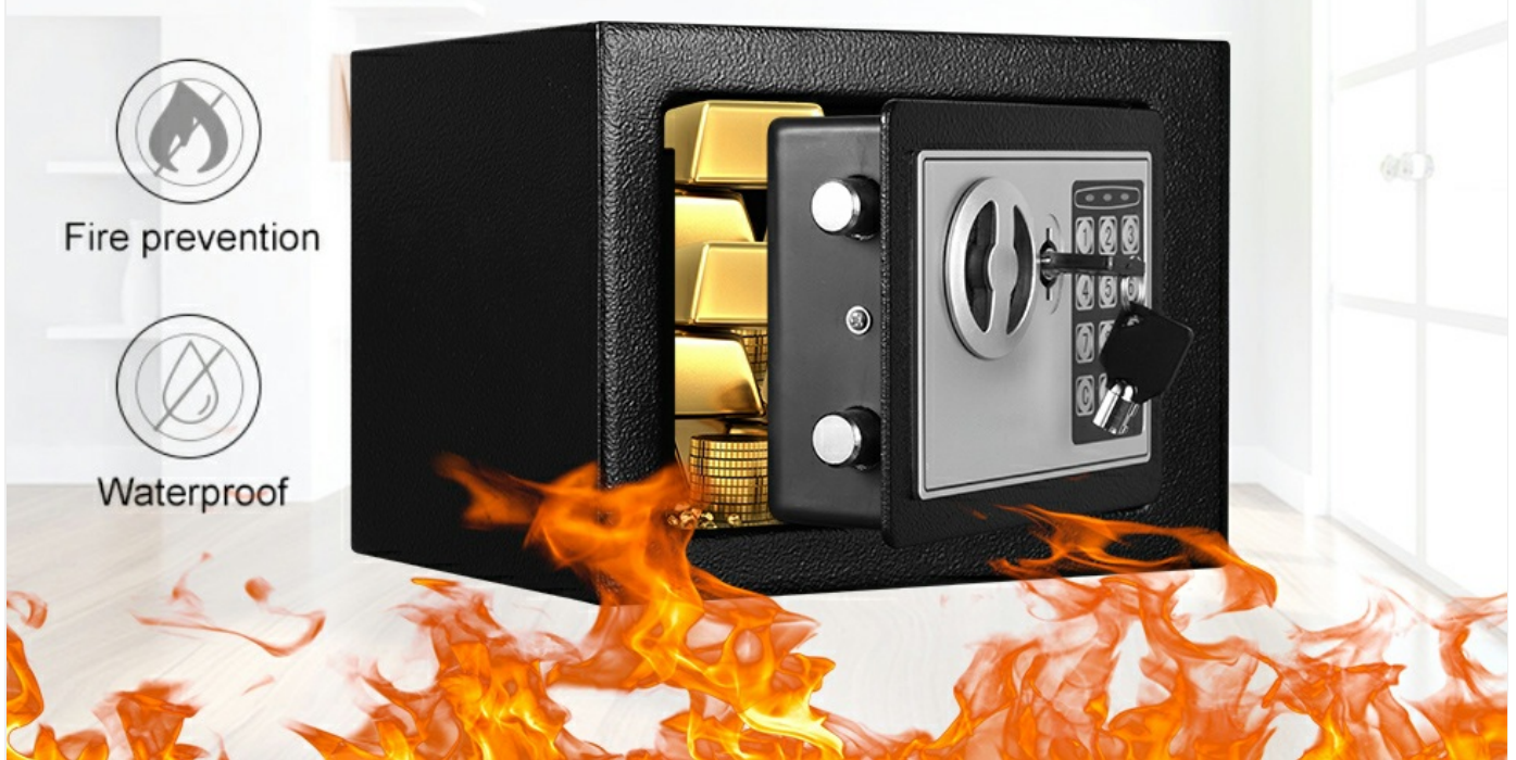
Image 4: The safe box highlighting its fire prevention and waterproof features.