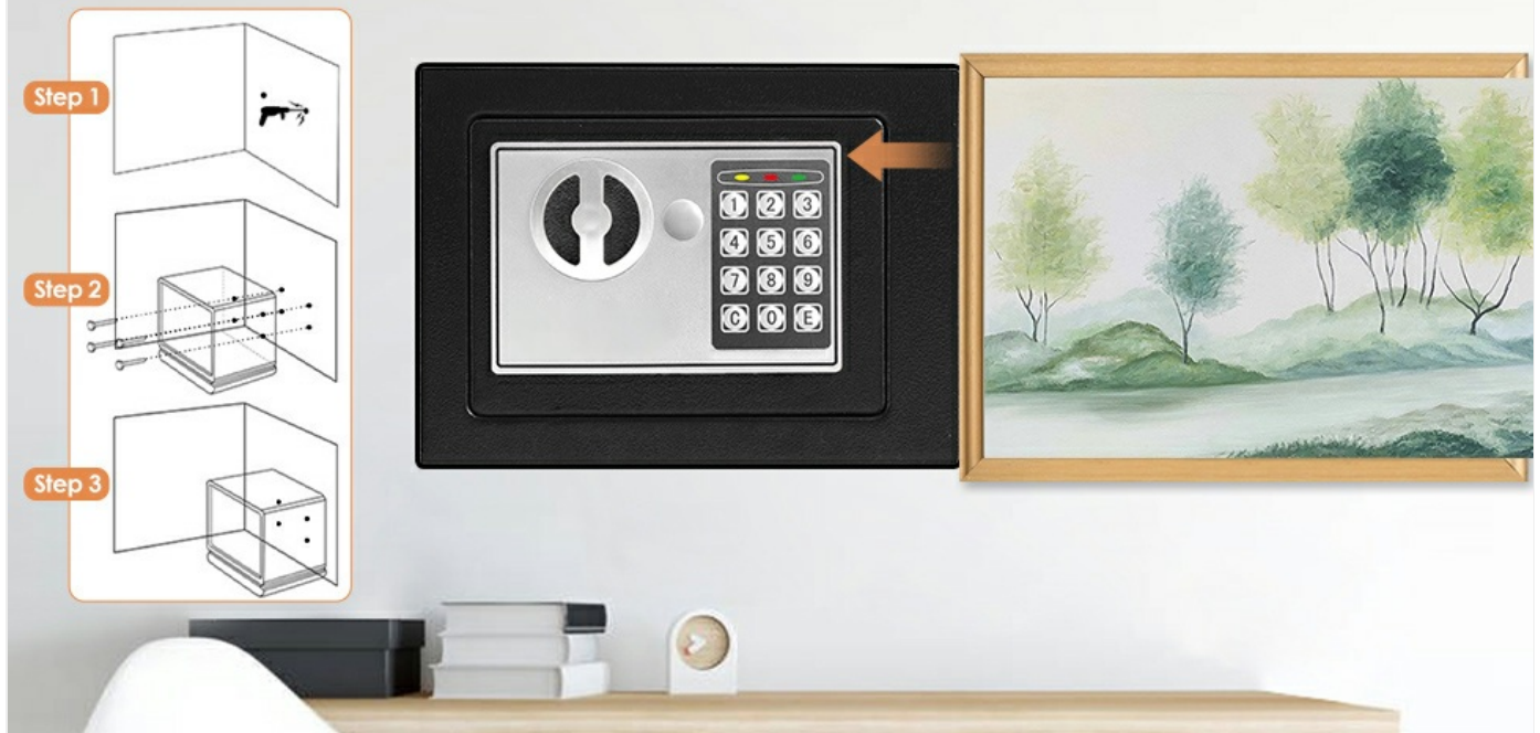
Image 3: Step-by-step guide for securely mounting the safe box to a wall using the provided hardware.

4 Mounting Bolts Included Pre-Drilled Holes For Wall Mounting