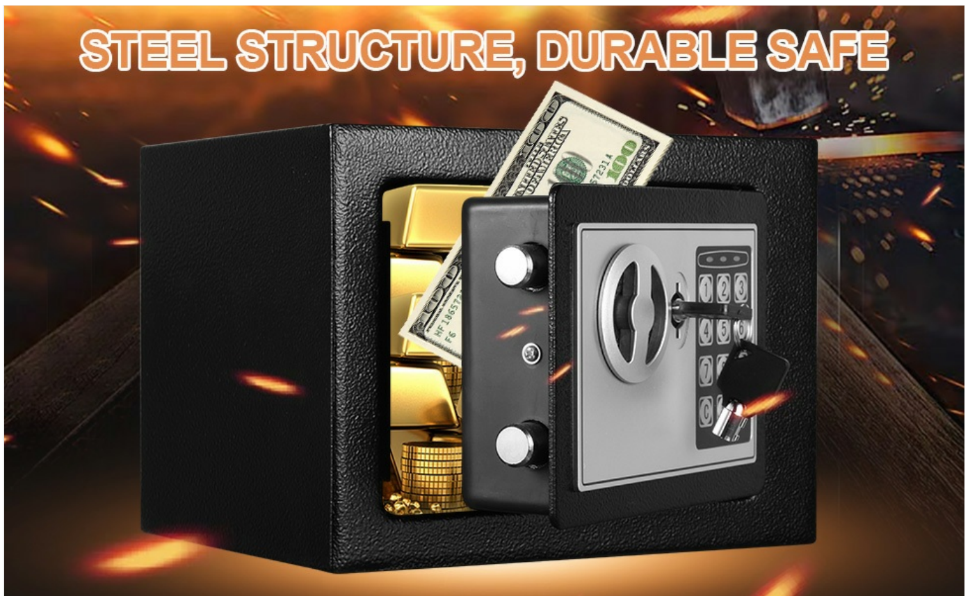
Image 5: Close-up of the safe box, emphasizing its steel structure and durability.