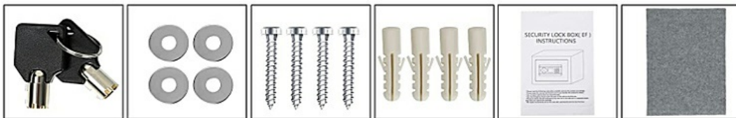
Image 2: Visual representation of the safe box and its included accessories, such as keys, mounting hardware, and manual.