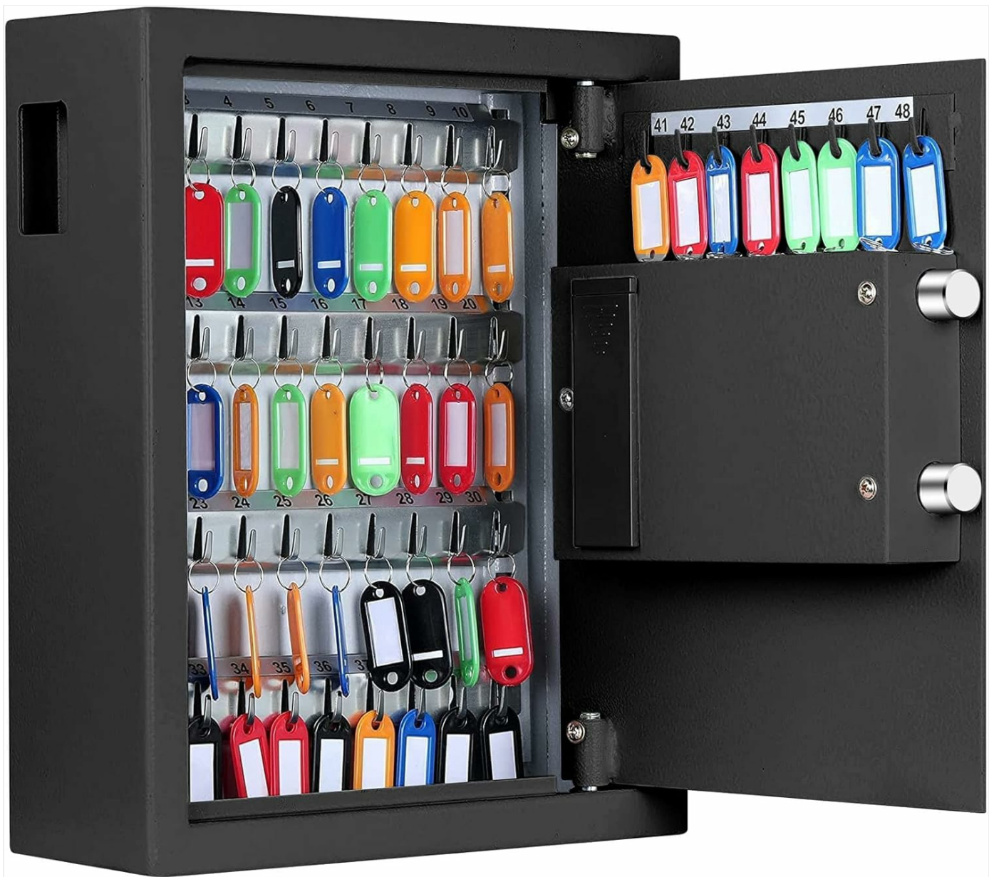
Image 1: Aprxuvot Digital Key Lock Box, showing its compact design and electronic keypad.