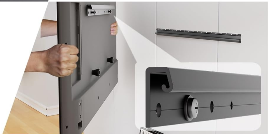
Image: A visual guide showing the three main steps for installation: Step 1 - Install Wall Bar, Step 2 - Attach Brackets to TV Back, Step 3 - Hang TV onto Wall Bar.