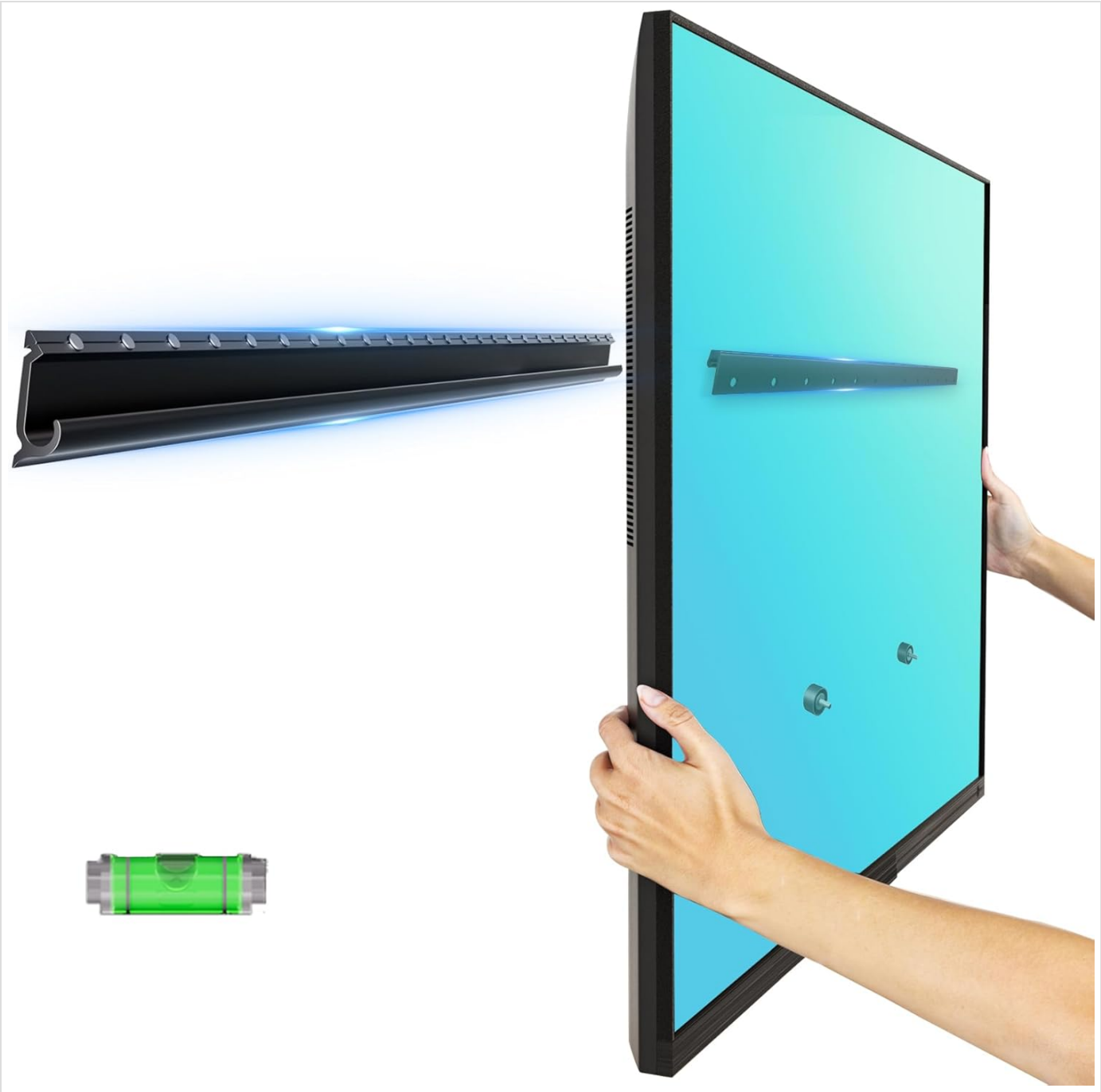
Image: Illustrates the final step of mounting the TV onto the wall bar, showing the wall bar, the TV bracket, and the included bubble level for precise alignment.

allowing the bracket to hook onto the wall bar. Ensure the TV is securely seated and level. The low-profile design will keep your TV approximately 0.8 inches from the wall.