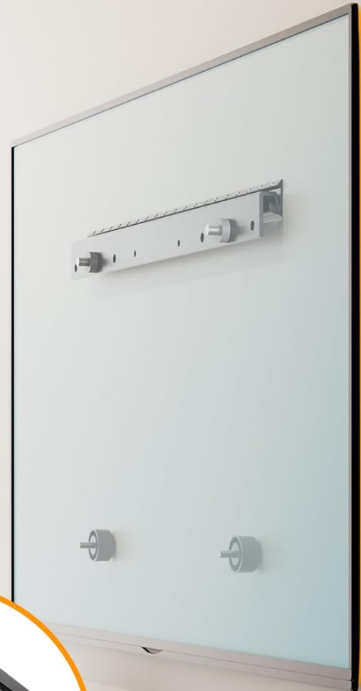
Image: Shows a TV mounted with a low profile, approximately 0.8 inches from the wall, highlighting the space-saving design and the aluminum alloy construction of the mount.