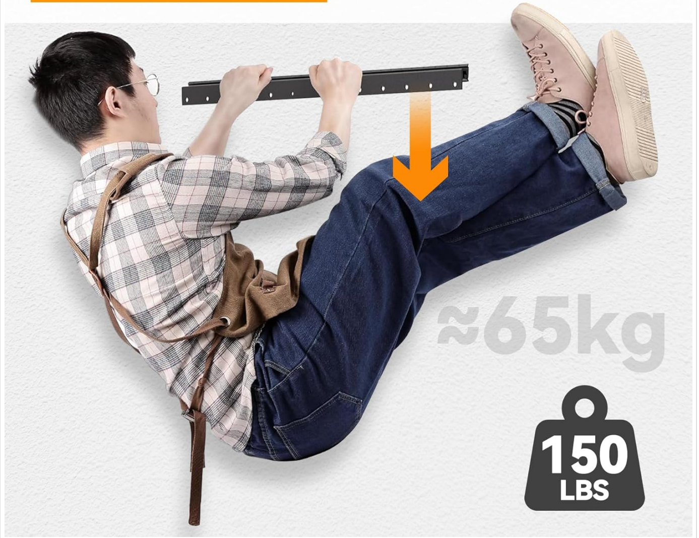
Image: A person hanging from the wall mount, illustrating its robust 150 lbs (65 kg) maximum weight capacity.