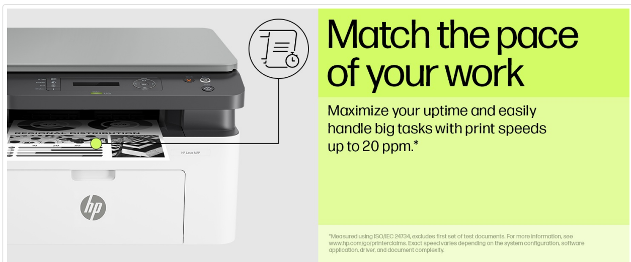
Image: The HP Laser MFP 1188a actively printing a document, illustrating its operational speed.

Manual duplex printing is supported. Follow the on-screen prompts from the printer driver to re-insert pages for printing on the second side.