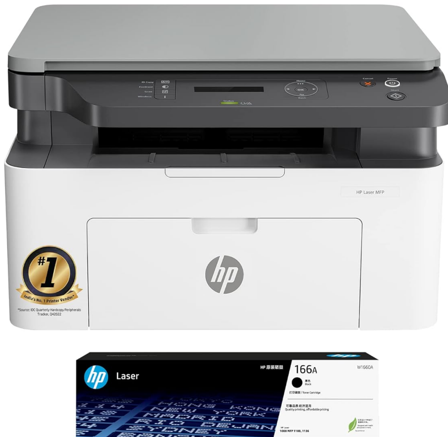
Image: The HP Laser MFP 1188a printer shown with its accompanying toner cartridge.

The HP Laser MFP 1188a is an all-in-one monochrome laser printer offering print, copy, and scan functionalities. It features a compact design suitable for various workspaces.