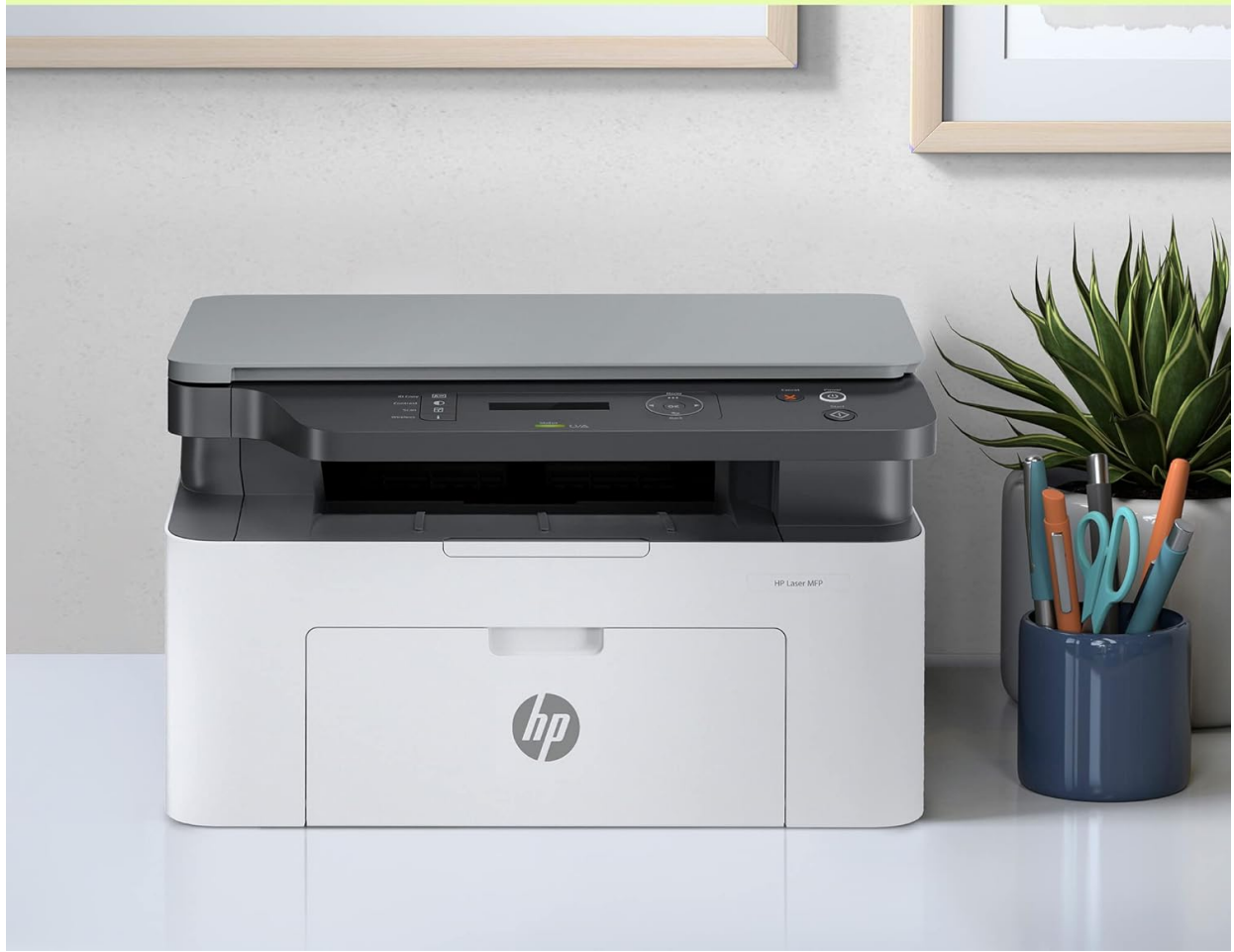
Image: The HP Laser MFP 1188a printer positioned on a desk, highlighting its compact size.

Designed to fit in your space, it delivers maximum performance while not taking much of your time.