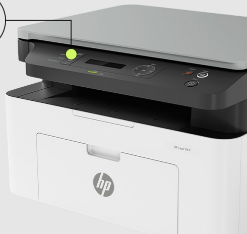
Image: A close-up view of the HP Laser MFP 1188a's intuitive control panel, featuring a 2-line LCD display and various function buttons.