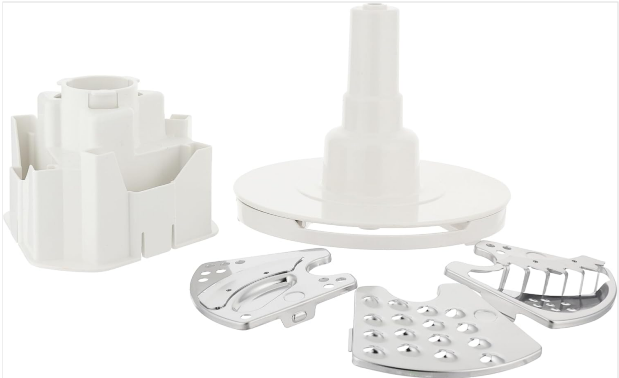
Image: A collection of the 5 versatile attachments included with the Panasonic MK-F310 Food Processor, including the main blade, whisk, slicing, shredding, and French fry blades.