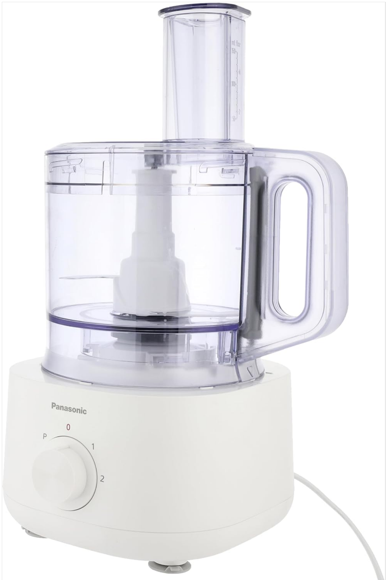
Image: A hand adjusting the control dial of the Panasonic MK-F310 Food Processor, which features settings for High, Low, and Pulse functions.