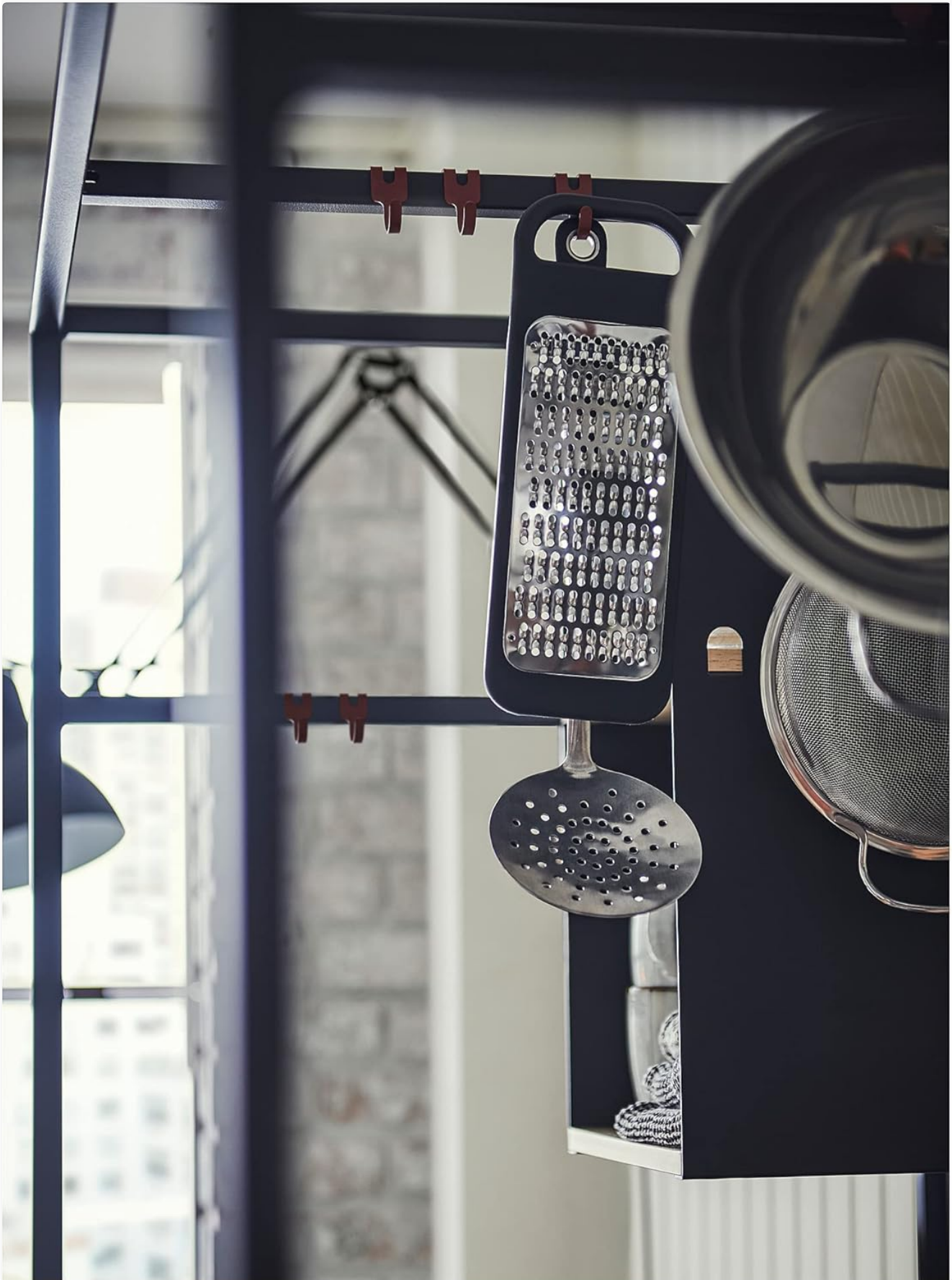
Figure 7: A close-up view of kitchen tools, including a grater and a strainer, hanging from hooks on the kitchenette's frame, demonstrating the practical use of vertical space.