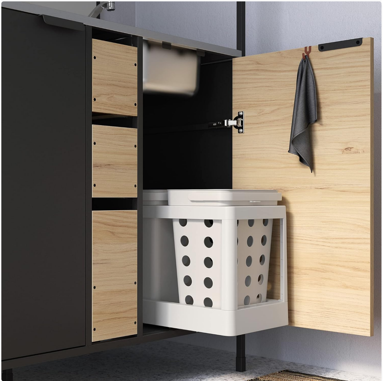
Figure 8: An open cabinet door revealing a pull-out laundry basket, showcasing the kitchenette's potential for versatile storage beyond typical kitchen items.