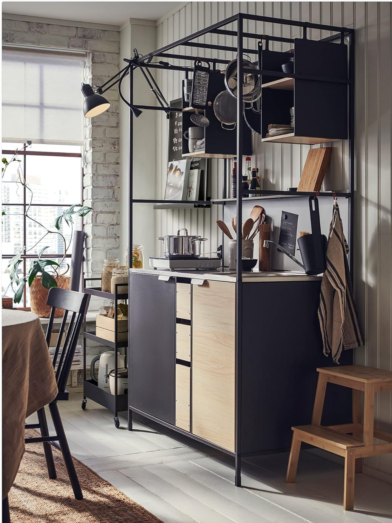
Figure 3: The kitchenette from a side angle, highlighting the integrated hanging rail for utensils and the open shelving above the main work surface.

The unit includes open shelves, closed cabinets, and drawers to organize kitchen essentials.