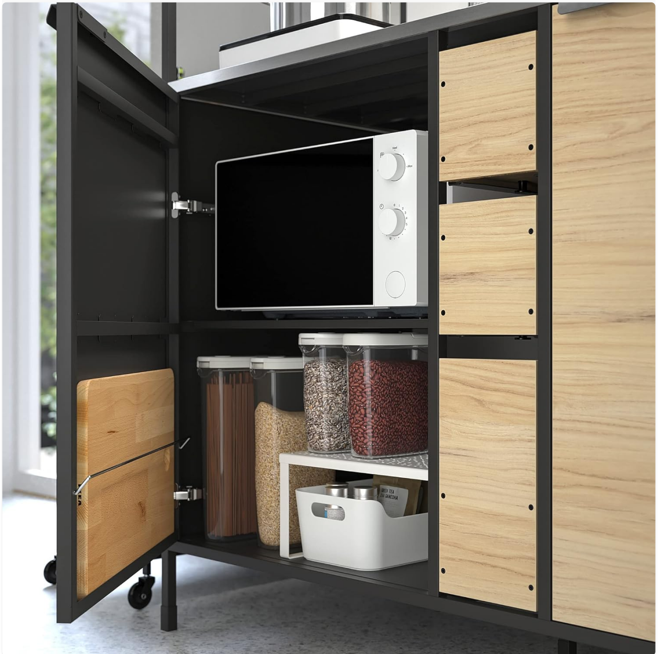
Figure 6: A cabinet section of the kitchenette configured to house a microwave oven, with additional space below for food storage containers, illustrating its adaptability for appliances.