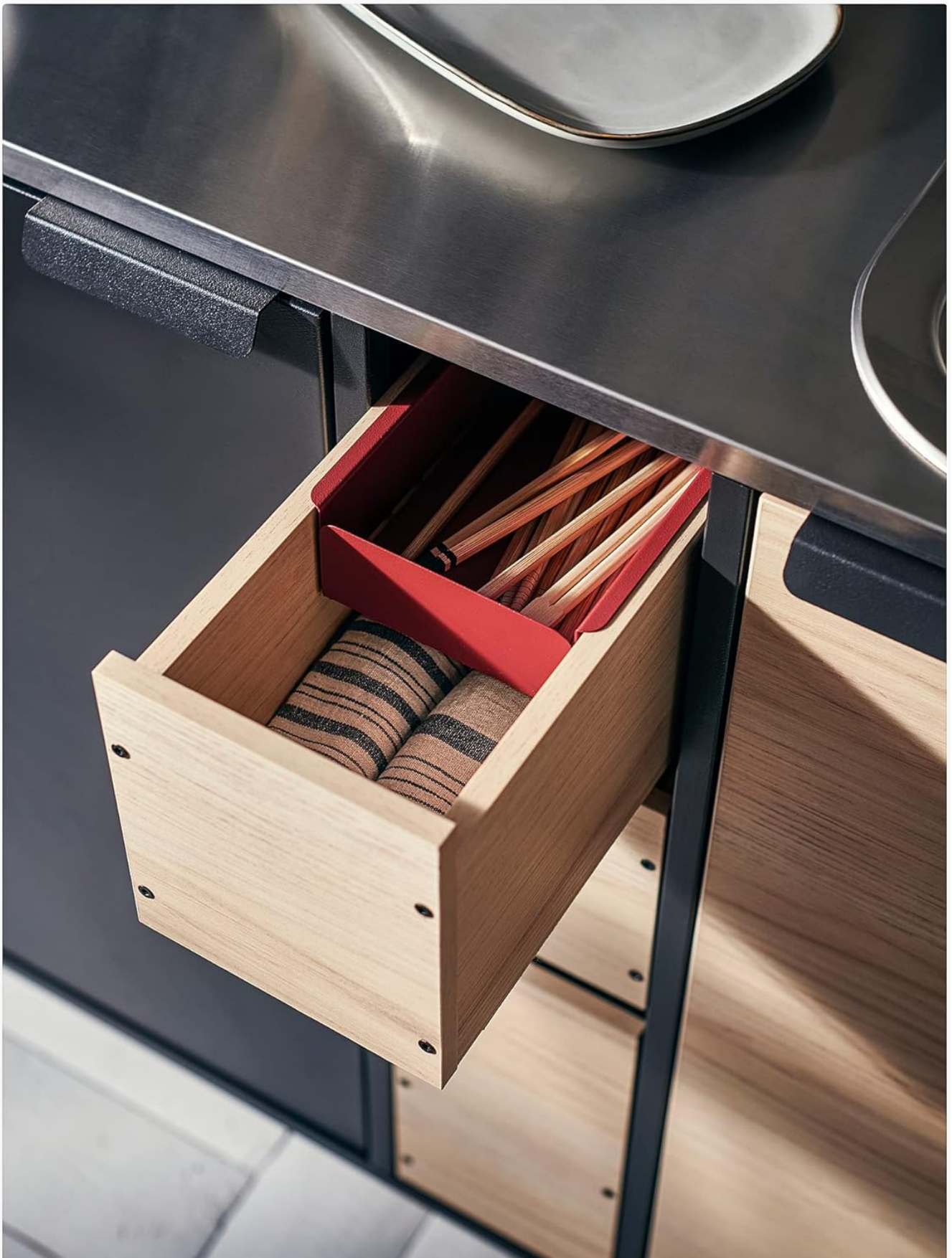
Figure 5: A pull-out drawer within the kitchenette, organized with a red insert for chopsticks and other small utensils, demonstrating efficient internal storage.