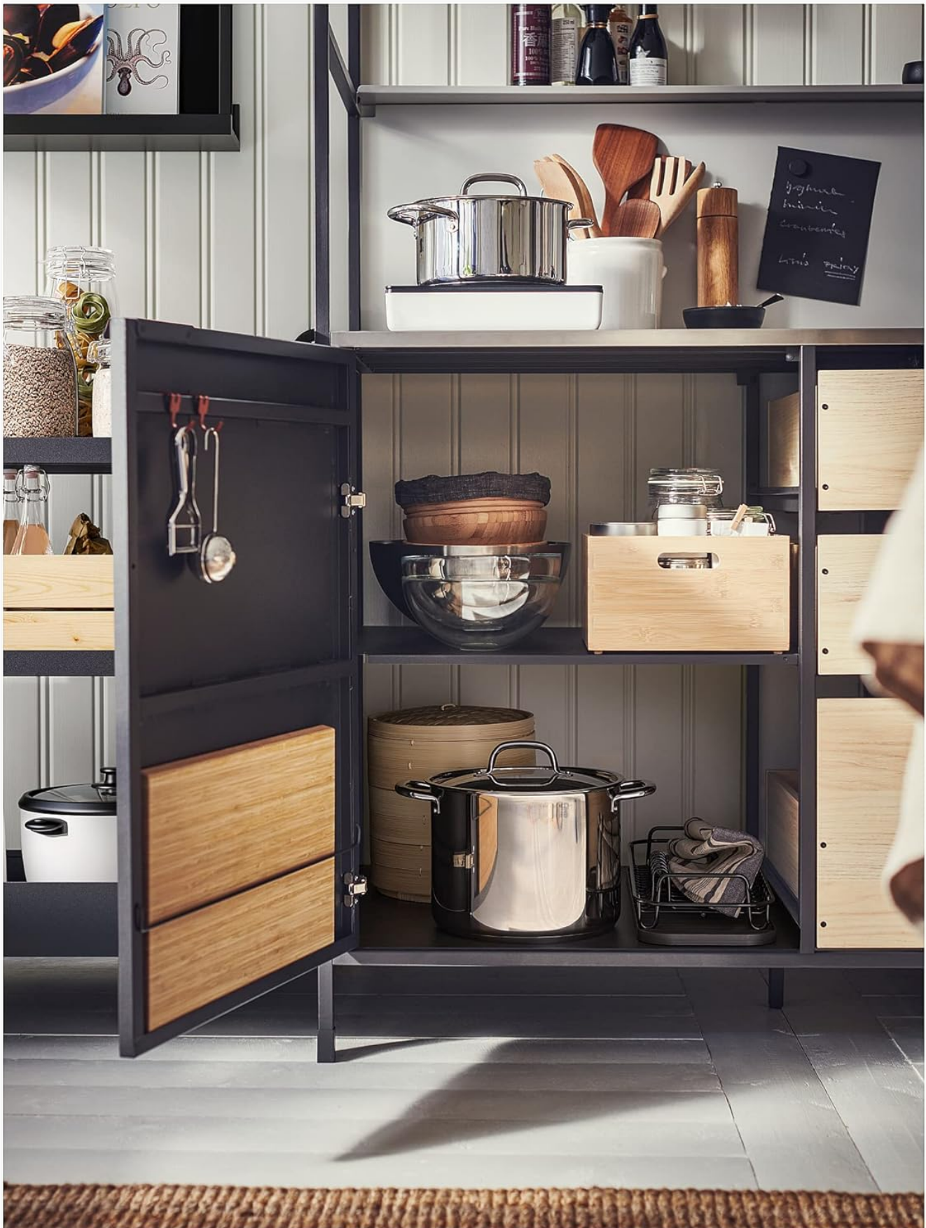
Figure 4: An open cabinet section of the kitchenette, revealing ample space for storing larger kitchenware such as mixing bowls, pots, and food containers.