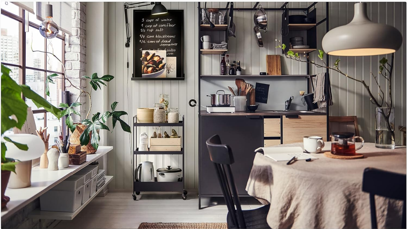
Figure 1: The IKEA ÄSPINGE Kitchenette integrated into a living space, showcasing its compact design and various storage features, including open shelving, closed cabinets, and a sink area.