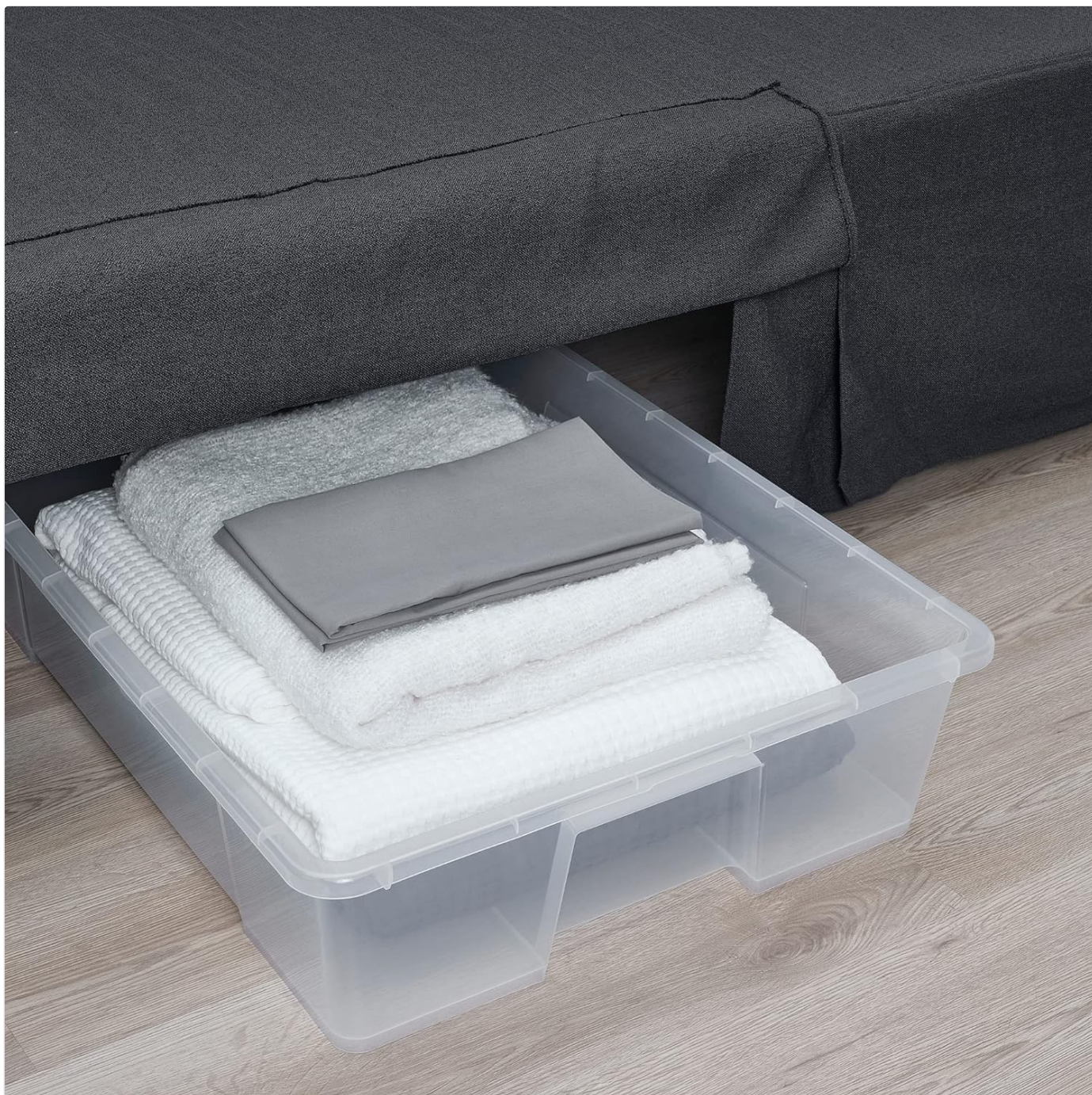
An example of under-sofa storage, showing a clear plastic container filled with folded towels and linens. This illustrates the potential for utilizing the space beneath the NYHAMN sofa-bed for practical storage.