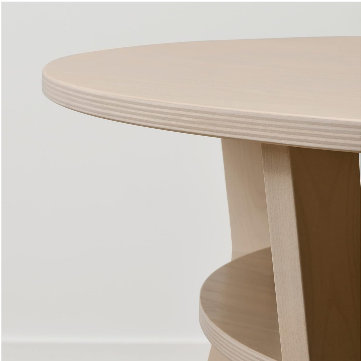
Image 5.1: A detailed view of the tabletop edge, highlighting the oak veneer finish and construction.