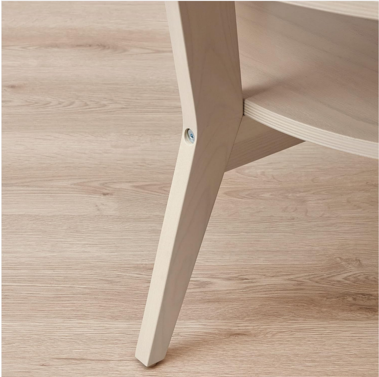
Image 3.1: Detail of a leg attachment point, illustrating the connection mechanism during assembly.