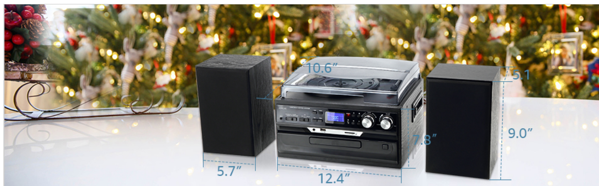
Figure 2: Dimensions of the record player unit and speakers.