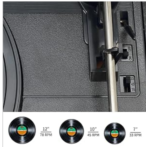
Figure 4: Turntable with a record and tonearm.