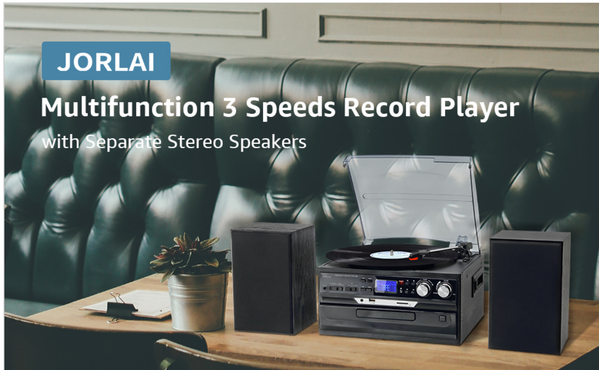
Figure 1: Front view of the JORLAI Multifunction Record Player with external speakers.

Familiarize yourself with the main components and controls of your record player.