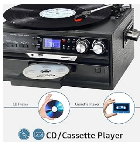
Figure 5: CD player tray for disc insertion.