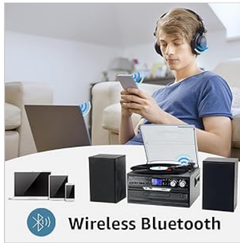
Figure 7: Bluetooth connectivity with a mobile device.