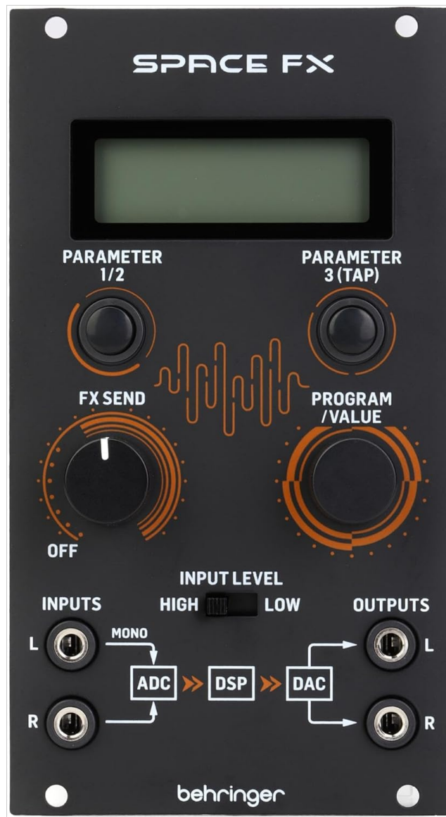
Figure 3.1: Front view of the Behringer Space FX module, showing the LCD display, control knobs, and input/output jacks.

The front panel of the Space FX module is designed for intuitive control. It features an LCD display for effect selection and parameter viewing, two rotary encoders for parameter adjustment (Parameter 1/2 and Program/Value), an FX Send knob to control the wet/dry mix, and an Input Level switch (High/Low). Input and output jacks are clearly labeled for Left (L) and Right (R) channels, with a mono input option.