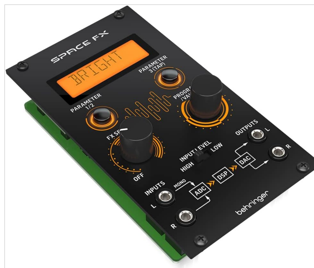
Figure 3.2: Angled view of the Behringer Space FX module, highlighting its compact Eurorack form factor.

The front panel of the Space FX module is designed for intuitive control. It features an LCD display for effect selection and parameter viewing, two rotary encoders for parameter adjustment (Parameter 1/2 and Program/Value), an FX Send knob to control the wet/dry mix, and an Input Level switch (High/Low). Input and output jacks are clearly labeled for Left (L) and Right (R) channels, with a mono input option.