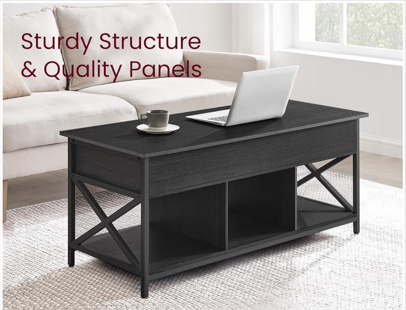
Reinforced X-Shaped Bars