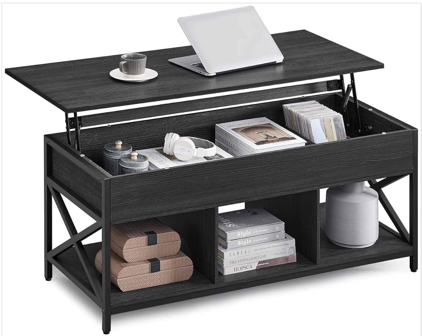
Image: Fully assembled VASAGLE Lift Top Coffee Table in black with wood grain, showcasing its design and functionality.