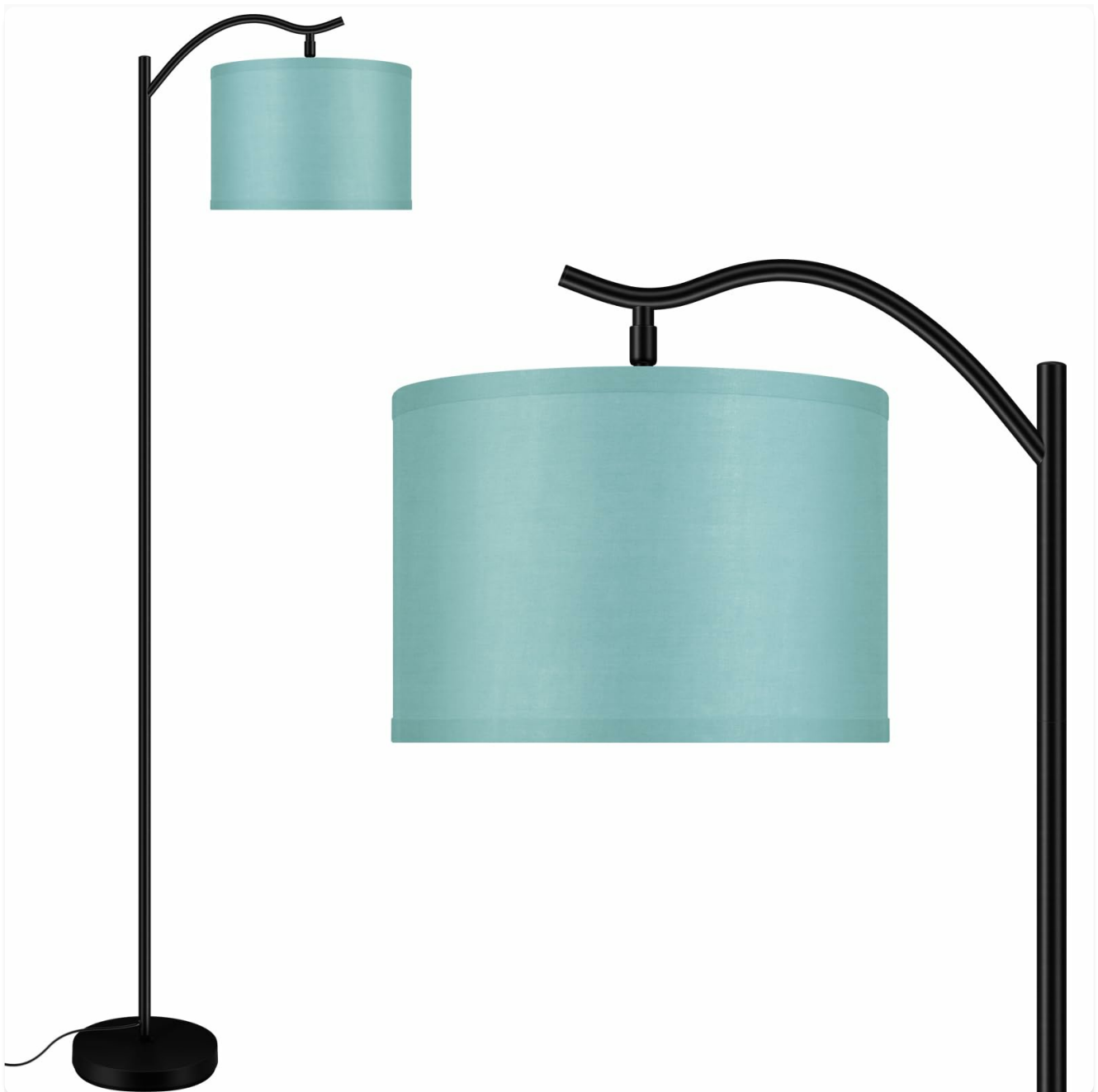
Figure 1: BoostArea LED Arched Floor Lamp (Green Shade)