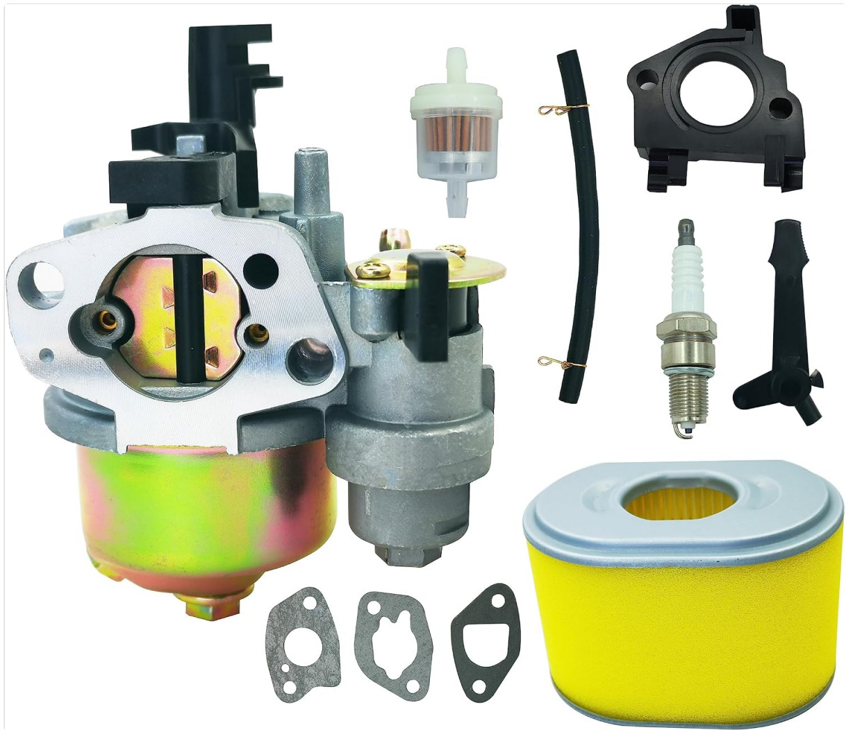
Figure 2.1: Complete XR950 Carburetor Kit. This image displays all components included in the package: the carburetor unit, an air filter, a fuel filter, a spark plug, and a set of gaskets.