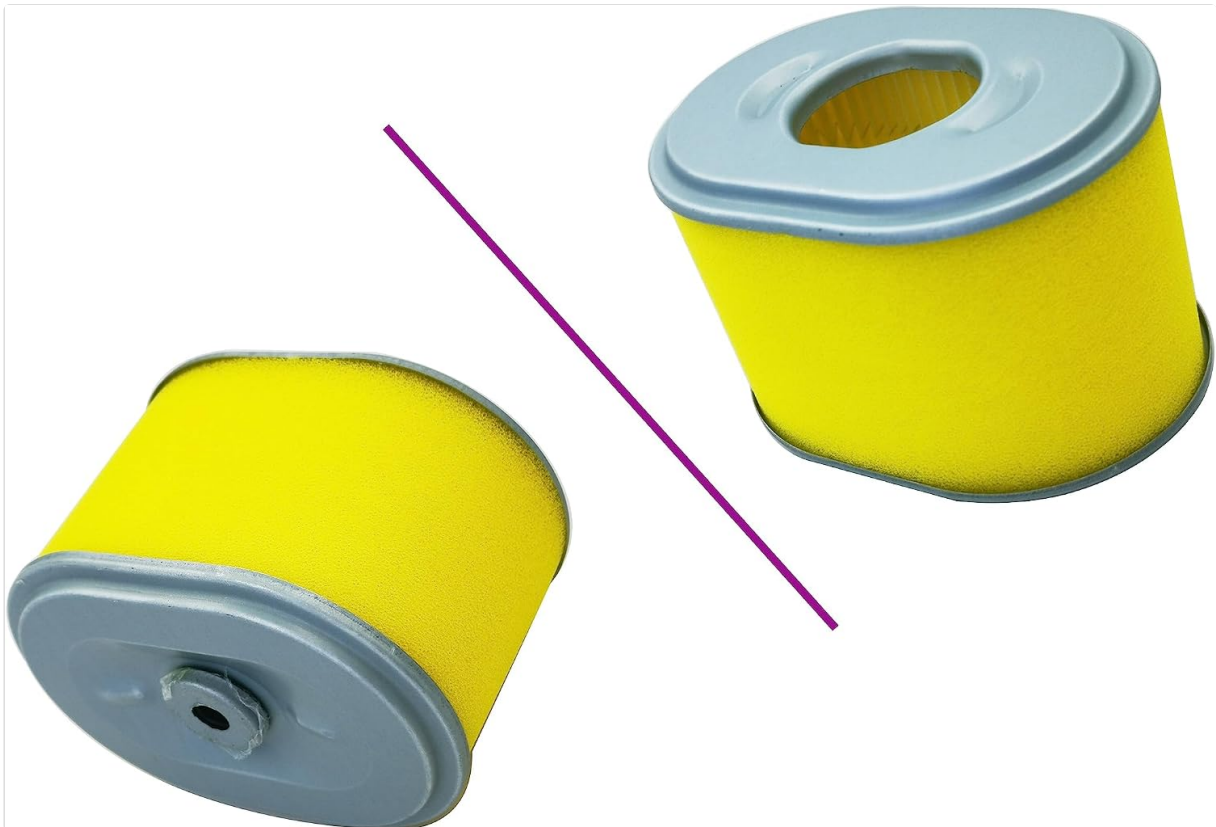
Figure 4.1: The included air filter. This component is crucial for protecting the engine from dust and debris.